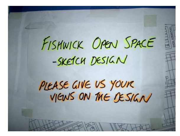
Figure 1. Existing attempts to encourage feedback were evident around the community.

Opinions on traditional forms of consultation and participation proved to be generally negative. Although some residents reported voting regularly, others displayed disillusion with the political process and a low sense of self-efficacy: residents generally felt that their input had no effect and their voices were ignored. As a disadvantaged area, residents were regularly consulted on many local issues but rarely saw any action taken as a result of their input, causing "consultation fatigue". The councillors and housing associations identified the importance of gathering feedback from members of the public and felt that the device could potentially help with this. There had been many existing attempts to engage the residents in