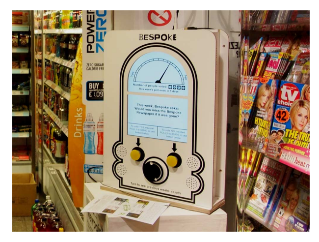
Figure 3. Viewpoint deployed in a local shop.

Feedback on the prototype itself was more critical, and much of this criticism related to the method of interaction. Although most residents owned a mobile phone, many older residents were not able to send text messages and some users needed to be coached to send their votes to the device. Furthermore, even those who were comfortable with text messaging felt that it was more suitable for remote interaction and that using text messages to communicate with a collocated device was unusual. Several users independently suggested that the device could have voting