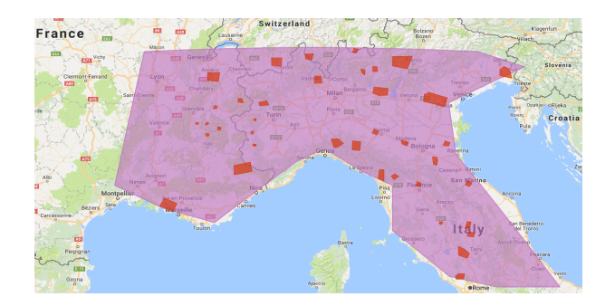
Fig. 2 : Experimental datasets, training images were extracted from the overall pink region while test regions are the small orange ones. Each image covers GlobCover reference areas.

The Sentinel-2 data is interpolated to 20m/px resolution, while the GlobCover ground truth is at 300m/px resolution. The proposed networks are trained considering two strategies: the light ones are optimized at the image resolution level whatever the ground truth resolution is ( i.e. the models are trained against an interpolated ground truth), thus trying to estimate at the scale of the input even if the reference is too coarse. The largest network (SegNet) however estimates multiple maps at several scales that are averaged and interpolated to the ground truth resolution. Training at a lower resolution