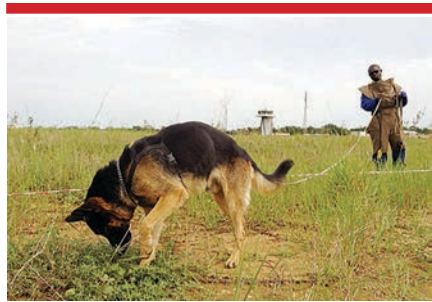
A demining dog with a handler.

2. The High Contracting Parties undertake to consult each other and to co-operate with each other bilaterally, through the Secretary-General of the United Nations or through other appropriate international procedures, to resolve any problems that may arise with regard to the interpretation and application of the provisions of this Protocol.