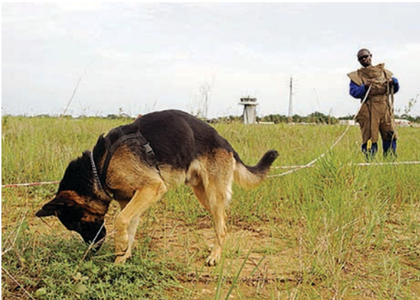
A demining dog with a handler.