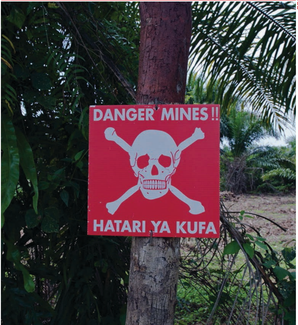
"Danger Mine" sign. UNMAS-DRC