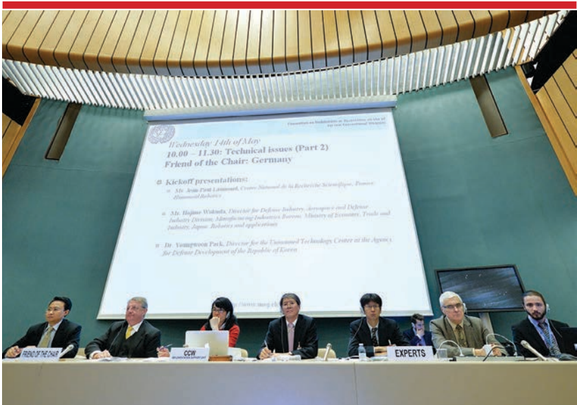
Panel on Technical Issues during the 2014 CCW Meeting of Experts on lethal autonomous weapons systems.

You may also contact the CCW ISU at this E-mail address: ccw@unog.ch.