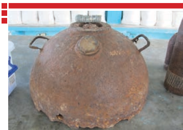
Sea mine, Palau, 2012. Hine-Wai Loose, CCW Implementation Support Unit