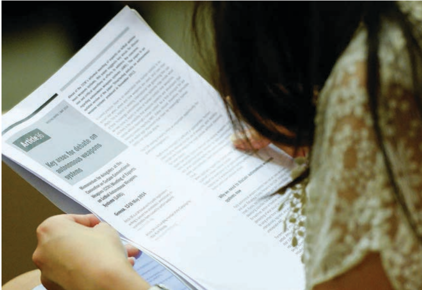
2014 CCW Meeting of Experts on lethal autonomous weapons systems.

7. The provisions of paragraphs 2-6 of this Article shall not prejudice additional Protocols adopted after 1 January 2002, which may apply, exclude or modify the scope of their application in relation to this Article.