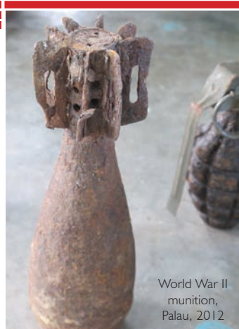
Hime-Wai Loose, CCW Implementation Support Unit

Prohibits or restricts the use of conventional weapons which are considered excessively injurious or whose effects are indiscriminate. The Convention provides a framework, while its Protocols set out the specific prohibitions, restrictions and other provisions.