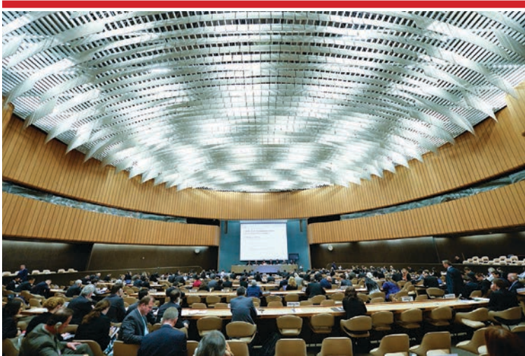
2014 CCW Meeting of Experts on lethal autonomous weapons systems.