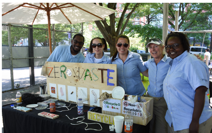
Battery Park City Authority | TRUE Gold | New York, NY

In a circular economy, the focus shifts away from the extraction of raw material resources and toward the environmental and societal benefits of redesigning processes to eliminate waste from being produced in the first place and repurposing existing products and materials for a safer and more sustainable economic system. While a circular economy is the goal, it will take time and