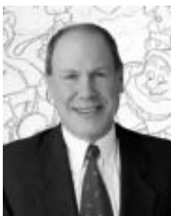
Michael D. Eisner

Mr. Chen, 49, has been Chairman, Chief Executive Officer and President of Sybase, Inc., a software developer, since November 1998. From February 1998 through November 1998, he served as co-Chief Executive Officer. Mr. Chen joined Sybase in August 1997 as Chief Operating Officer and served in that capacity until February 1998. From March 1995 to July 1997, Mr. Chen was President of the Open Enterprise Computing Division, Siemens Nixdorf, a computer and electronics company, and Chief Executive Officer and Chairman of Siemens Pyramid, a subsidiary of Siemens Nixdorf.