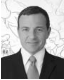
Robert A. Iger