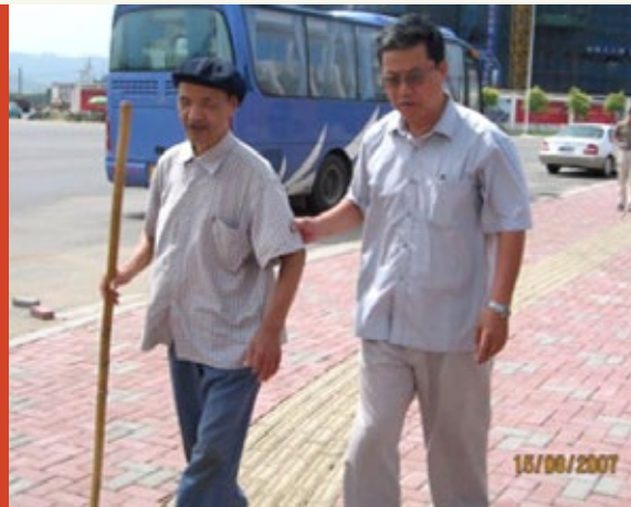
A blind resident with a cane tests the textured pavements on a newly constructed sidewalk of Jinzhou.