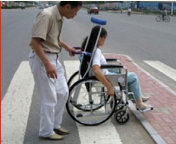
A resident of Jinzhou inspects new safety islands and curbs in a wheel chair.

To assist the project cities in enhancing: (i) the performance and quality of their existing urban transport infrastructure in terms of mobility, access, and safety; (ii) the efficiency and effectiveness of their urban public transport and road maintenance services; and (iii) the responsiveness of their urban transport systems to the needs of populations without access to private motorized vehicles.