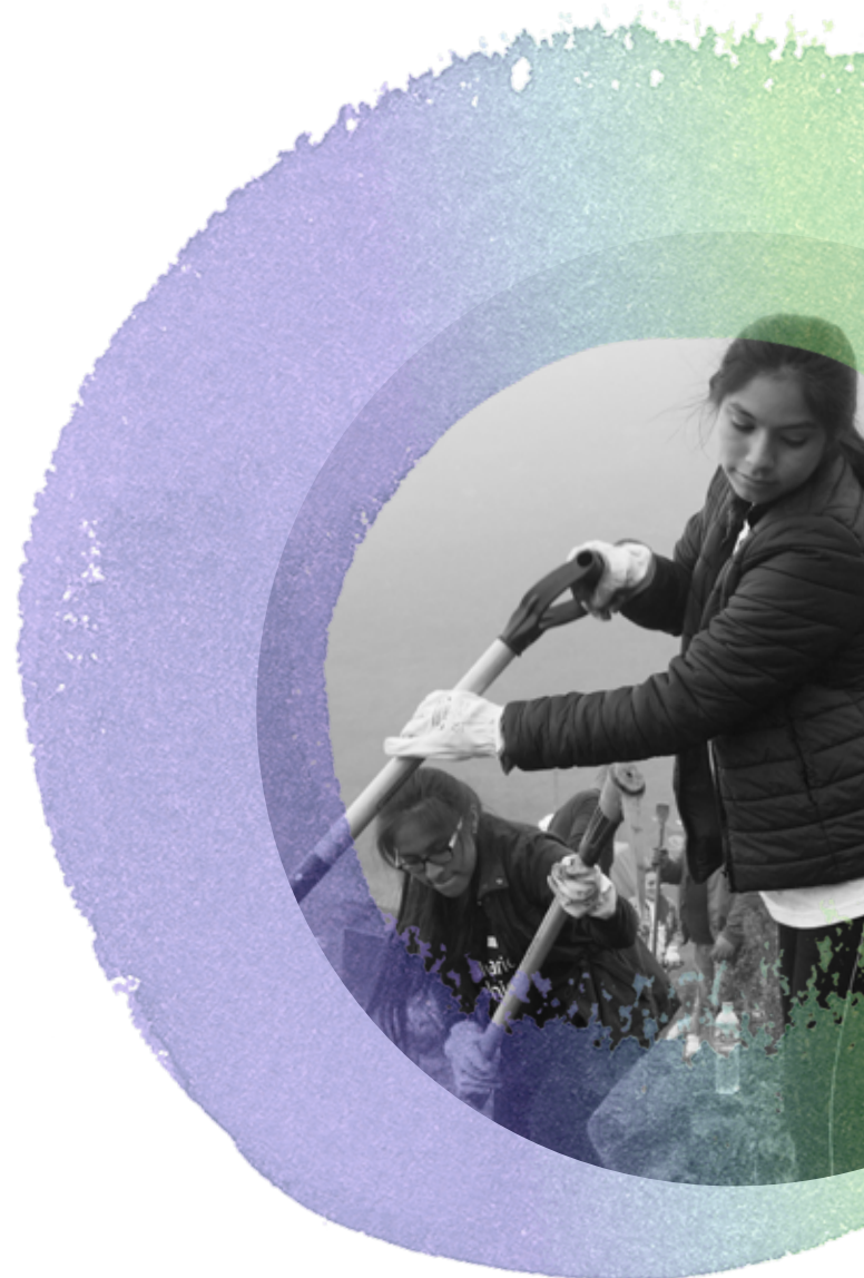
A volunteer works on a nature conservation project in Peru, 2021.

The first part of the report consists of three framing chapters that present the main ideas that underpin the report. The introduction discusses how to investigate the potential contribution volunteerism can make to building equal and inclusive societies. It is followed by two quantitative chapters: one on global volunteer estimates and the other on a volunteer perception survey on volunteerism in the Global South during the COVID-19 pandemic. These chapters shed light on volunteer data, trends and patterns.