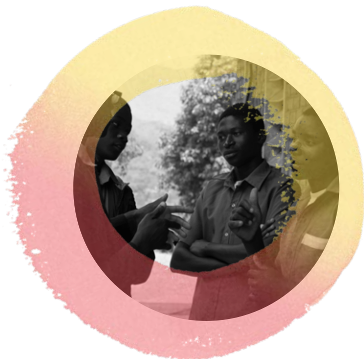
A volunteer discusses gender-based violence with students in Malawi, 2021.

The second part of the report focuses on the three models of volunteer–state partnerships: deliberative governance, co-production of social services and social innovation. Drawing on research case studies from Africa, Asia and the Pacific, Europe and the Commonwealth of Independent States (CIS), Arab States, and Latin America and the Caribbean, the three chapters investigate the components of volunteer–state models and discusses their drivers, challenges and barriers.