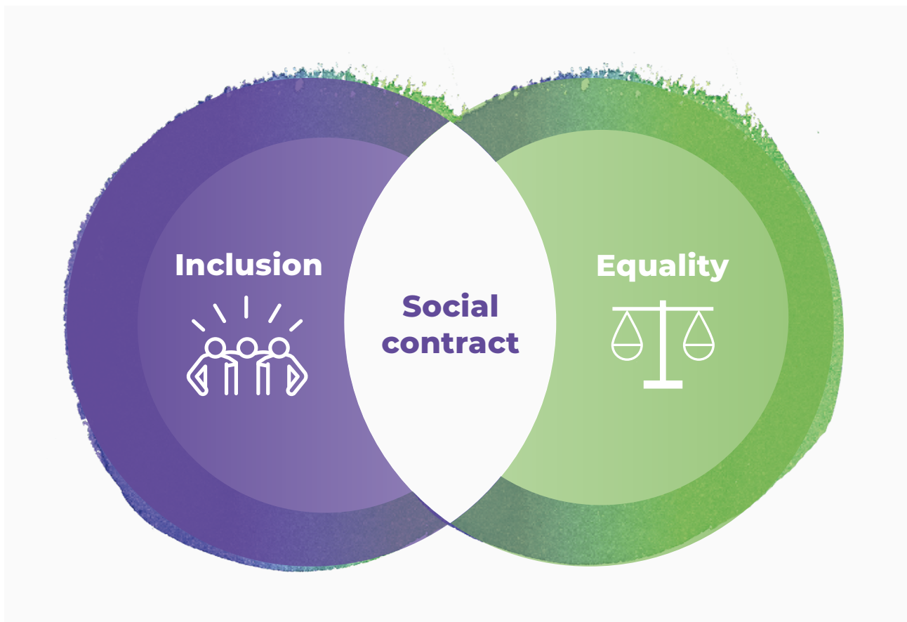
Figure 2. A social contract for equal and inclusive societies

Volunteer–state partnerships are an important mechanism for expanding volunteers' roles in achieving the Sustainable Development Goals and can play a role in laying the foundation for a 21 st -Century social contract that is founded on inclusion and equality and is responsive to the needs of communities.