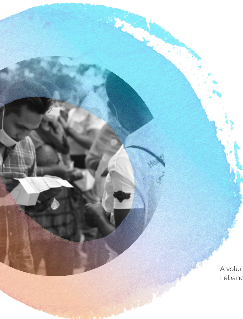
A volunteer helps migrants access COVID-19 vaccines in Lebanon, 2021.

Collaboration underpins volunteer–state partnerships in co-production. Across the case studies, volunteers and state authorities leverage the partnerships for mutually beneficial outcomes in co-production. By advocating for services for migrants and persons with disabilities and helping community members to navigate highly bureaucratic processes in governments that are often difficult to access, volunteers' efforts contribute to effective delivery of services to marginalized groups while enabling governments to better integrate disadvantaged groups in society through the provision of services. While they play a key role across different stages of the co-production process, from co-development of ideas to co-implementation, volunteers' engagement with state authorities—which often is due to their dissatisfaction with the way local authorities address development challenges—could be viewed as a deficit of trust among states, service users and volunteers.