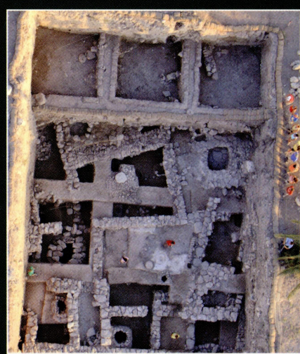
Emery and Claire Yass Publications in Archaeology