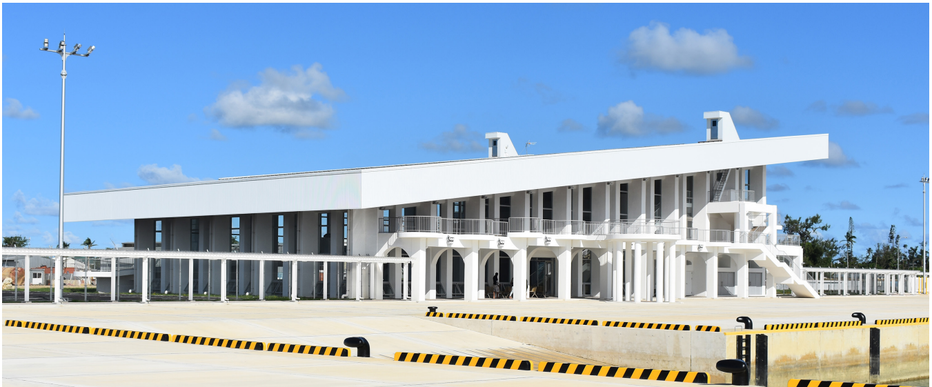
“King Taufa’ahau Tupou IV Domestic Terminal”- venue of the Pacific SIDS Regional Preparatory Meeting”.