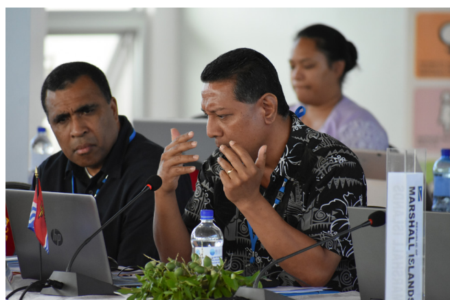
High Commissioner Teaabo (Kiribati)