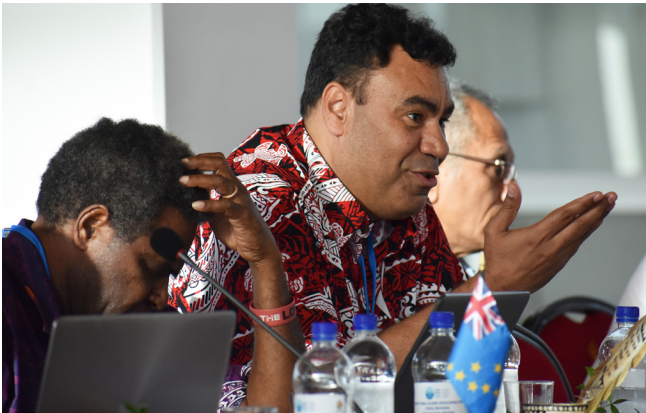
Mr. Kalsakau (Vanuatu)