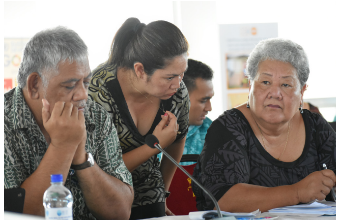
PIFS and Samoa Delegation