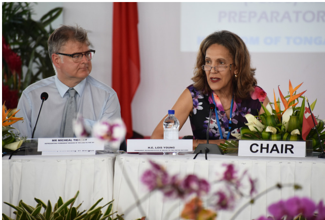
Co – Chairs

homegrown perspective and experience of a lifetime. As civil society often represents those that are marginalized, they also ensure that no one is left behind; and Partnerships need to be accountable to their beneficiaries and maintaining dialogue with communities throughout the lifetime of the partnership is important.