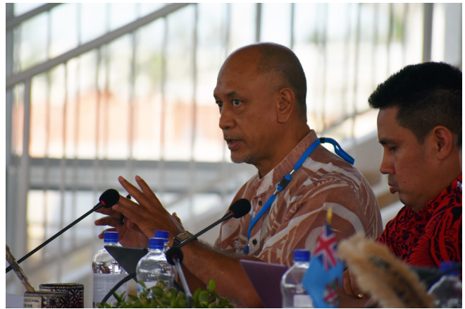
Mr. Iosefa Maiava (UN-ESCAP)

The interventions of the resource representatives and the ensuing discussion that followed highlighted the following: The region recognizes the importance of trade, particularly aid for trade, and the need for trade strategies that build productive capacity and link trade efforts more closely to poverty reduction and inclusiveness. The region also recognizes the importance of data and statistics, and localizing SDG indicators. There is a need to develop national indicator databases, to help with meeting reporting obligations for international agreements. There is a need for greater UN presence in the north Pacific, as the multi-country office in Fiji is not sufficient. South-South cooperation also offers opportunities for SIDS in the Pacific to advance knowledge and implementation of the SAMOA Pathway.