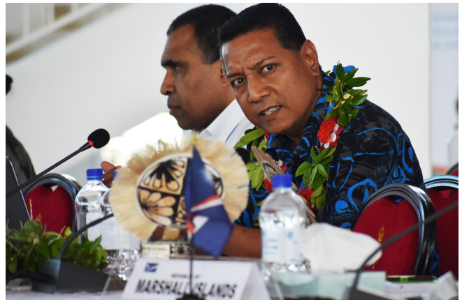
High Commissioner Teaabo (Kiribati)