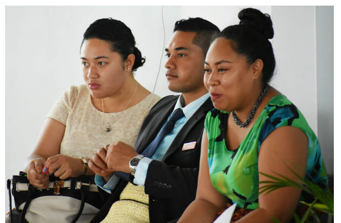
Host Country Support Staffs