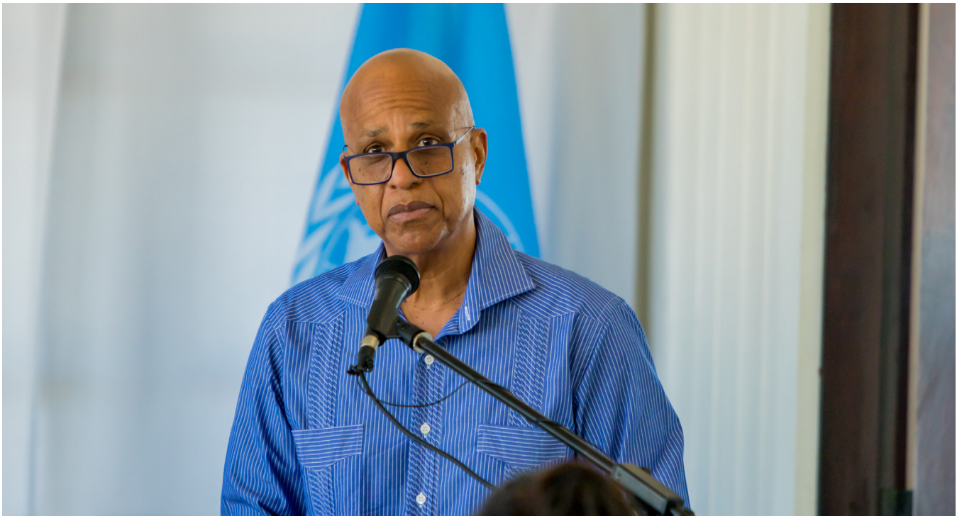
Keynote Address by the Rt. Hon. Dean O. Barrow, Prime Minister of Belize.

support to ensure the successful implementation of the outcome documents and decisions of all United Nations conferences and processes related to the sustainable development priorities of small island developing States. The Meeting noted with concern the declining levels of Official Development Assistance and Foreign Direct Investment being provided to Caribbean SIDS.