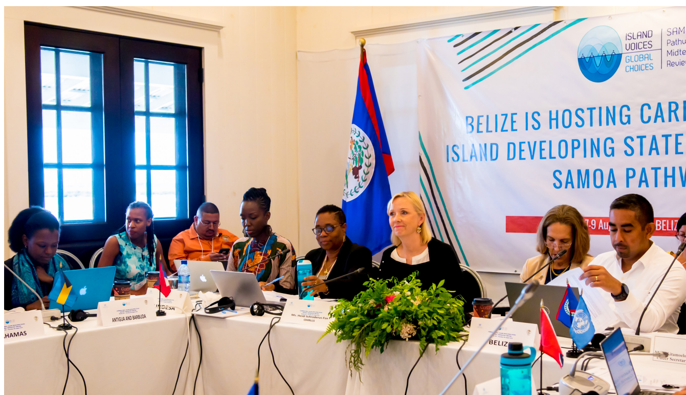
Caribbean SIDS Delegates -Interactive Discussions

of progress; and facilitate the further development and deployment of Vulnerability Resilience Country Profiles (VCRP), across Caribbean SIDS.