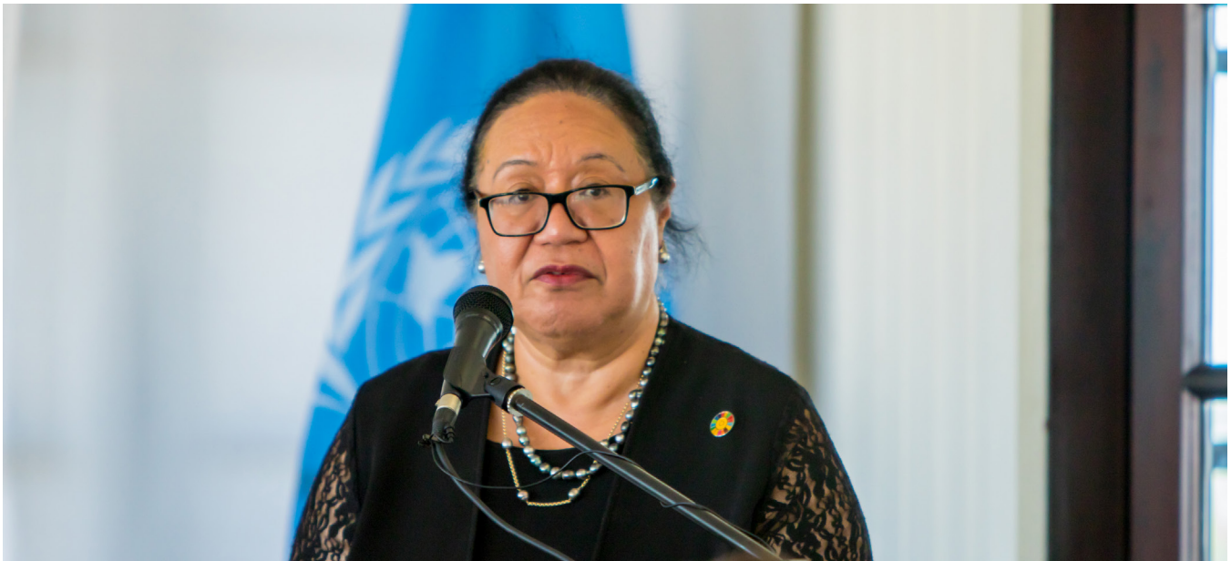
USG 'Utoikamanu OHRLLS delivers remarks on behalf of the UN Systems