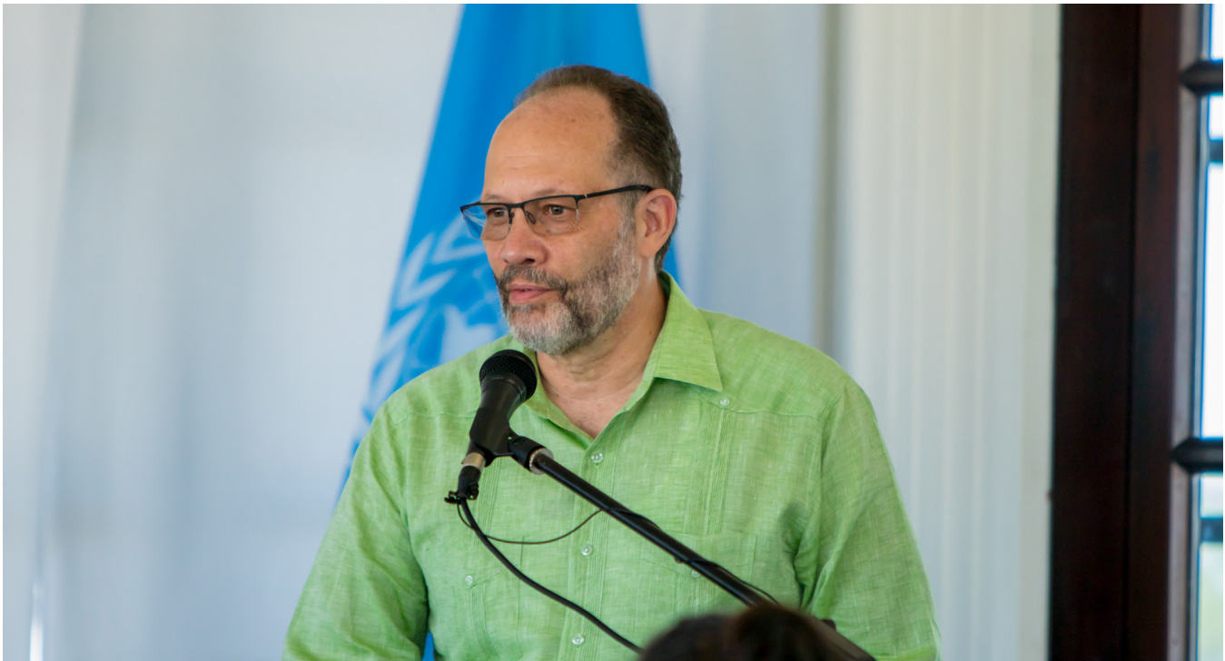
An Address from the Secretary General of CARICOM Ambassador Irwin LaRocque

for the implementation of the SAMOA Pathway requires that consideration be given to elements of governance, policy, budget, legislation, human resources, technology transfer, institutional framework, national, regional, inter-regional and international coordination, generation, access and application of data, and multisector stakeholder engagement.