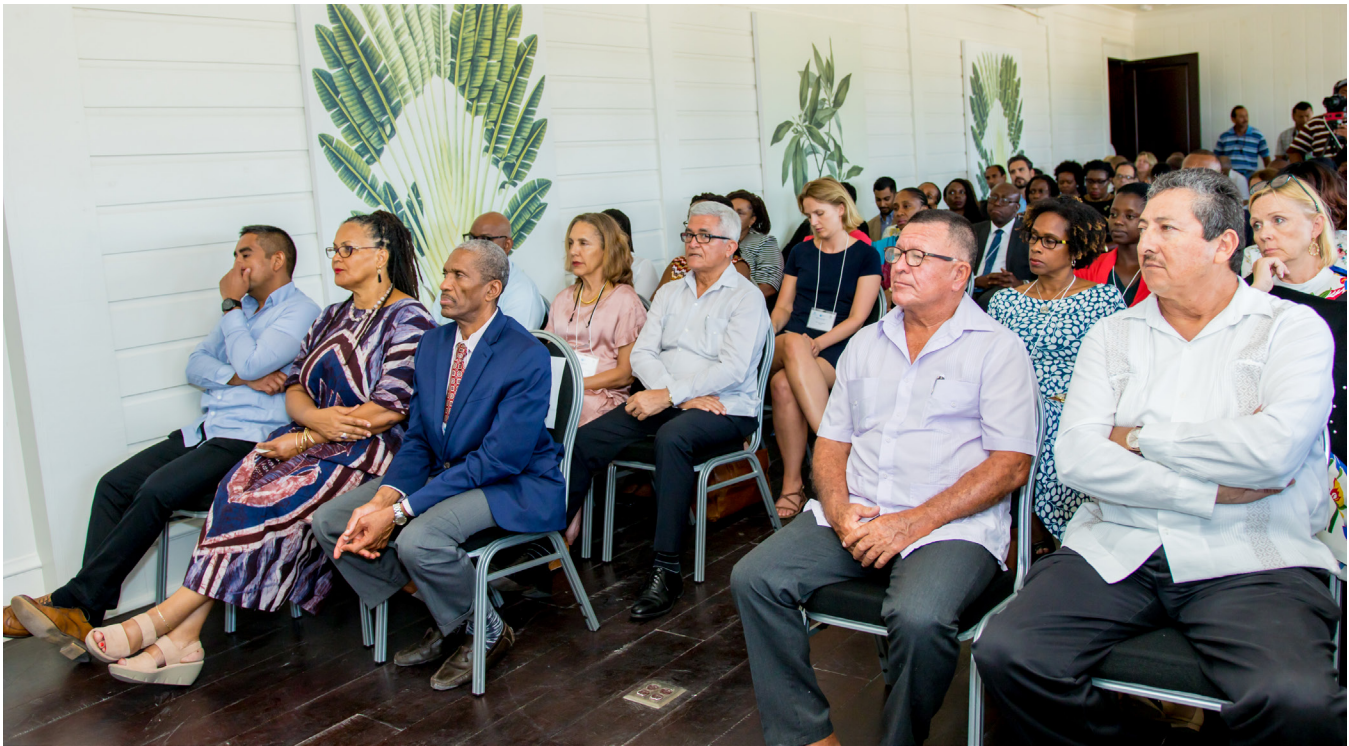
Delegates and guests at the opening session.

continue to face major challenges and highlighted in particular, the lack of economies of scale in production, high vulnerability to environmental stresses, acute exposure to external shocks, excessive reliance on external financial inflows and on few export and import markets, limited transport and communications, reduced scope for economic diversification and limited human resources, compounded by high levels of migration of skilled individuals, high unemployment youth and women. This has resulted in stalled progress in some areas and reversal of development gains in others.