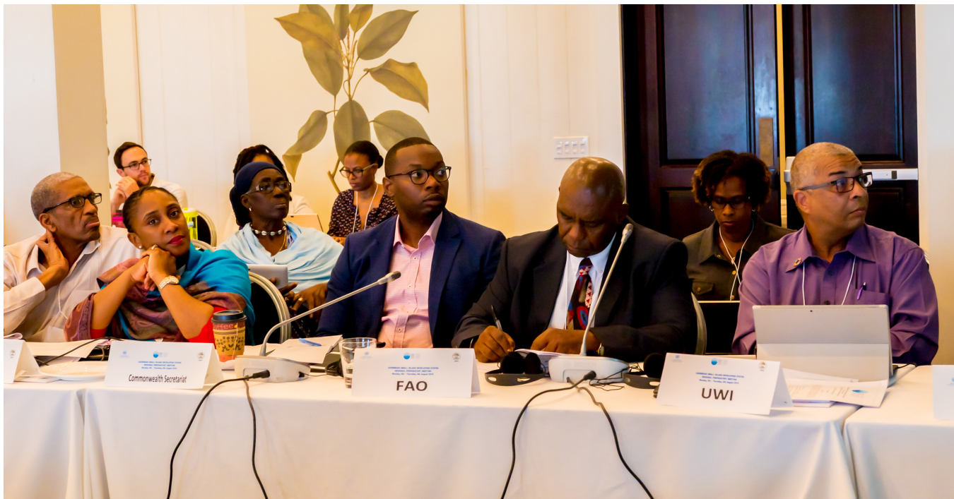
UN, Regional and Stakeholder Representatives