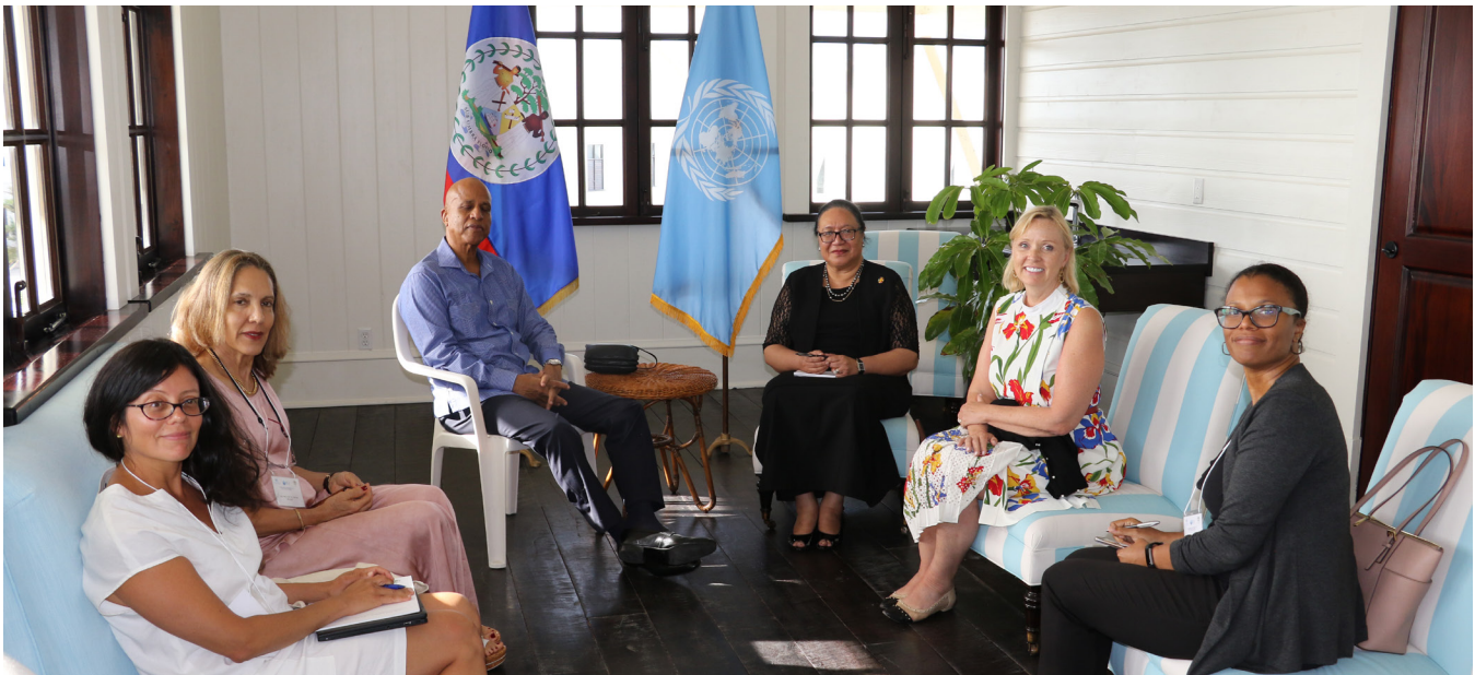
Bi-lateral Meeting: Rt. Hon. Dean O. Barrow, Prime Minister of Belize, with USG 'Utoikamanu OHRLLS