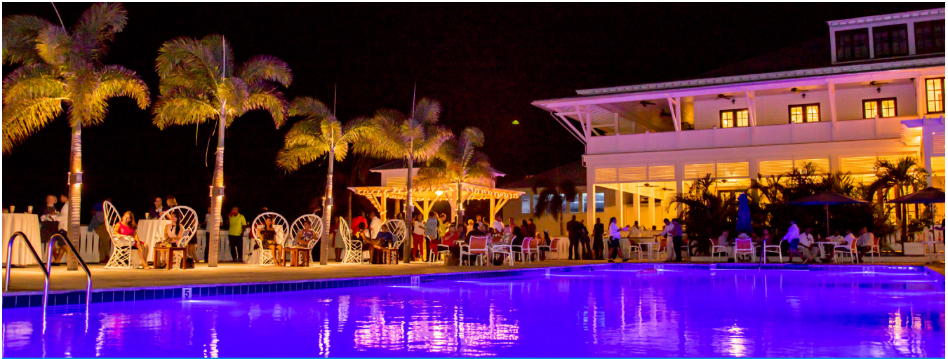
Mahogany Bay Resort - San Pedro venue of the Caribbean SIDS Preparatory Meeting