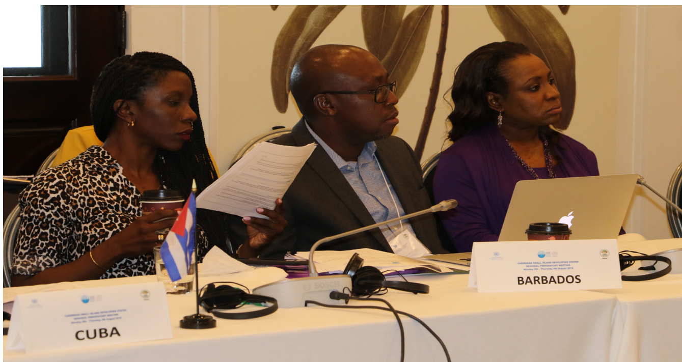
Barbados and Bahamas Delegations

adolescent pregnancy, reduce maternal mortality rates, and incidence of childhood obesity. The Meeting underscored the importance of addressing emerging issues related to the spread of Zika, Chik V, and the rising incidence of cervical cancer, in the Caribbean, noting that these health issues also had a negative impact on economic productivity throughout the region.