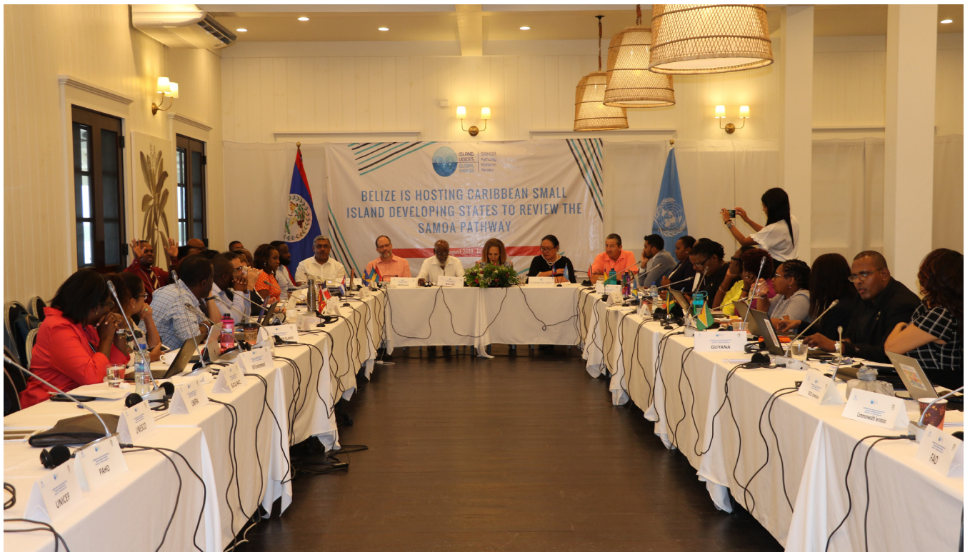
Caribbean SIDS Delegates

The Meeting stressed the need to integrate the improved management of environmental issues outside of climate change into the SAMOA Pathway. The linkages between the chemical waste management regime, and its implications for human health and social well-being in the region were highlighted with a request for further work to be done on these issues. In this regard, the Meeting called for greater attention to the generation and availability of environmental statistics to inform decision-making at all levels.