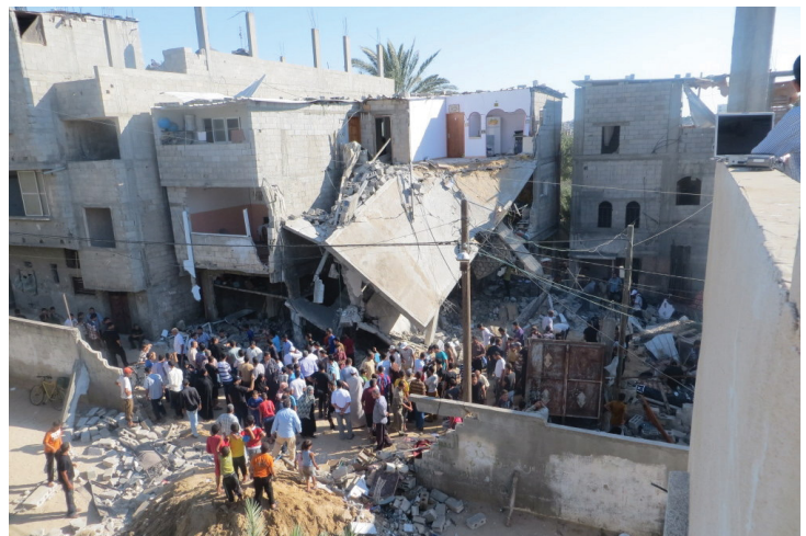
Aftermath of a 2014 IDF bombing on the family home of a Hamas activist; despite IDF warnings to the inhabitants to leave the building; 2 adults and 6 children died following the drone strike.

From a diplomatic perspective, Hamas uses human shields as a military practice to earn points in the global and regional arena (as well as in the Palestinian one). This is used to weaken Israel's ability to justify its claims regarding the Palestinian problem, to create continuous political pressure through international institutions (e.g. the UN and the EU) and NGO groups, and to support and promote sanctions and prosecution by international tribunals. Hamas records most incidents in which civilians are killed and injured by the IDF, and then uses this "evidence" to demonstrate the IDF's alleged lack of legal and moral standards. This also serves Hamas in the diplomatic theatre, as any collateral damage caused by the IDF usually yields harsh criticism from the UN and its institutes, Israel's rival countries (e.g. Turkey), and sometimes even friendly countries (e.g. UK, Germany, France, Sweden).