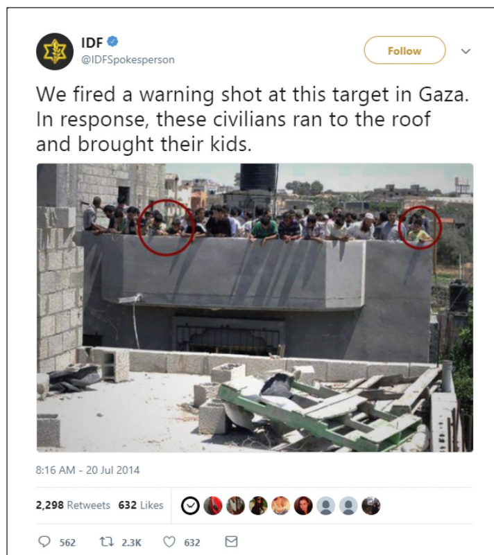
Tweet by the IDF. 25

[Hamas’] tactics included forcing residents to stay at home in neighborhoods where the IDF operated; assimilating terrorist operatives into civilian neighborhoods; exchanging their uniforms for civilian clothing while fighting the IDF; surrounding operatives with children to facilitate their escape from combat zones; making large-scale military use of civilian houses, which included constructing tunnels for assault and escape; situating its military infrastructure within civilian houses and public institutions; turning residential neighbourhoods into combat zones [...]; firing rockets and mortar shells from within civilian population centers [...]; and summoning civilians to come to operatives’ houses to serve as human shields for terrorist operatives in danger of being attacked by the IDF.” 24