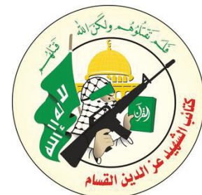
Logo for the Izz ad-Din al-Qasam Brigades, the military wing of Hamas.

Military. Hamas' defensive strategy is based on the use of its primary military force from within heavily populated areas, which are the organisation's main area of activity. It also operates its secondary efforts in fighting from open spaces, with the purpose of tiring IDF forces without necessarily halting IDF manoeuvres. In those open areas, the fighting is characterised by directly confronting Israeli forces (e.g. using IEDs, ambushes, mortars, or anti-tank missiles). The populated areas are the main battlefield, in which Hamas conducts uncompromised fighting while blending in with the local population. Hamas thus responds to the IDF's military and technological supremacy by creating an asymmetric equation, leveraging terrain advantages and using civilian populations to protect their military assets.