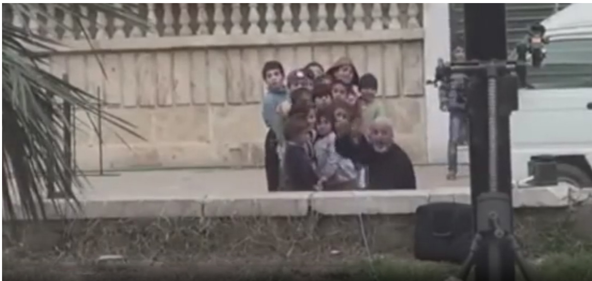
Children observe launching of Hamas mortar. 19