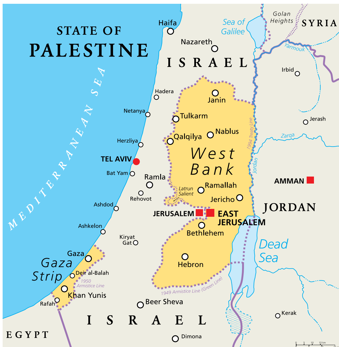
Map of Gaza Strip.

Hamas' growing strategic distress in the face of recent geopolitical developments will probably push the organisation towards a more pragmatic strategy in the near future. However, the movement is simultaneously preparing itself for yet another round of armed conflict with Israel. If this indeed happens, and in light of the success of the human shield practice, there is every reason to believe Hamas will continue resorting to the use of civilians as human shields.