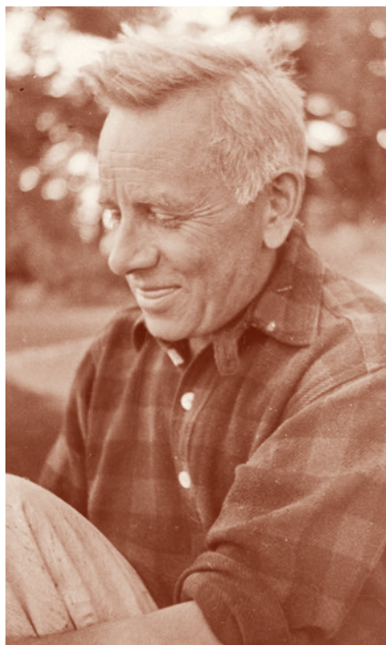
Renowned conservationist Ernest Oberholtzer, 1940

Motorboats mingling with nonmotorized craft on the water at End of the Trail Lodge, Saganaga Lake, in Superior National Forest's roadless area, 1960