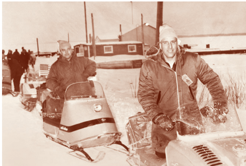
Members of a snowmobile caravan on a trip from Crane Lake, Minnesota, to Fort Frances, Canada, 1967