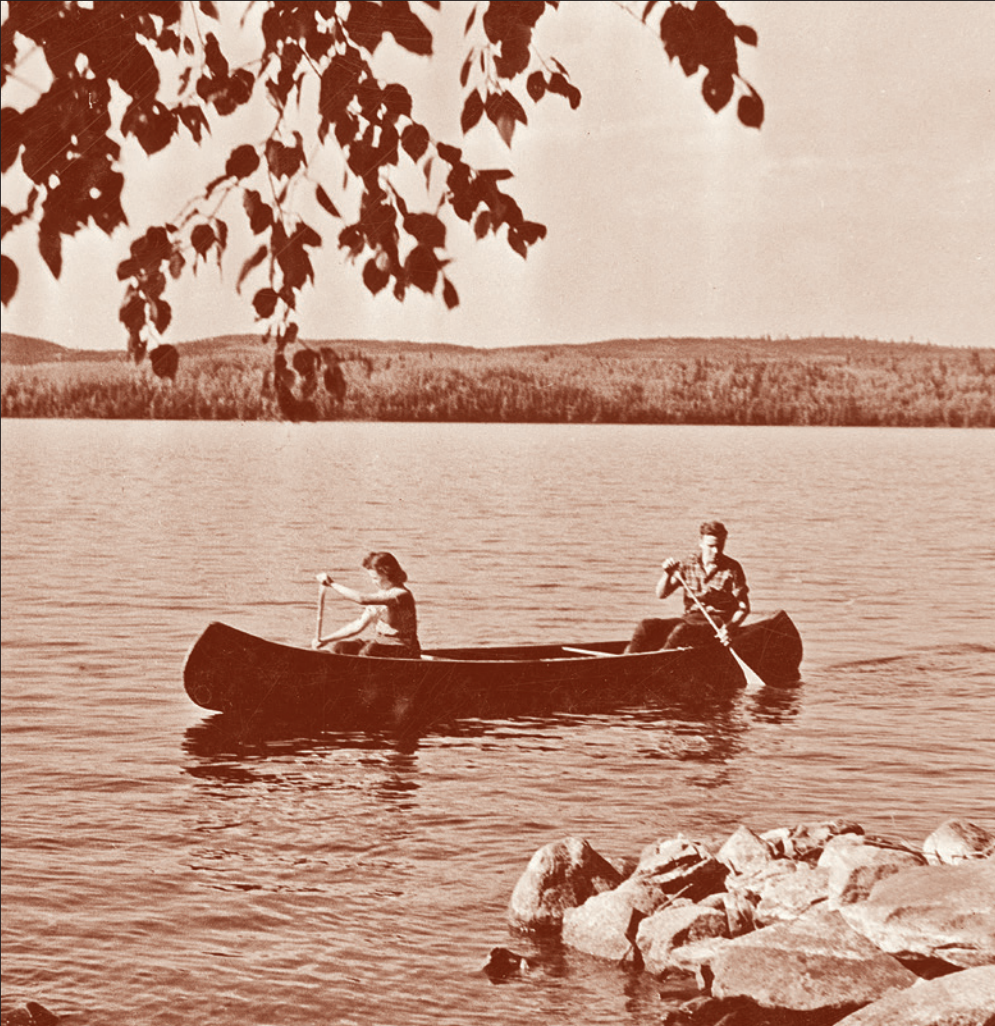
Canoeing on Gunflint Lake, about 1950

flicts emerged over the use of motors by those entering the region. Activists fought to keep the boundary waters free of motors, which, they maintained, spoiled the wilderness experience; opponents contended that rising demand for access called for greater use of motorboats and airplanes. From the mid-1940s into the 1960s this debate proved significant regionally and nationally. In Minnesota, the controversy over motorized recreation defined the debate among sportsmen, resort owners, businesspeople, and wilderness activists that continues to this day. In addition, the conflict shaped key legal provisions in the Wilderness Act of 1964, a landmark in the nation's environmental history as well as a touchstone for subsequent battles over the boundary waters. 4