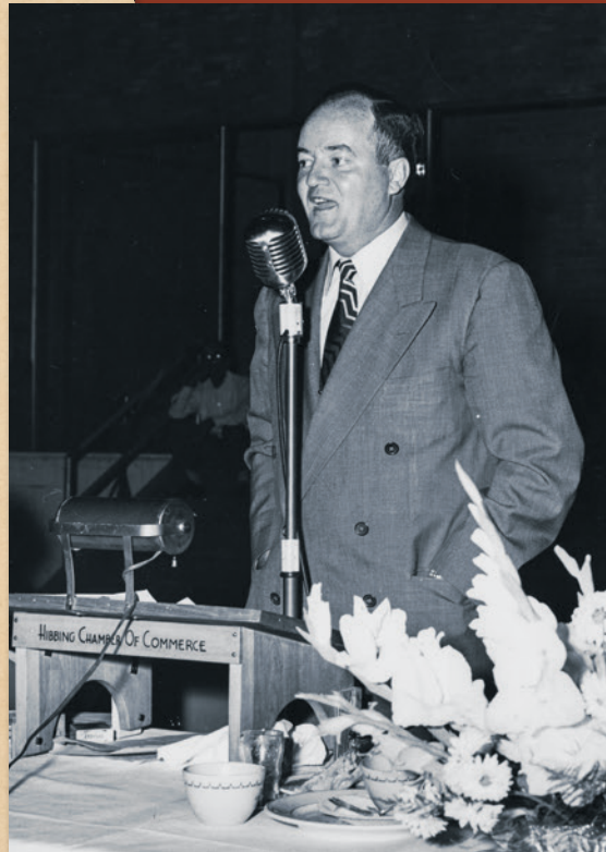
Senator Hubert H. Humphrey addressing the Hibbing Chamber of Commerce in 1956, as controversy swirled around the proposed wilderness bill; poster with Francis Lee Jaques drawing, about 1960, in support of the still unpassed legislation