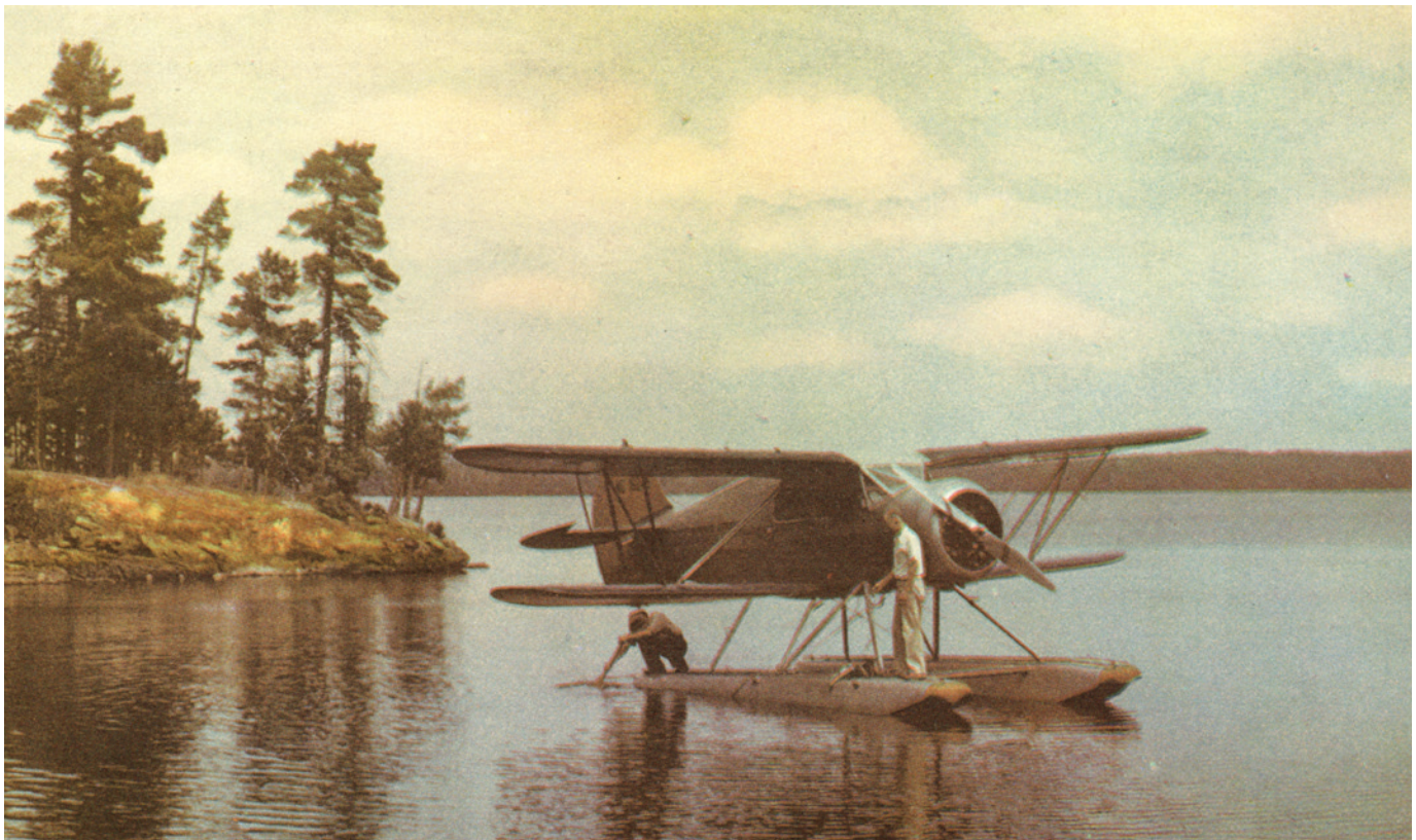
Men fishing from a seaplane, a north woods scene captured on a large-format color postcard, 1945

as its chief spokesman for protecting the boundary waters. He later joined the council of the Wilderness Society and played a crucial role in lobbying to include the boundary waters in the 1964 bill establishing the national wilderness system. Like Oberholtzer, Olson had explored vast reaches of the boundary waters by canoe and was dedicated to protecting the roadless areas from commodity interests and motorized recreation. Olson's distinctive contribution proved to be his many essays for sporting and conservation publications—such as Nature Magazine , Living Wilderness , and National Parks Magazine —that eloquently presented the values of the wild. 9