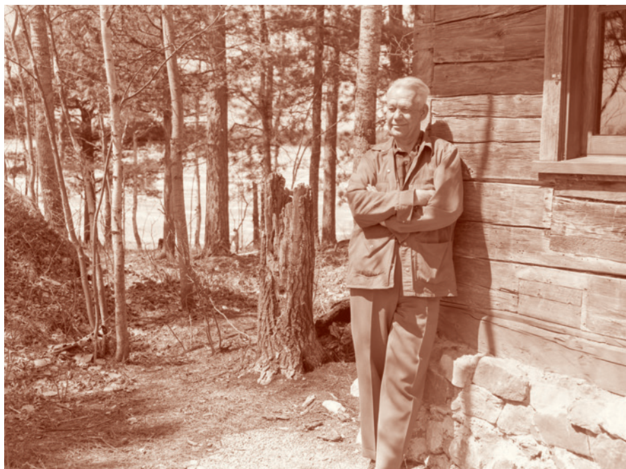
Writer and conservationist Sigurd Olson, about 1960

While the League's efforts and the Thye-Blatnik land purchases took