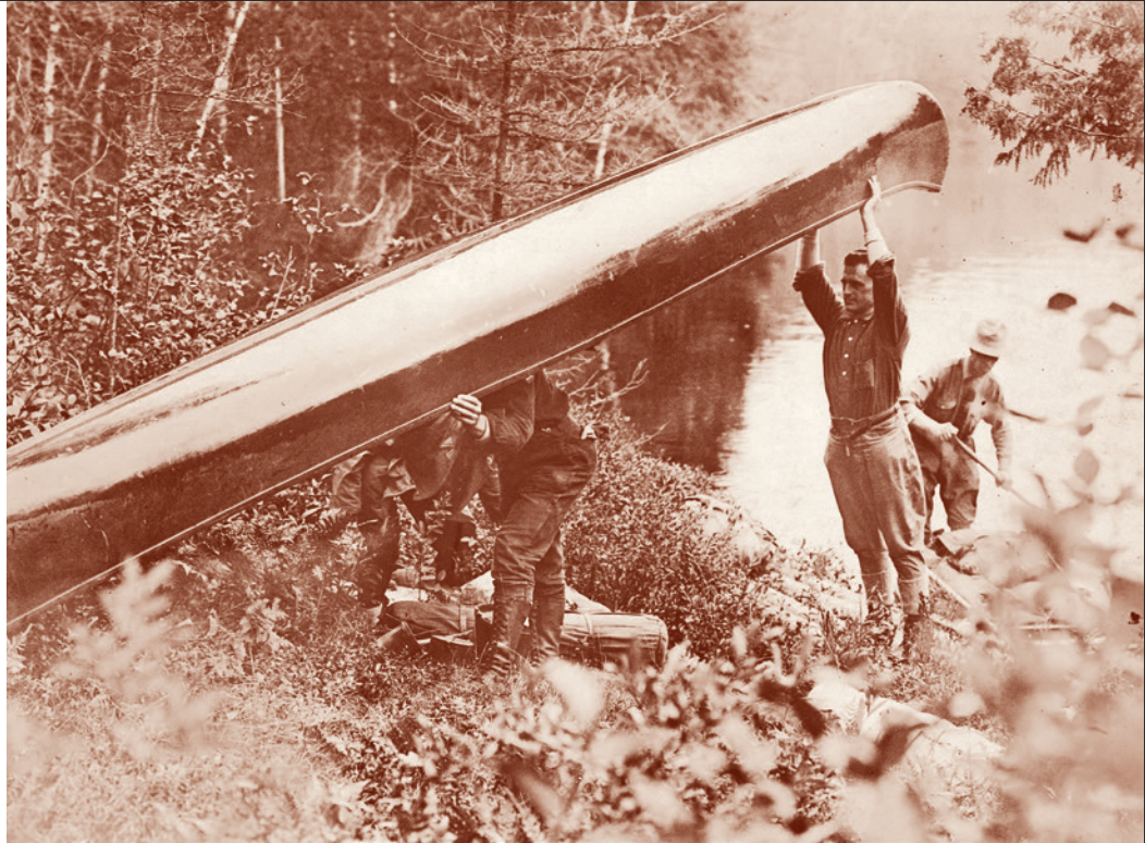
National Forest Service employees portaging in Superior National Forest, about 1920

WILDERNESS AREAS had been designated inside many national forests since the 1920s. Foresters Aldo Leopold and Arthur Carhart were among the leading advocates; at Carhart's urging, the Forest Service in 1926 had