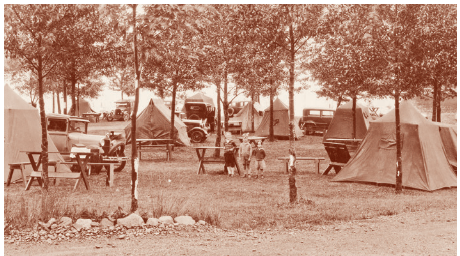
Ely, about 1947, a town whose economy increasingly depended on tourism; (below) postcard of “car campers” at the town’s tourist park, about 1935