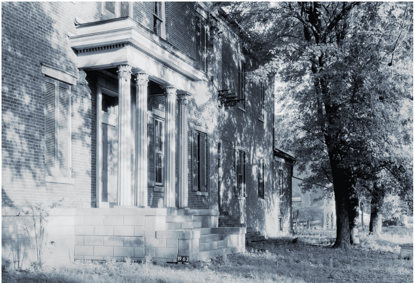
Rattle and Snap, the Polk family's plantation, 1936