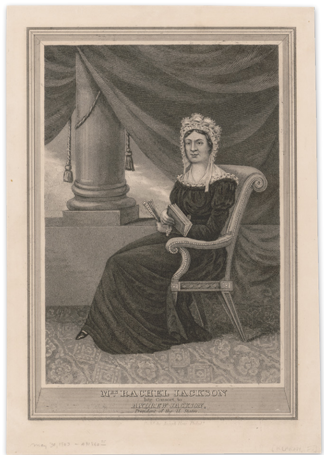
Andrew Jackson and Rachel Donelson Jackson, about 1829