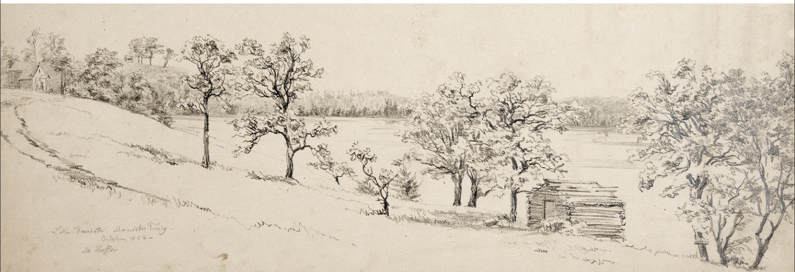
Lake Harriet, 1852