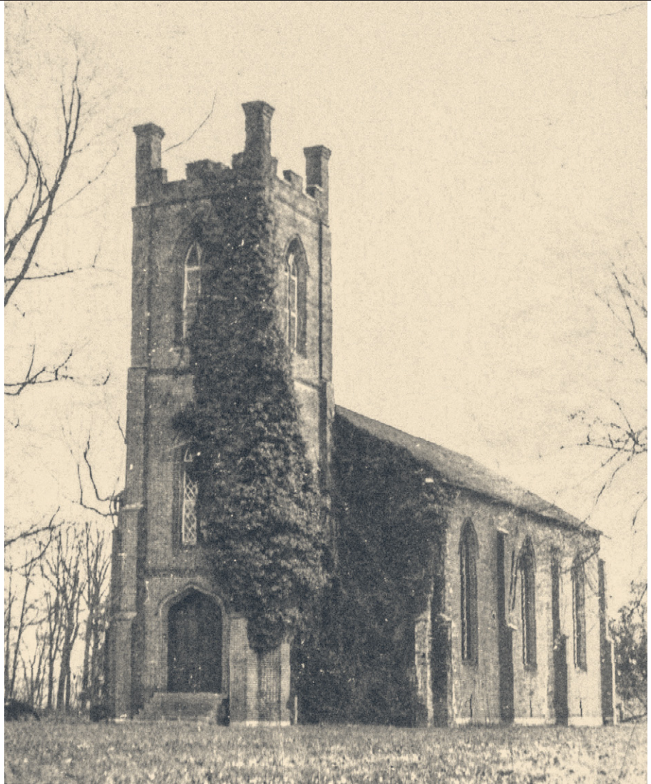
St. John's Church, built near Hamilton Place by the Polk family in 1842