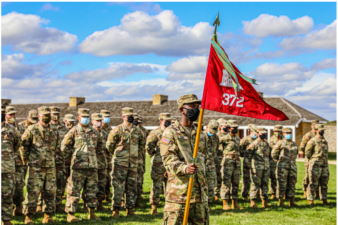
Soldiers from Task Force Timberwolf, 372nd Engineer Brigade, say goodbye to friends and family during a deployment ceremony at Historic Fort Snelling, October 2021.

MNHS staff had long wrestled with these interpretive challenges while planning for physical infrastructure improvements at the site. In a series of appropriations from 2015 through 2018, the State of Minnesota provided $19.5 million to demolish a failing 1982 visitor center, rehabilitate historic buildings into new interpretive spaces, and reconceptualize landscaping and other features. The keystone of the revitalization plan was the reconditioning of a long-disused 1905 cavalry barracks into a new visitor center, complete with a 4,000-square-foot exhibit