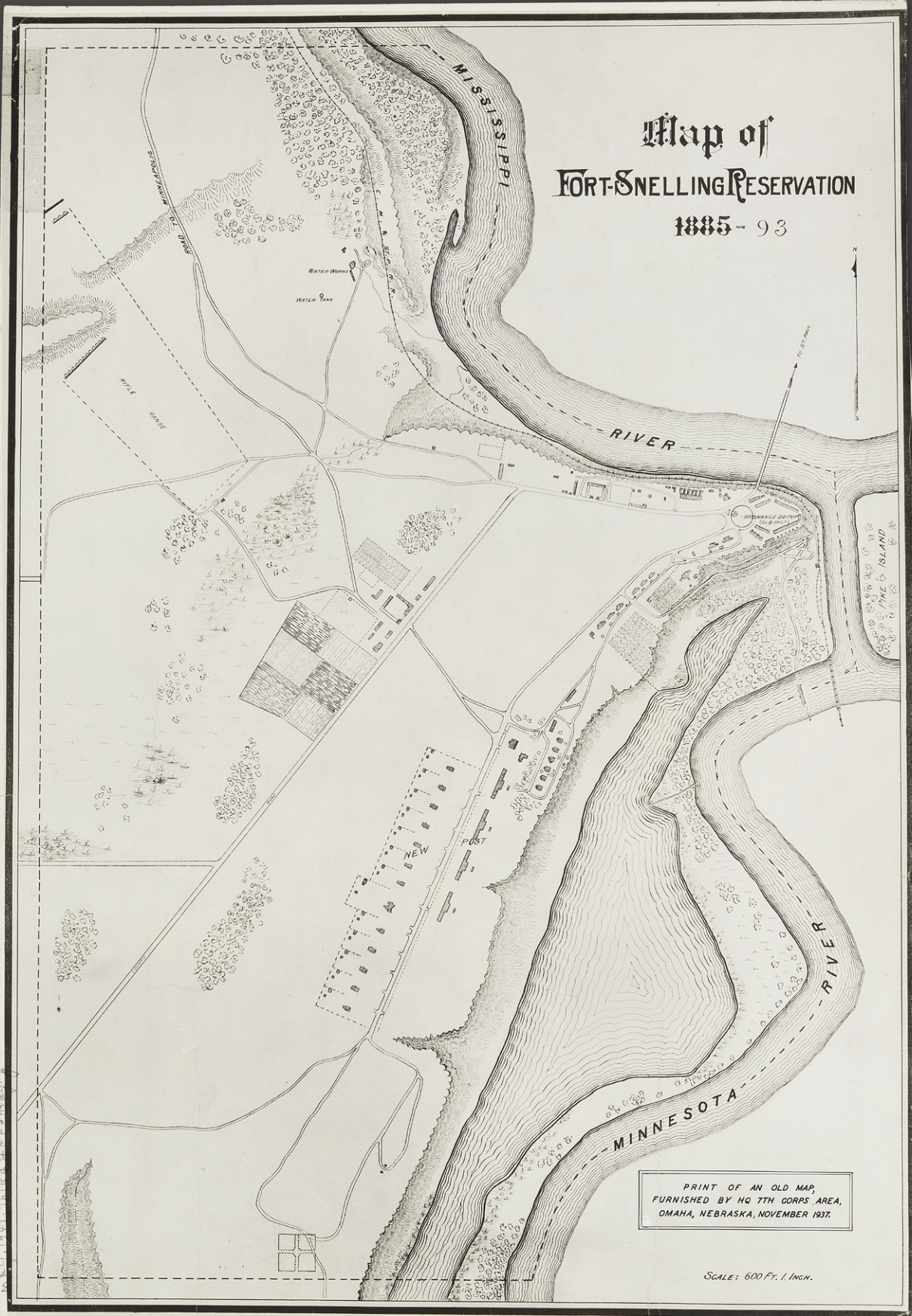
Military maps such as this one from 1885-93 charted Fort Snelling's growth over time.