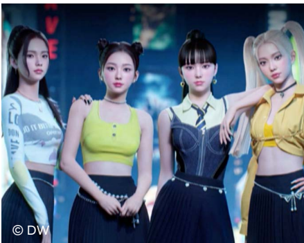
The AI-generated girl group "Mave" from South Korea