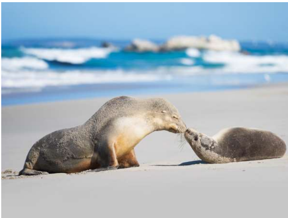
Sea lions at Seal Bay Conservation Park on Kangaroo Island.

A few weeks ago, when the world was a different place, I was sitting on a remote beach on South Australia's Yorke Peninsula observing the distant shores of Kangaroo Island. Across the foggy waters of Investigator Strait the island shimmered into view, and then disappeared again, swallowed by the sea like some sort of Brigadoon.