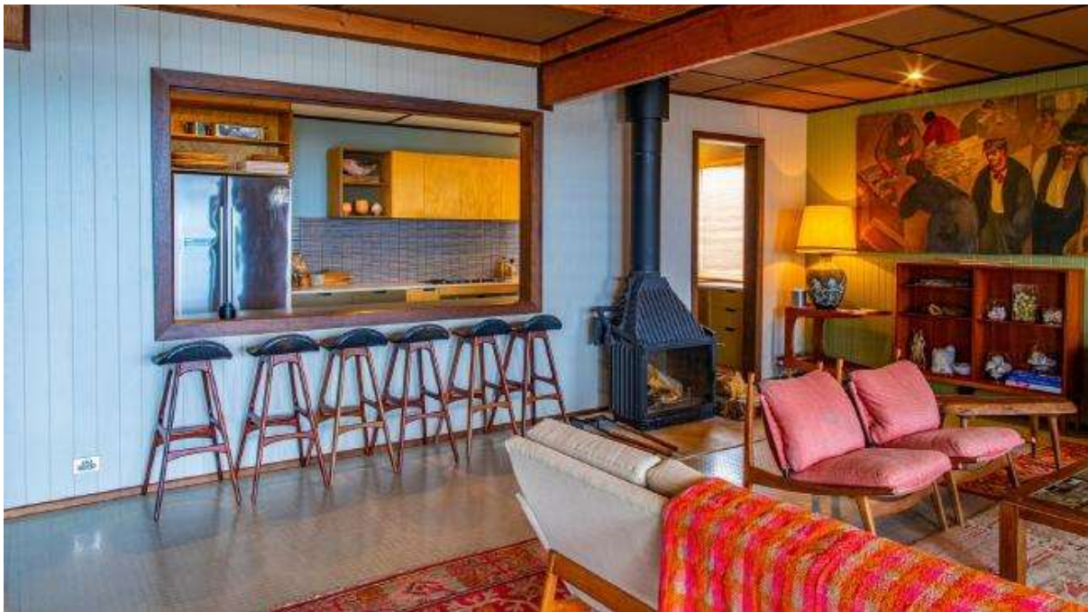
Retro charms of Hamilton House.

I'm heartened to see plenty of kangaroos and to be woken one day of my stay by a grunting koala in a tree outside my bedroom window. And on a chilly morning beneath gunmetal skies, Elijah from Kangaroo Island Ocean Safari is skimming us close to shore near Penneshaw where we spot a colony of fur seals lolling on the rocks. The coastline here is a geological curiosity, twisted like a flipped layer cake, with sheets of rock breaking off cleanly to lie like builders' rubble, attesting to wild seas. Today is calm, allowing us to flirt with dolphins darting beneath our boat. A resident pod of about 30 is almost guaranteed to put in an appearance; they're Elijah's surf buddies and supervised swimming with dolphins is popular with visitors.