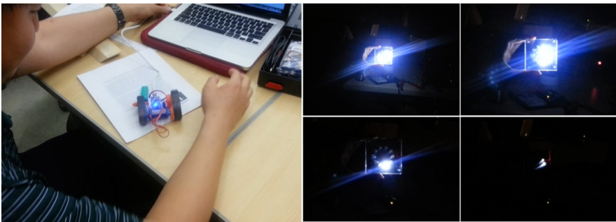
Fig. 2. Nothing Wrong Car (left), Unknown Mirror (right), Spring 2013

In another assignment, ‘Cross-media Conversation’, students were asked to build a physical or visual thing that responded to a theoretical idea explored in the course (or as the prompt described, to “answer words with things”) to promote more interdisciplinary and multi-sensory ways of learning. For this assignment, the students presented DIY objects, screen-based works, and drawings that reflected, sometimes obliquely, the ideas of their chosen theory, and briefly explained their rationales and relevance. For example, two students collaborated to produce “Unknown Mirror (fig. 2)”, an interactive two-way mirror that produced animated LED patterns only when the audience was not looking into the mirror. They explained the work as partly inspired by ideas around the ‘withdrawing’ nature of objects presented in one of the course readings, Ian Bogost’s Alien Phenomenology [10]. To support reflective and collaborative modes of learning, class exhibitions of work in progress were organized in which students and teachers shared ideas and feedback.