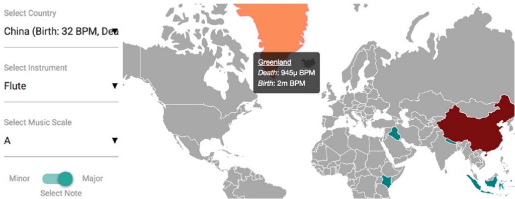
Fig. 6. Life Symphony, Fall 2017

Other students produced less technological projects where they employed their own creative practices (like music or dance) as main features of the work along with what they conceptually learned from the class. For example, one junior student choreographed and performed dance sequences in which she explored how she might reconsider everyday technological objects, like chairs and light bulbs, as equal dance partners by interacting with their material and functional properties (fig. 7).