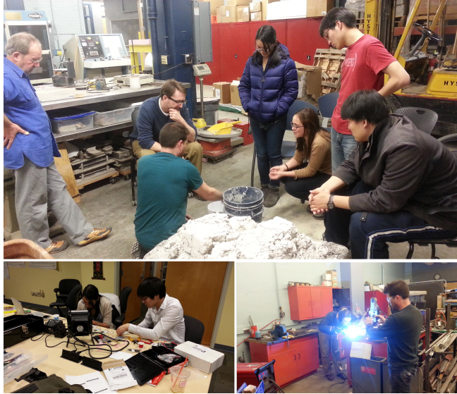
Fig. 1. Various learning spaces in Tech-Art-Theory class, Spring 2013

interview studies, students' self-reflection studies describing the processes and results of individual class exercises and assignments were also analyzed. The class ran every Thursday evening for three hours over 16 weeks, with locations alternating between seminar rooms and studio spaces around campus, including woodshops, foundries, and laser-cutting rooms, mixing text and discussion-based with studio-centered modes of pedagogy (Figure 1). Material techniques and equipment engaged through the course included welding, cement molding, woodworking, laser cutting, Arduino and other DIY design tools.