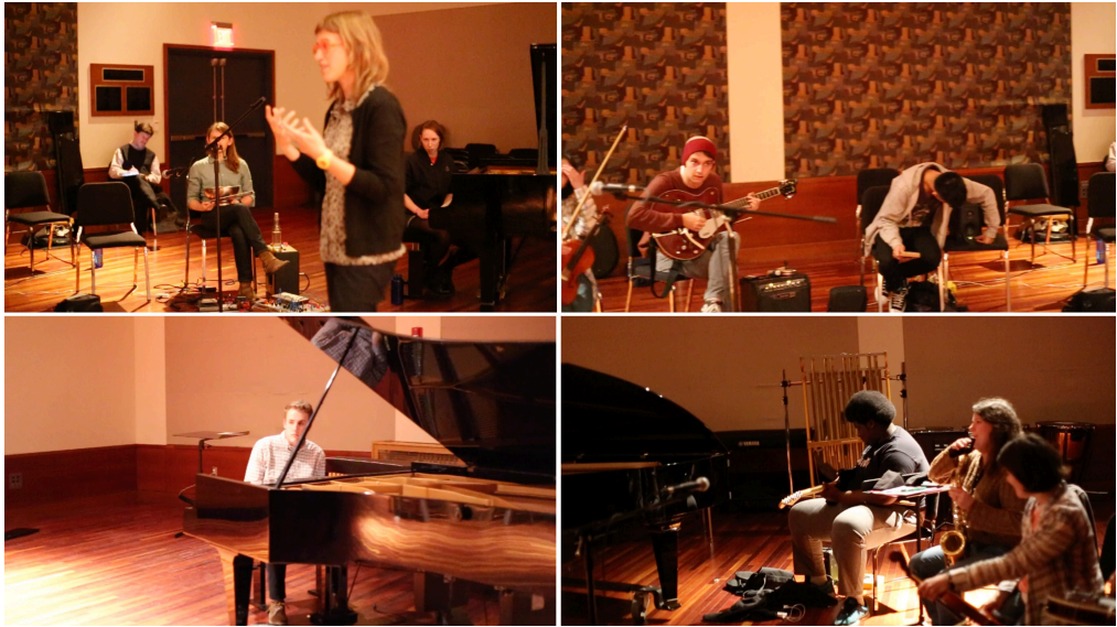
Fig. 4. Rehearsal for the final MIE performance, Fall 2016

was the engine that drove improvisation's distinct beauty and forms of group discovery. In later video analysis of the final performance, which ran ultimately for 18 minutes, we found that this structure often broke where more than two participants were engaged (sometimes up to four) in the play, which created its own situated and unique group-level expressions characterized by indeterminate mixtures of free play and fixed structure. For example, at around 16 minutes, four players (harmonica, piano, electric guitar, and saxophone) came in and played together for 2 minutes. This moment naturally became the climax of the show as it was the loudest and the most collaborative musical expression.