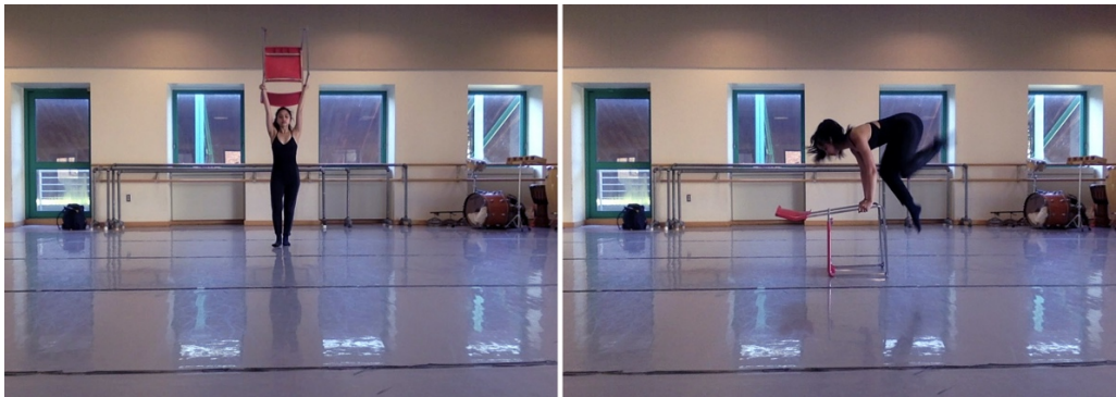
Fig. 7. Technology as a Dance Partner, Summer 2018

Other students produced less technological projects where they employed their own creative practices (like music or dance) as main features of the work along with what they conceptually learned from the class. For example, one junior student choreographed and performed dance sequences in which she explored how she might reconsider everyday technological objects, like chairs and light bulbs, as equal dance partners by interacting with their material and functional properties (fig. 7).