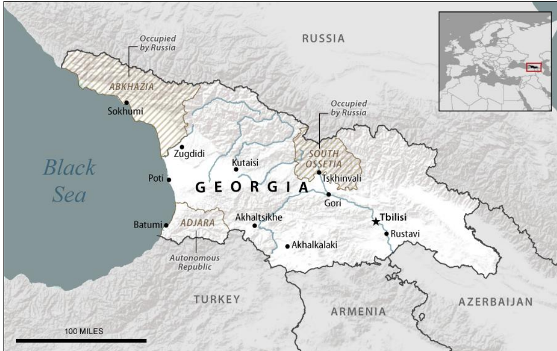
Figure I. Georgia