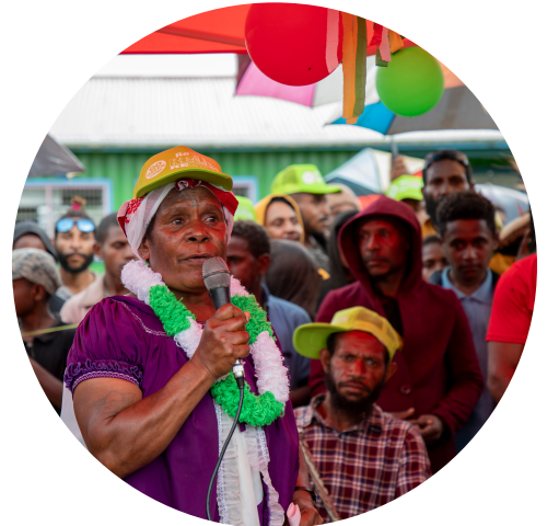
In 2023, UNDP opened a Peace Education Room in a local school in Kupari, Hela Province in Papua New Guinea. The province has been a hotspot for intercommunal conflicts in recent years.

To set the stage for SALIENT implementation in 2024, the team held consultations in Ghana, Kyrgyzstan, Panama and Papua New Guinea to identify the needs of these countries on armed violence reduction.