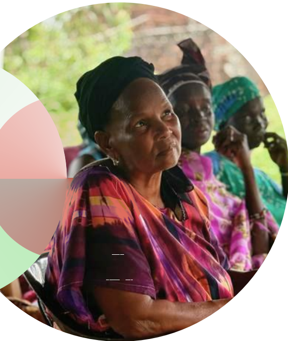
Awareness-raising session on sexual and gender-based violence in a rural area, Gabu region, Guinea-Bissau. UNDP

Across the UN system and beyond, the Global Programme serves as a unique platform for partnerships, in line with UNDP's designated 'integrator' role and in support of the One-UN approach.