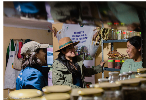
In 2023, with support from the Government of Japan UNDP's B+HR Academy trained more than 1,300 companies in human rights due diligence to enhance efforts to address human rights risks in their operations and supply chains. UNDP