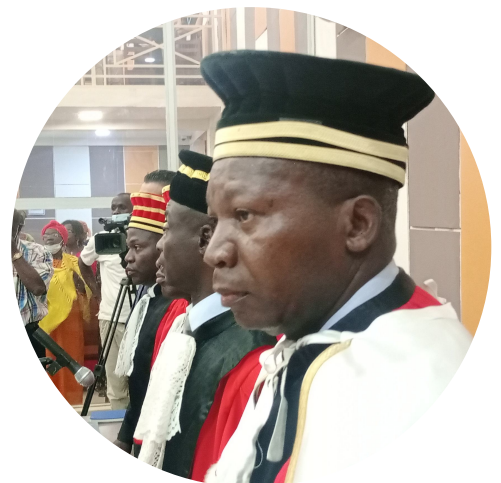
In the Central African Republic, fighting impunity is the priority of the Joint Rule of Law Programme. UNDP CAR

In 2023, the GFP delivered catalytic funding and/or technical expertise for the joint rule of law programming in the Central African Republic, the Democratic Republic of the Congo, Haiti, Libya, Mali and Somalia. To support gender responsive rule of law and security services, GFP operationalized its working group on gender justice. It also supported a Gender Parity Initiative to ensure the deployment of women corrections officers to UN peace operations.