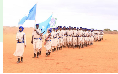
Basic recruits to the newly formed Galmudug Police Force.