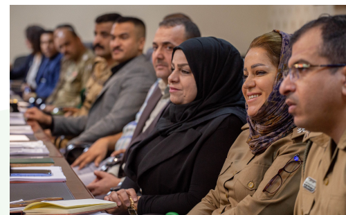
A workshop on people-centred policing at the Iraqi Ministry of Interior, Commanders' Training Center. UNDP Iraq