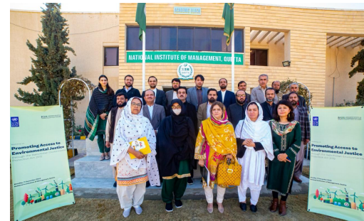
Consultation session on promoting access to environmental justice with key government departments in Balochistan.