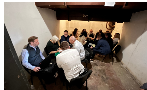
Interview with the management of the Secretariat of the Ukrainian Parliament Commissioner for Human Rights in Kyiv in the shelter during the air alert.