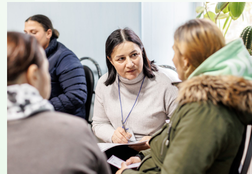
Ungheni mobile team assists Ukrainian refugees and survivors of violence directly in their communities in Moldova.