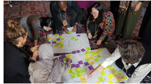
The Rule of Law, Security and Human Rights Knowledge and Learning Collaborative 2023: enabling change through MEL, innovation and integration. UNDP

In 2023, the MEL unit (co-)designed and facilitated learning events to stimulate collective reflection, exchange of knowledge and learning.