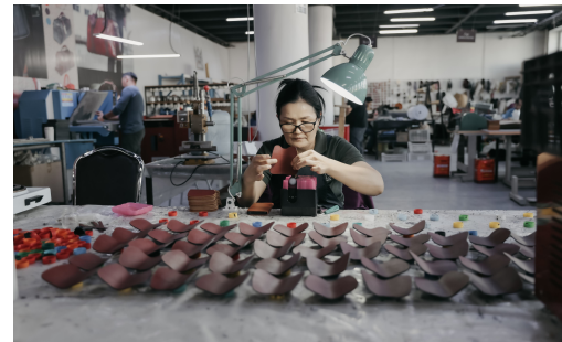
Through individual guidance sessions under the B+HR Academy, UNDP supported a local Mongolian leather production company in managing human rights risks. UNDP