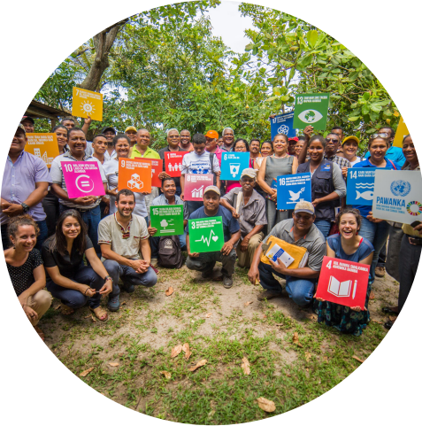
Achieving the SDGs requires building on and strengthening a culture and system of human rights promotion and protection. UNDP Honduras

In 2023, UNDP's Global Programme supported human rights institutions, systems and stakeholders in 34 countries, including through the Tripartite Partnership (TPP) among the Global Alliance of National Human Rights Institutions, UNDP and the UN Human Rights Office.