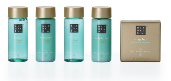
The Ritual of Karma Luxury Line | 30 ml