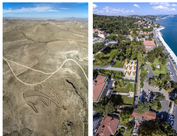
Figure 4 & 5: Andrew Rogers' artwork (left), Heinz Mack's artwork (right).

Though I took photos of these impressive artworks from the ground level, I decided to fly my drone as well since I thought the most appropriate photos of these works could only be produced from the sky. Alternative to many single photos I shot, I also took multiple photos tilting drone's camera vertically in small increments, with the aim of stitching a vertical panorama that would display multiple perspectives ranging from totally downward aerial to not-titled regular camera positions. The final stitched image reduces many gazes into a unique solo gaze that cannot be obtained by naked eye / single photo. Same unique photographic description can also be seen in the subsequent documentary image of German artist Heinz Mack's installation labelled "The Sky Over Nine Columns" at the Sakip Sabanci Museum, Istanbul.