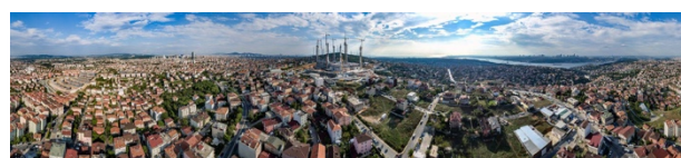
Figure 6, 7, 8, 9 & 10: Aerial panoramic photos, taken with a DJI Phantom 3 Professional, from the intense urbanization areas of Istanbul.

Panoramic images have a self-proclaimed aura as they are more inclusive as opposed to single images and are more compatible with human vision by denoting perception spread over time. David Bate, an artist and writer based in London, describes this actuality very astutely: "The panoramic -panoptic-view offers a kind of mastery over the scene and, by implication, over 'nature' itself. Like a child in front of a cake too big to digest, the panorama is impossible to eat or digest, thus it is satisfying and dissatisfying in terms of the aim of seeing. The panorama is 'magnificent', both picturesque and sublime. The viewer is as much absorbed in the technological feat of the representation as the scenes they have seen" (Bate 2009).