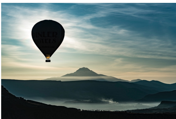
Figure 3: Cappadocia as seen from a hot air balloon

I would like to mention two rather unusual tools some photographers prefer to take aerial photos from relatively closer distances to ground level. The first one is a very tall tripod called megamast that can reach the maximum height of 8,5 metres.