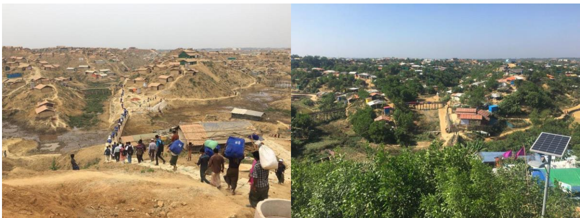
Before and after photos from the reforestation project in the camps (2018 on the left, 2019 on the right).

The refugee influx in Bangladesh also presented many environmental challenges. Once heavily forested, Cox's Bazar has suffered over the years from deforestation as communities have cut wood for construction and cooking, with studies showing the forested area has declined by approximately 40% since the 1990s. However, with the arrival of hundreds of thousands of refugees fleeing violence in Myanmar, the rate of deforestation greatly increased. To counter this, since August 2018 UNHCR has been distributing an alternative fuel—liquefied petroleum gas (LPG)—and improved cooking stoves, reducing the need for refugees to gather firewood from the nearby forest.