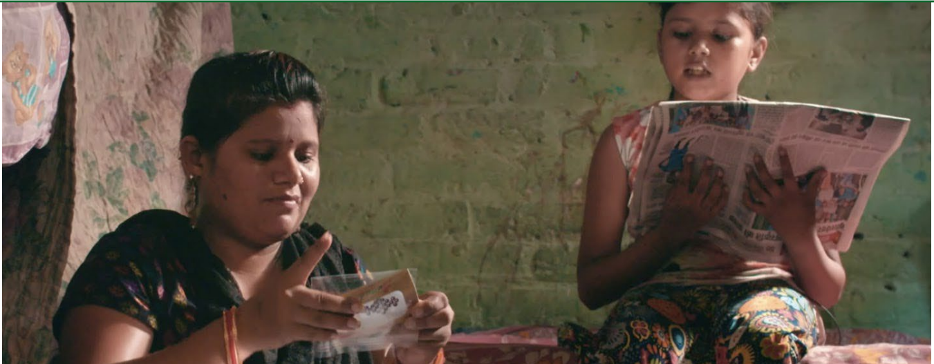
Read Along, Google's speech-based reading tutor app, allows students to learn by reading aloud