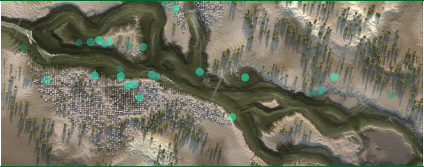
Flood Hub, a Google Research initiative on flood forecasting, provides actionable information to help people and communities stay safe