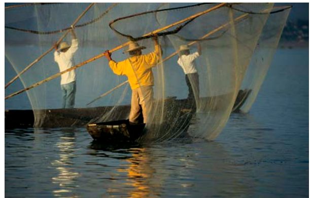
Local fisherman in Mexico.

Interest rate risk can increase debt-servicing costs, putting pressure on national budgets and forcing countries to impose spending cuts or tax reforms. The World Bank helps countries manage this risk with market-based risk management tools such as the IBRD Flexible Loan (IFL). Over the past 17 years, the World Bank has helped over 40 countries with a combined US$70 billion portfolio use the IFL.