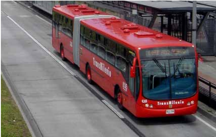
Modernized transit systems such as Bogotá's TransMilenio (as seen in the photo above) are helping reduce Colombia's carbon emissions by retiring and replacing older buses with modernized and fuel efficient new ones.

World Bank green projects, like all World Bank projects, are designed to reduce poverty and improve local economies. But they specifically focus on tackling climate change issues that directly impact developing countries. The Integrated Mass Transit Systems in Colombia demonstrates how the Colombian government and the World Bank are working together to provide Colombia's urban population access to efficient, safe, and clean public transportation while reducing carbon emissions formally associated with its outdated bus system.