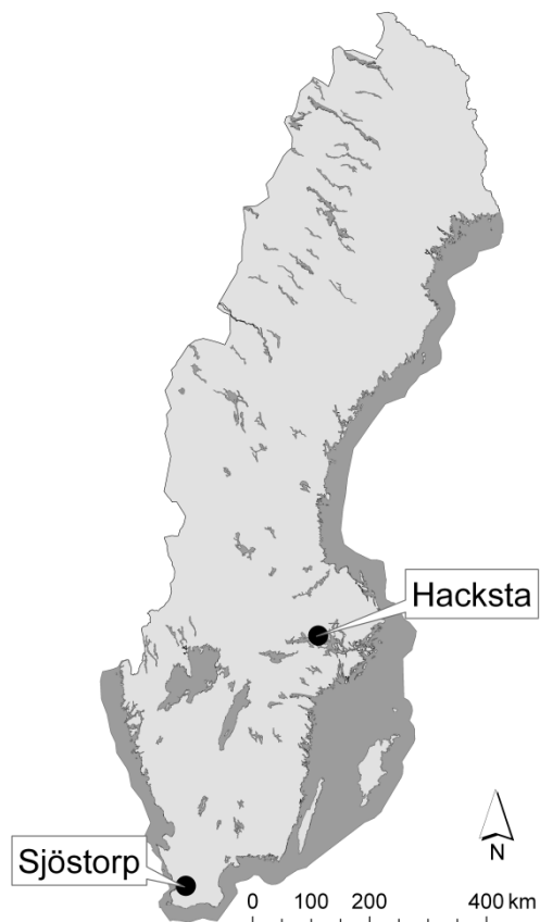
Fig 1. The location of the two farms.

The farms studied were Hacksta (59°33'N, 17°02'E), about 70 km north-west of Stockholm, and Sjöstorp (55°41'N, 13°19'E), about 20 km north-east of Malmö (Fig. 1). Crop rotations at both farms were dominated by cereals, and no farmyard manure had been applied for many years. The studied area at Hacksta covered five adjacent fields with a total area of 97 ha. The soils on this farm are dominated by glacial and postglacial clay with elements of sandy till (Möller, 1985), and vary from loam to clay with only small topographical differences. At Sjöstorp, 10 fields covering an area of 78 ha were studied. A clear borderline between two different types of glacial till soil divides this farm into an 18 ha north-eastern part and a 60 ha south-western part. The former consists of sandy till, while the latter consists of clay till with elements of chalk, changing to glacial clay close to the borderline.