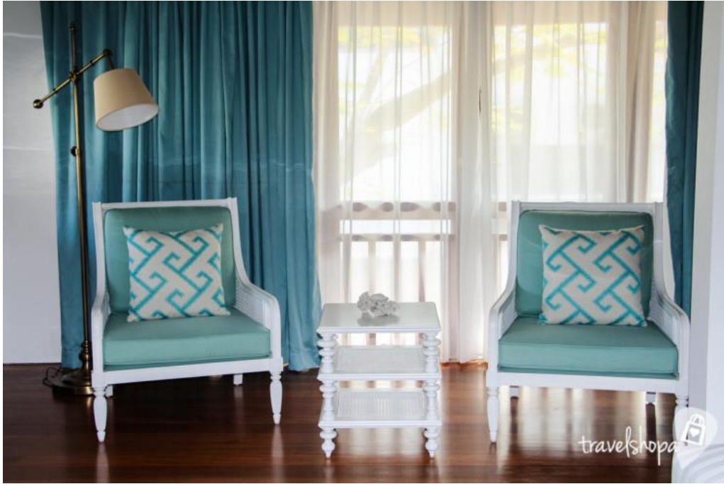
Whitewashed furniture and resort-style accents in a refreshing blue and bright white colour palette livens up the interior space.