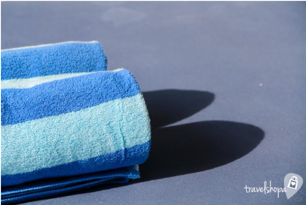
Even the pool towels are colour coordinated!