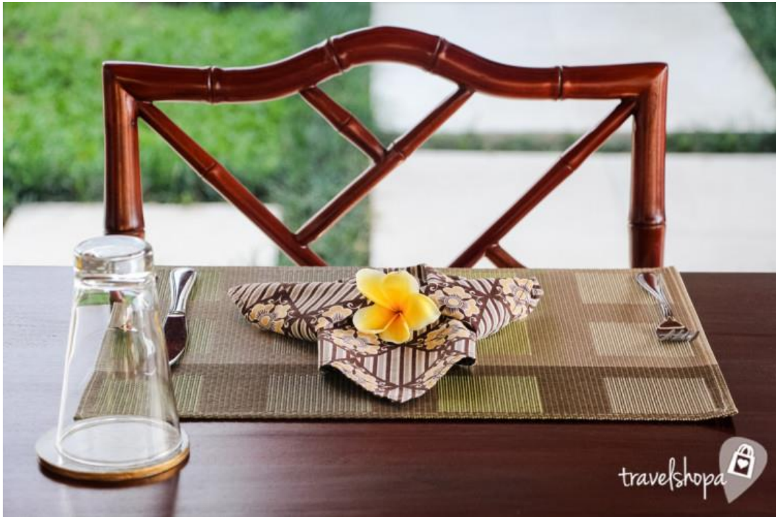
Breathtaking attention to detail and attentive round-the-clock service plump up our holiday experience.