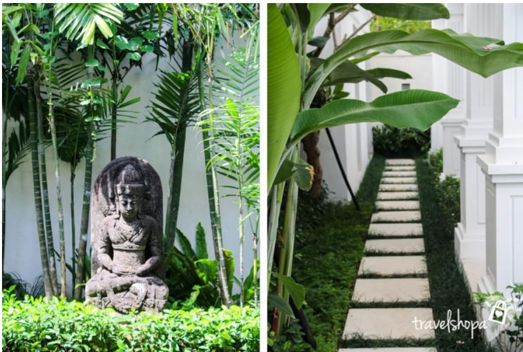
Bali's spiritual atmosphere is intoxicating. Here it manifests itself in this secluded tropical garden.