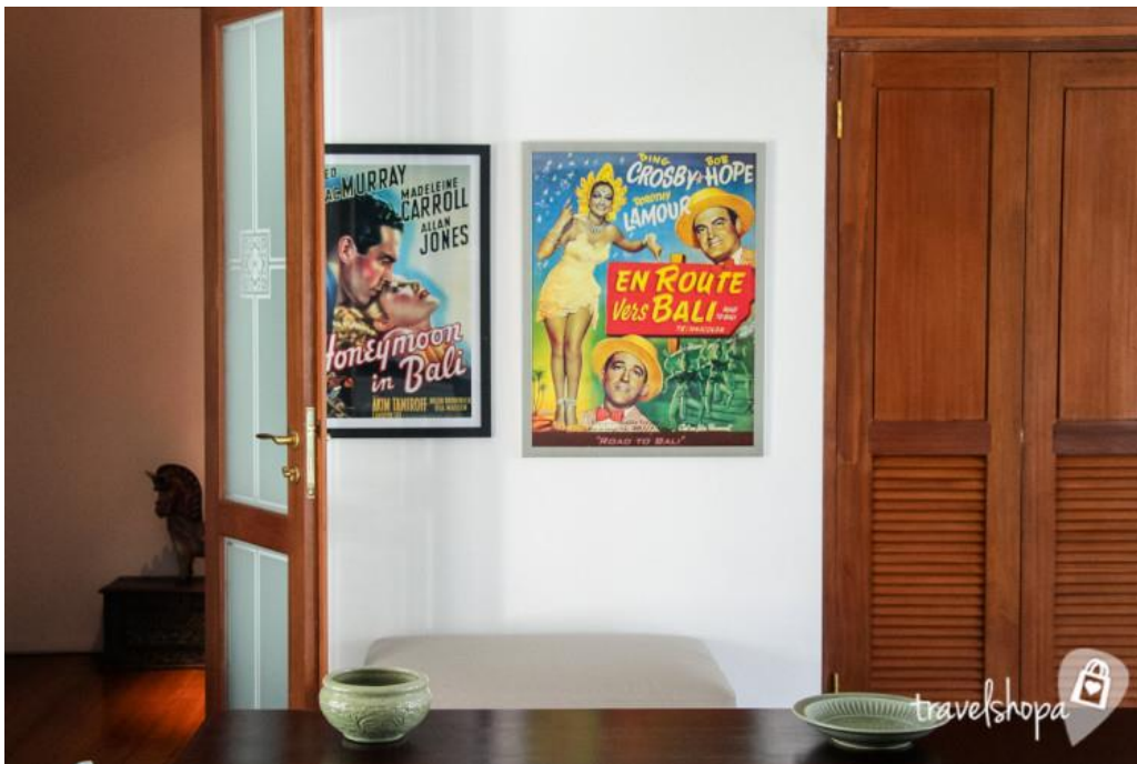
Vintage Bali-themed travel posters catch our eye every morning.