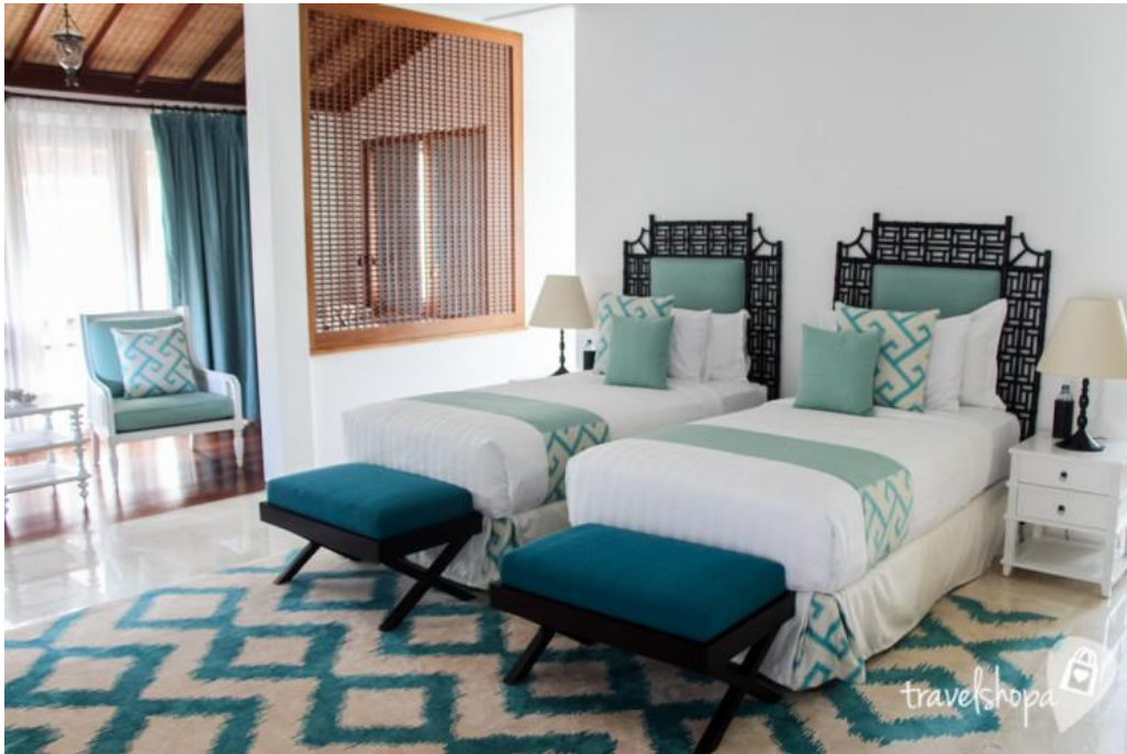
Gleaming marble and parquet wood floors are matched with geometrical patterned ikat rugs and coordinating bed settings in the spacious bedrooms.