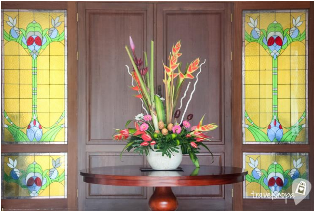
Stain-glass windows and a vibrant floral centerpiece stage a great welcome party for guests.