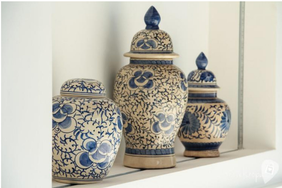
Ornate handpainted ceramic wares are a Balinese specialty and there's plenty to admire here at the Villa.