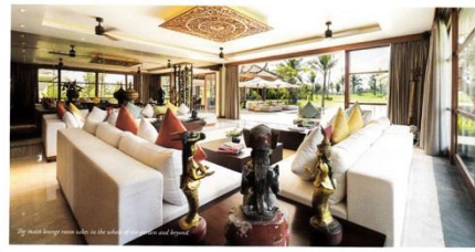
FRV BALI 11