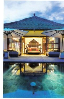
The main pool is a world class pool!