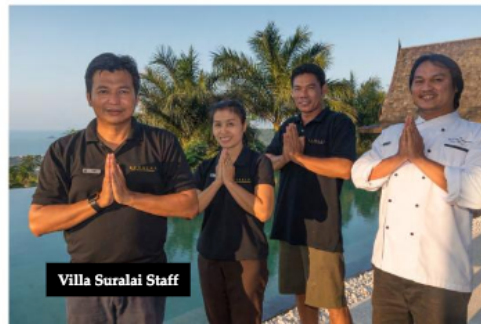
Villa Suralai Staff