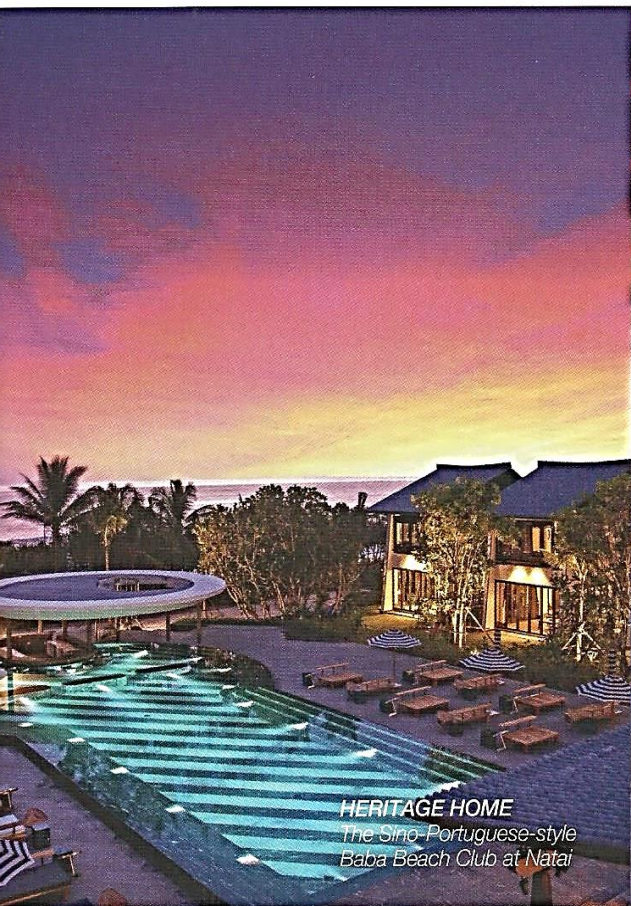
HERITAGE HOME The Sino-Portuguese-style Baba Beach Club at Natai