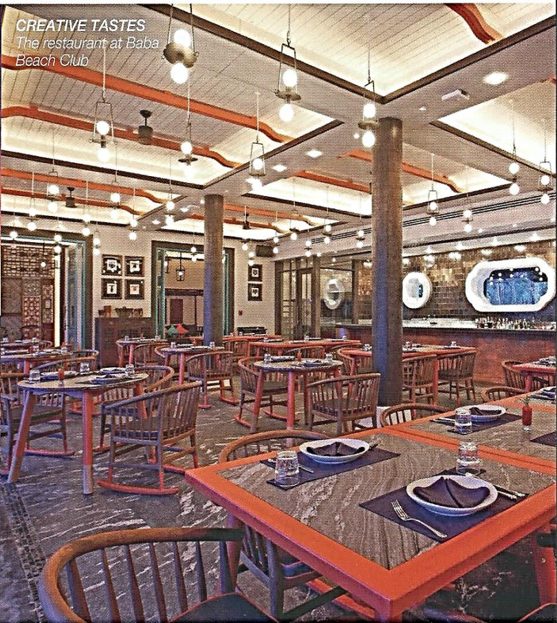
CREATIVE TASTES The restaurant at Baba Beach Club

a vacation don't forget about all the other services that can be provided: in-villa yoga sessions, learning the basics of scuba diving in the pool, nannies to look after your children and many more." As for an insider's recommendation this season, Macaulay says, "It doesn't get any better than the The Aquila with seven bedrooms and 165 metres of ocean frontage at Kamala's Waterfall Cove Estate."