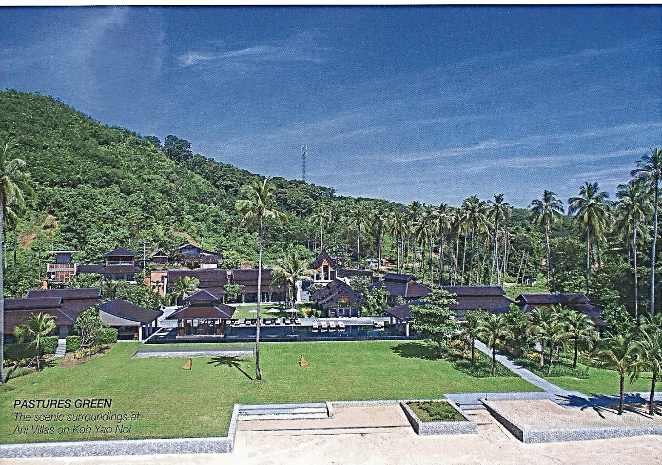
PASTURES GREEN The scenic surroundings at Ani Villas on Koh Yao Noi

by the grandeur and scale of the resort but also feel a very personal connection to it through the sense of romance, sense of place and sense of the unexpected that intermingle in the design.”