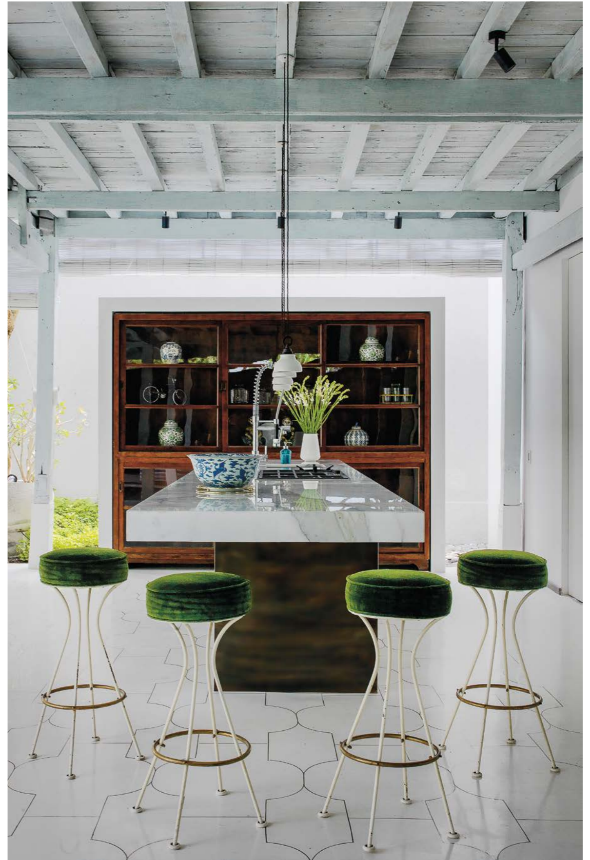
1950s Italian bar stools surround the modern outdoor kitchen while an antique cabinet behind holds a selection of old Chinese and Balinese ceramic pieces