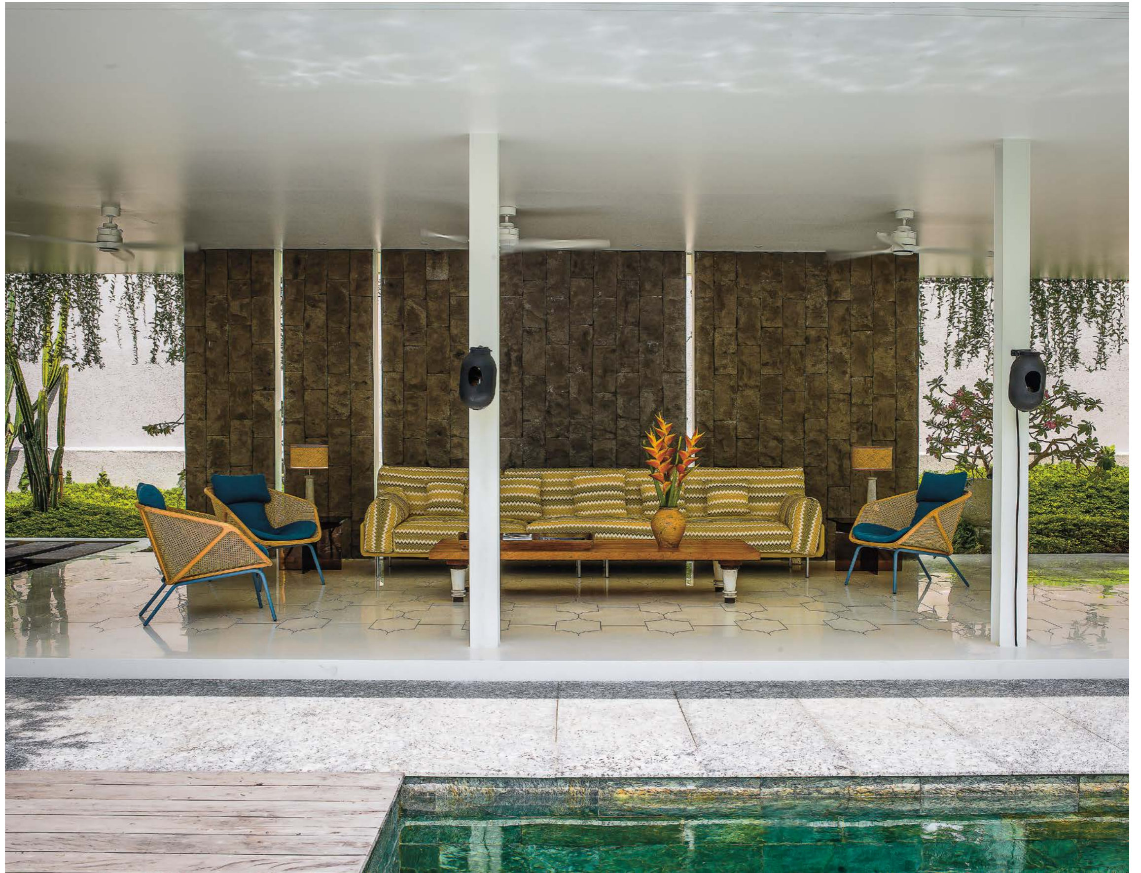
The comfortable seating area in the pavilion is furnished with stylish retro-style pieces like the Italian Colony armchairs from Miniforms or the Italian Servomuto table lamps. The wall lamps are by Lux Lumina