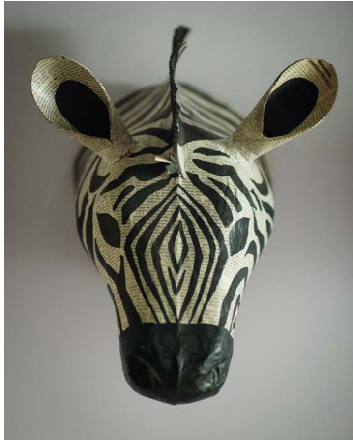
Fun papier-mâché animal heads like this zebra adorn the wall of the bunk