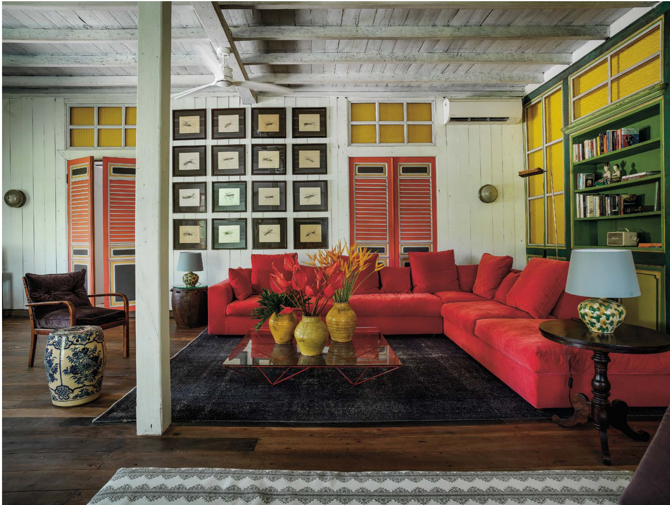
Treasures abound in the eclectic, colourful media room. A vintage Paolo Piva coffee table from B&B Italia displays antique yellow salt pots adorned with tropical flowers. The custom sofa is covered in a bold Enzo degli Angiuoni fabric, while the vintage La Riposante armchair has been re-upholstered in velvet. The vintage wall lamps are by Sergio Mazza