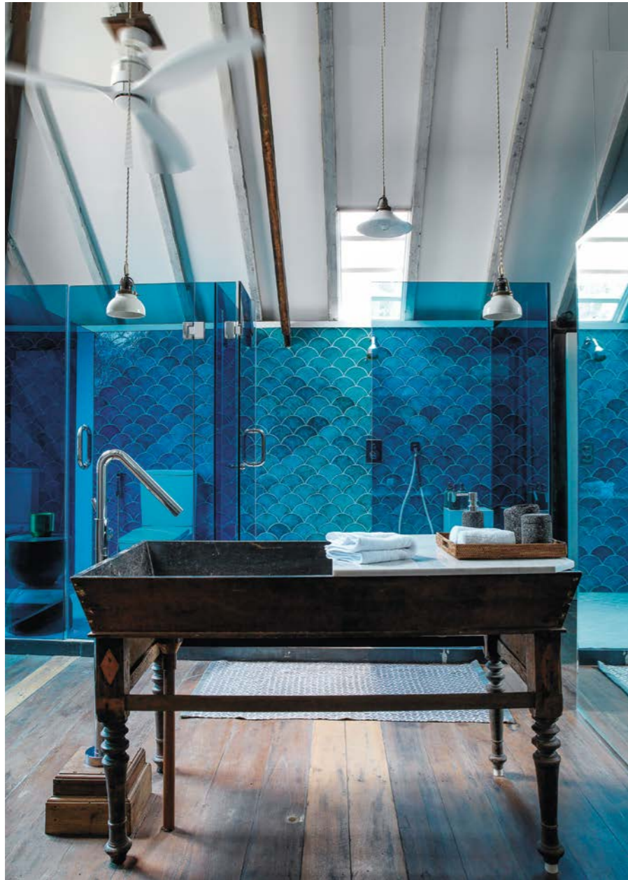
This page: The basin and vanity area in the attic bathroom has been adapted to work in a vintage Balinese table. The blue fish-scale tiles on the shower room wall were designed by Foley