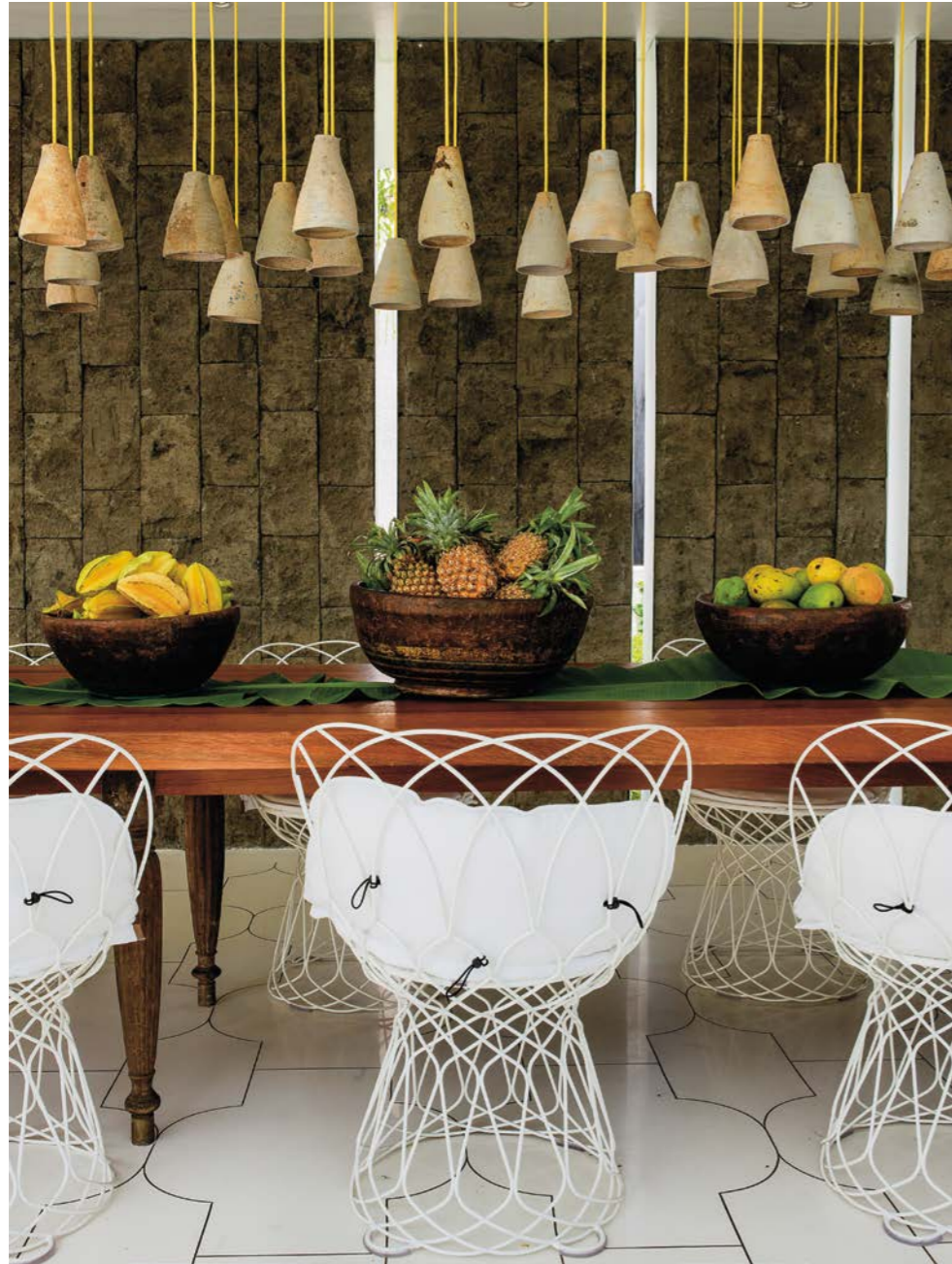
Large antique wooden bowls from Java filled with tropical fruit decorate the long dining table with its retro style Re-Trouve chairs by Patricia Urquiola for EMU. The hanging ceiling lamps are ceramic mercury pots salvaged from a shipwreck