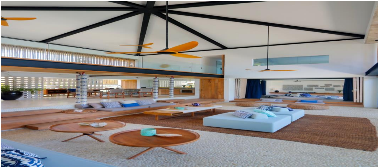
Ceiling fans help cross-ventilation and allow the double-height communal space to stay cool.