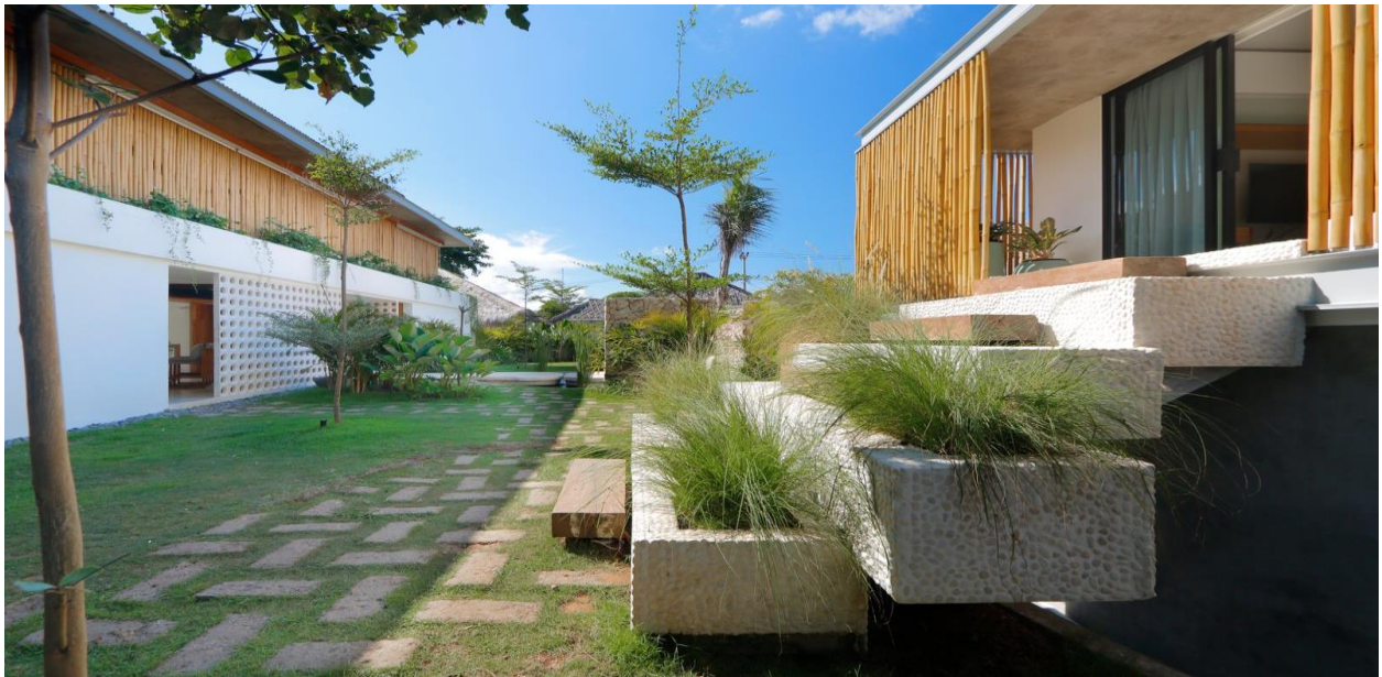
The guest quarters are located in a separate structure with a cylindrical base.