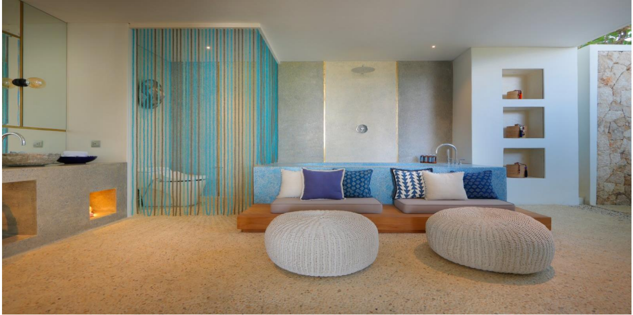
The blue and white tones are even picked up in the bathroom.