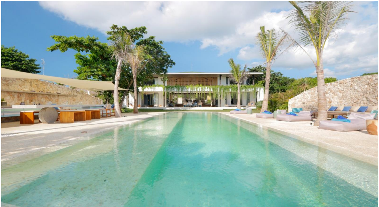
The elongated feeling of the pool is balanced by the surrounding circular deck.