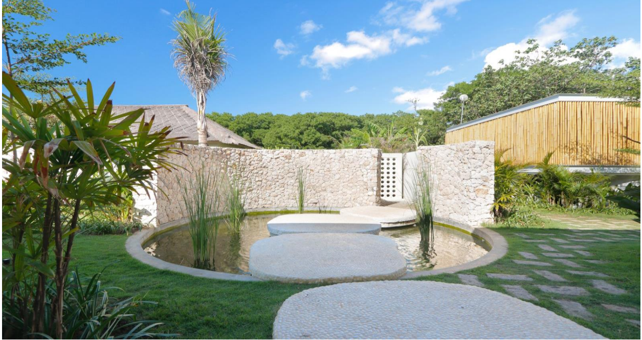
A look at the exterior landscaping.