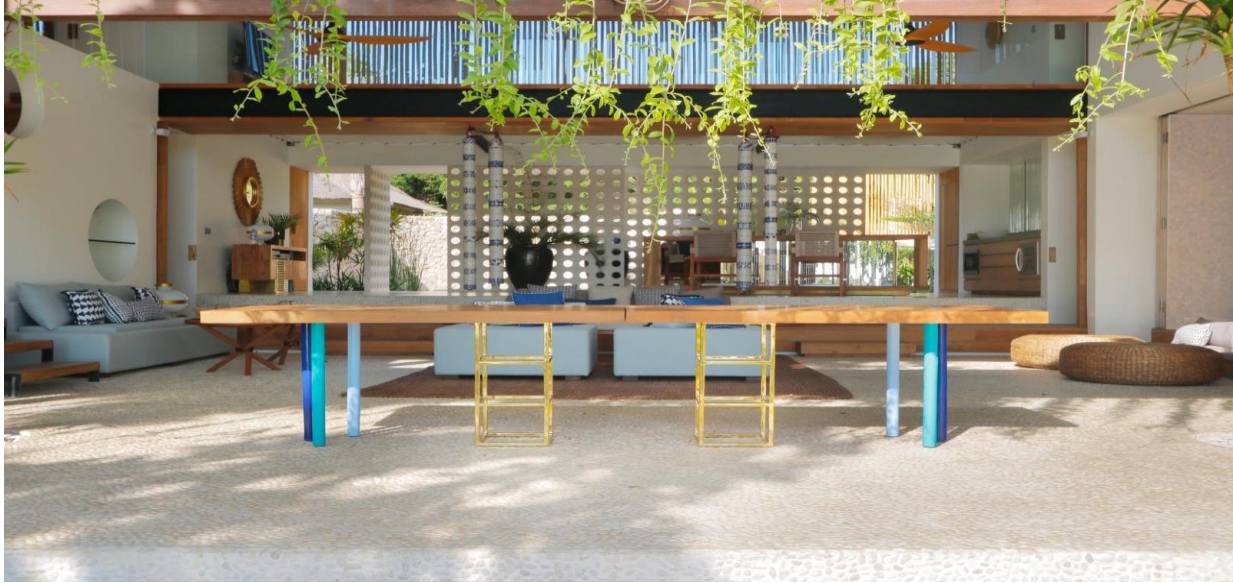
The villa features a strong sense of both Mediterranean and tropical vibes.