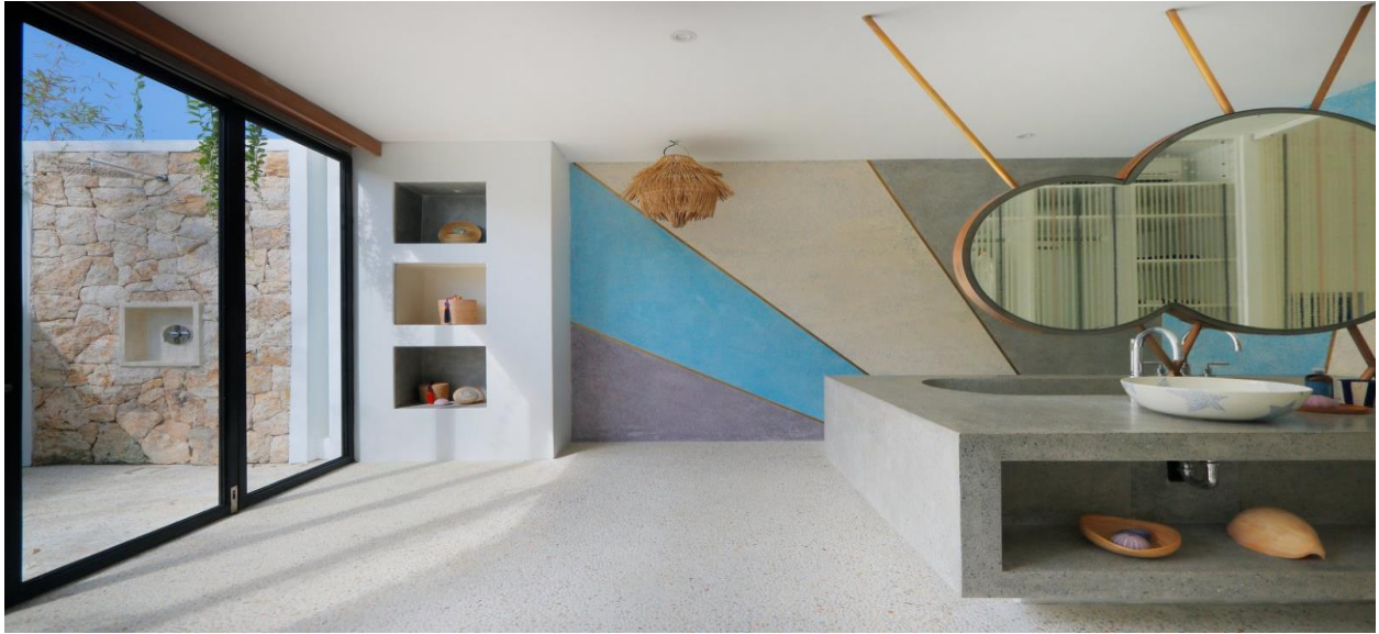
A look at a bright and spacious bathroom with uniquely-shaped mirrors and a vibrant mural.