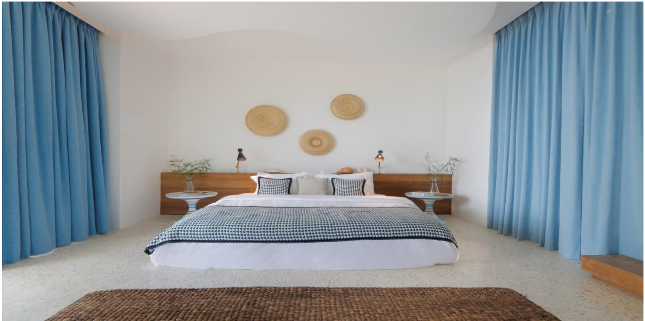
Another one of the bedrooms.