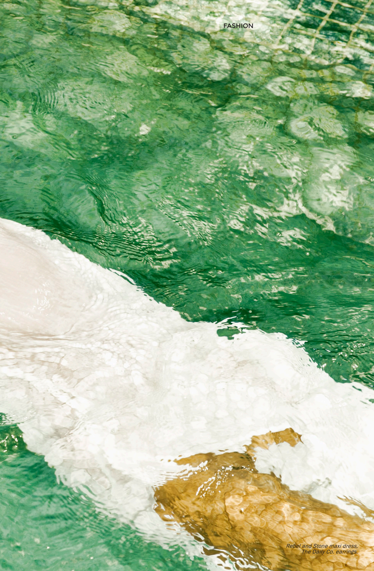
Rebel and Stone maxi dress, The Daily Co. earrings.