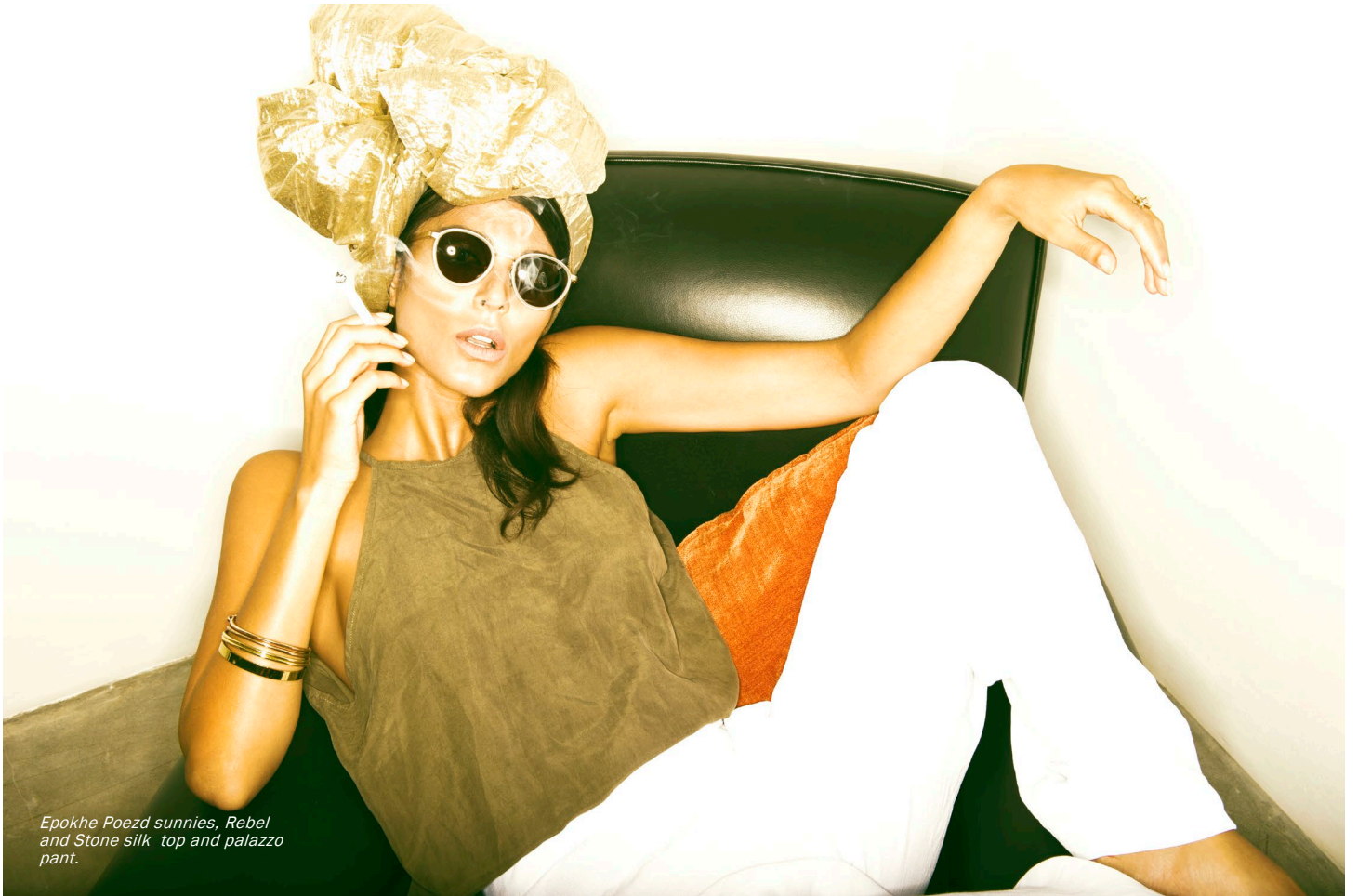
Epokhe Poezd sunnies, Rebel and Stone silk top and palazzo pant.