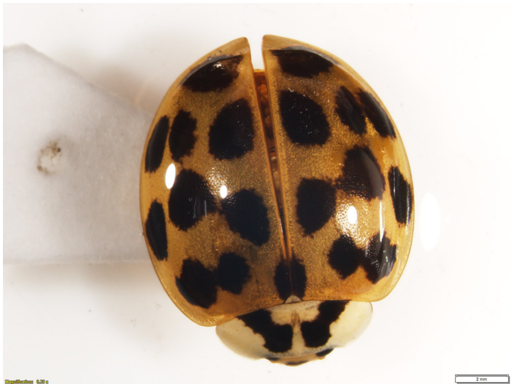
Figure 3 Harmonia axyridis from Ecuador. Photo of specimen ZSFQ-I058 from Cumbayá (USFQ campus), province of Pichincha, Ecuador, showing the typical habitus of Ecuadorian populations.