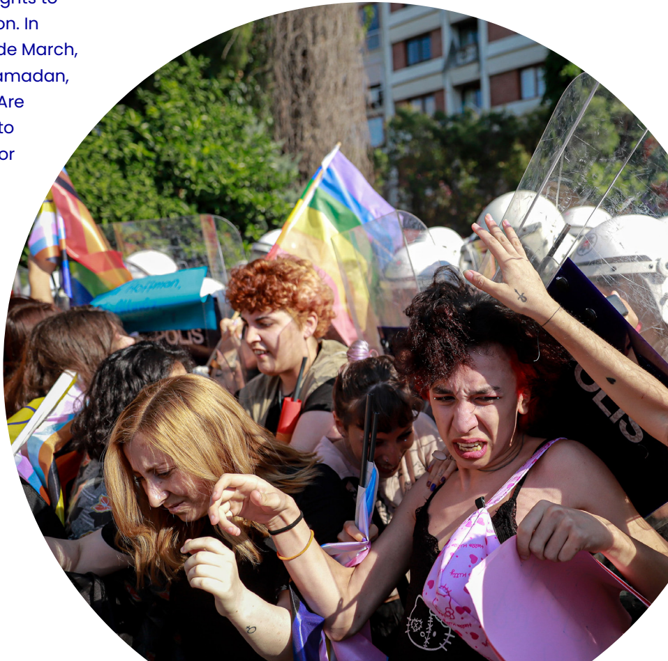
Photo: Clash during the 10th Izmir LGBTI+ Pride March in Izmir, Turkey, 26 June 2022.

In the end, Turgutlu and her team had to find ways to implement their activities “but not openly in public. Just with feminist activists and queer people.” 209