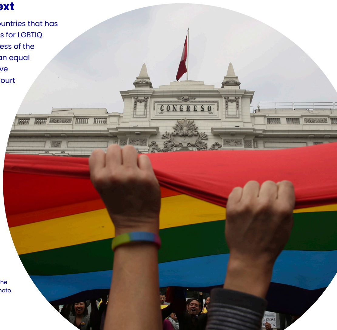
Photo: Sit-in by LGBTIQ groups in front of the Peruvian Congress in June 2019, days before the Lima Pride March.

Peru's lack of institutional commitment to LGBTIQ equality is reflected by two recent landmark judgments against it at the Inter-American Court of Human Rights. Both cases reached the Inter-American Human Rights system after plaintiffs were unable to obtain justice in national courts.