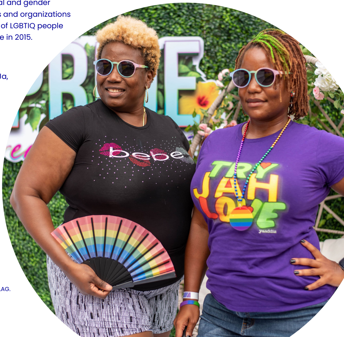
Photo: Participants at the Pride Breakfast in Kingston, Jamaica, August 2022.