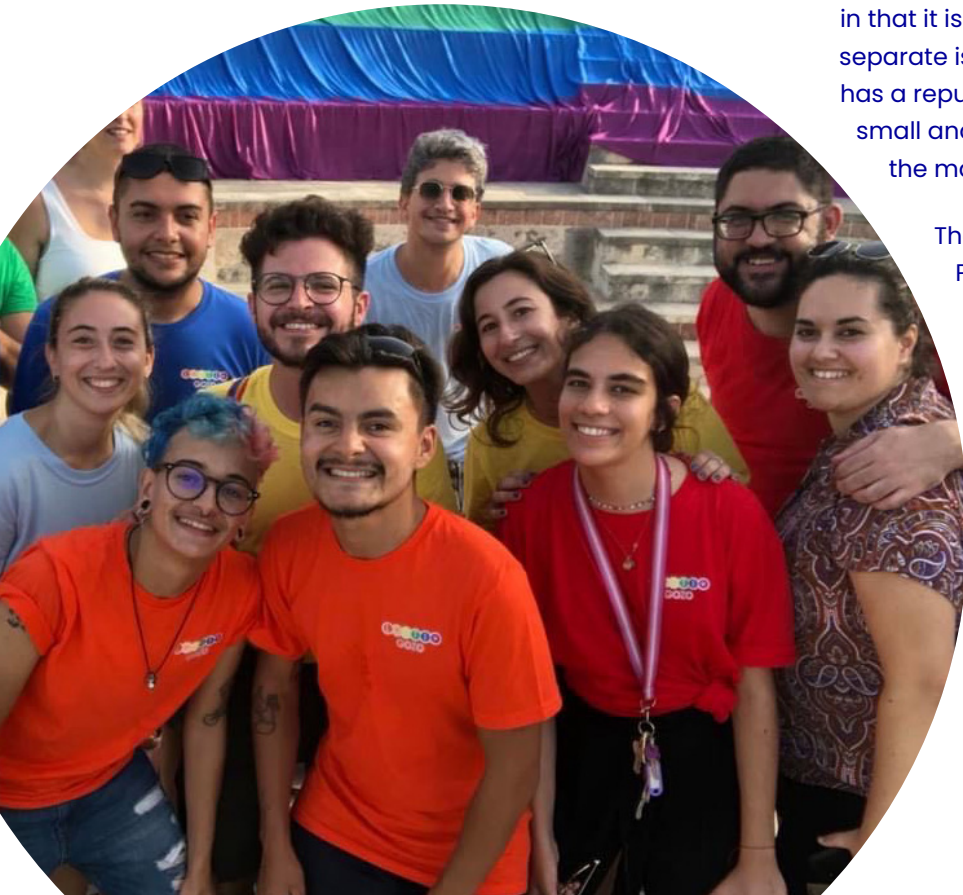
Photot: Participants at the first Pride March in Gozo, Malta.

The organization that championed the first ever Pride on the island, LGBTI+ Gozo, was founded in 2015 to offer a safe space for young LGBTIQ people who remain in Gozo and cannot go to the island of Malta as they please. 236 The organization’s activities began with workshops, with the goal of eventually conducting a public Pride march. As on the mainland, the Maltese government has been supportive, supplying an office for