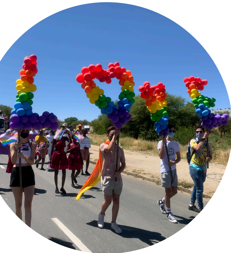
Photo: Pride Parade in Windhoek, Namibia, December 2021.

Pride activities included a march, a queer art exhibition in partnership with a feminist organization, comedy show, drag night, a roadshow involving a dance group to promote destigmatization of HIV/AIDS during the Worlds Aids Day campaign, a book reading by American nonbinary writer and performer Alok Vaid-Menon, and a theatre performance and workshop discussing the state