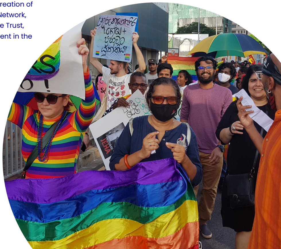
Photo: Sri Lankans march in the first public LGBTIQ march during Pride Month, June 2022.

In early 2023, a member of the country’s unicameral parliament presented a private member’s bill calling for the repeal of British laws that criminalize same-sex relations. 37 In May 2023, the Supreme Court of Sri Lanka cleared the path for this bill to proceed, issuing a ruling that the bill was not inconsistent with the Constitution of Sri Lanka. 38 Nonetheless, this bill has been the subject of controversy and has not garnered sufficient support within Parliament, causing activists who have been carrying out efforts to achieve holistic queer liberation to express skepticism. 39 Sri Lanka remains a deeply homophobic and transphobic country, with severe