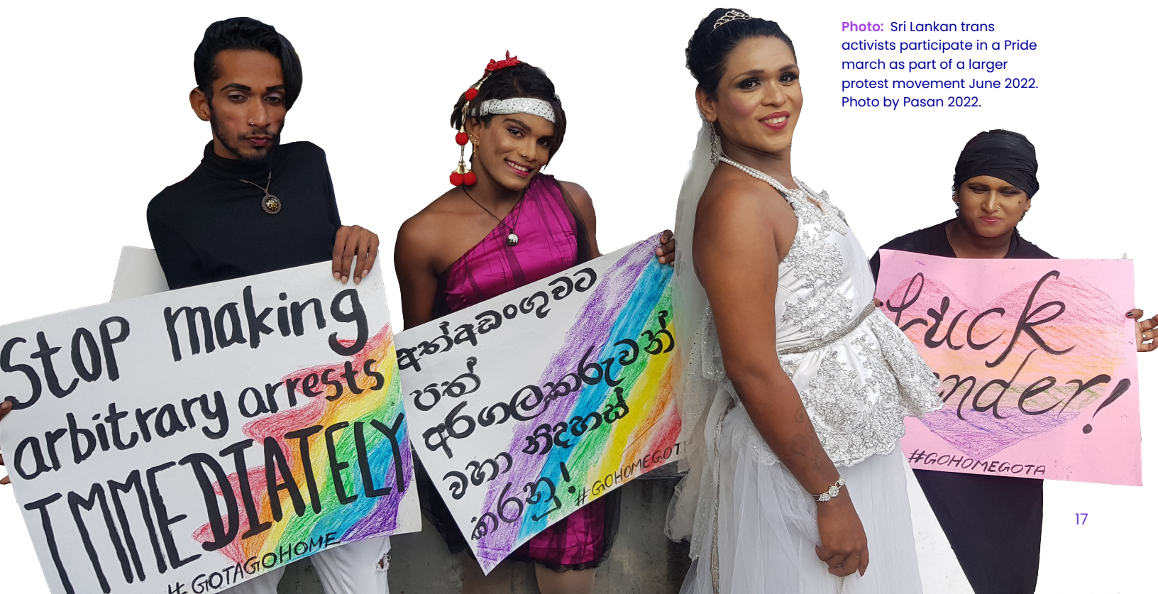
Photo: Sri Lankan trans activists participate in a Pride march as part of a larger protest movement June 2022.

Sri Lanka is a socially conservative state where any form of LGBTQ advocacy faces substantive challenges. Despite being one of the first countries in the non-Western world to achieve universal suffrage in 1931, it is also a deeply volatile state with scars of long-standing ethnonational strife, a 30-year war, unresolved issues of minority rights, and high levels of institutionalized misogyny. In such a context, the LGBTQ community has made significant forward strides despite persistent challenges and backlash from the state, elements of the general public, and religious establishments. It is against this backdrop that the 2022 Pride march and the 2023 Freedom Pride Parade represent historic milestones not only in LGBTQ rights advocacy, but also in the broader sphere of human rights advocacy in general.