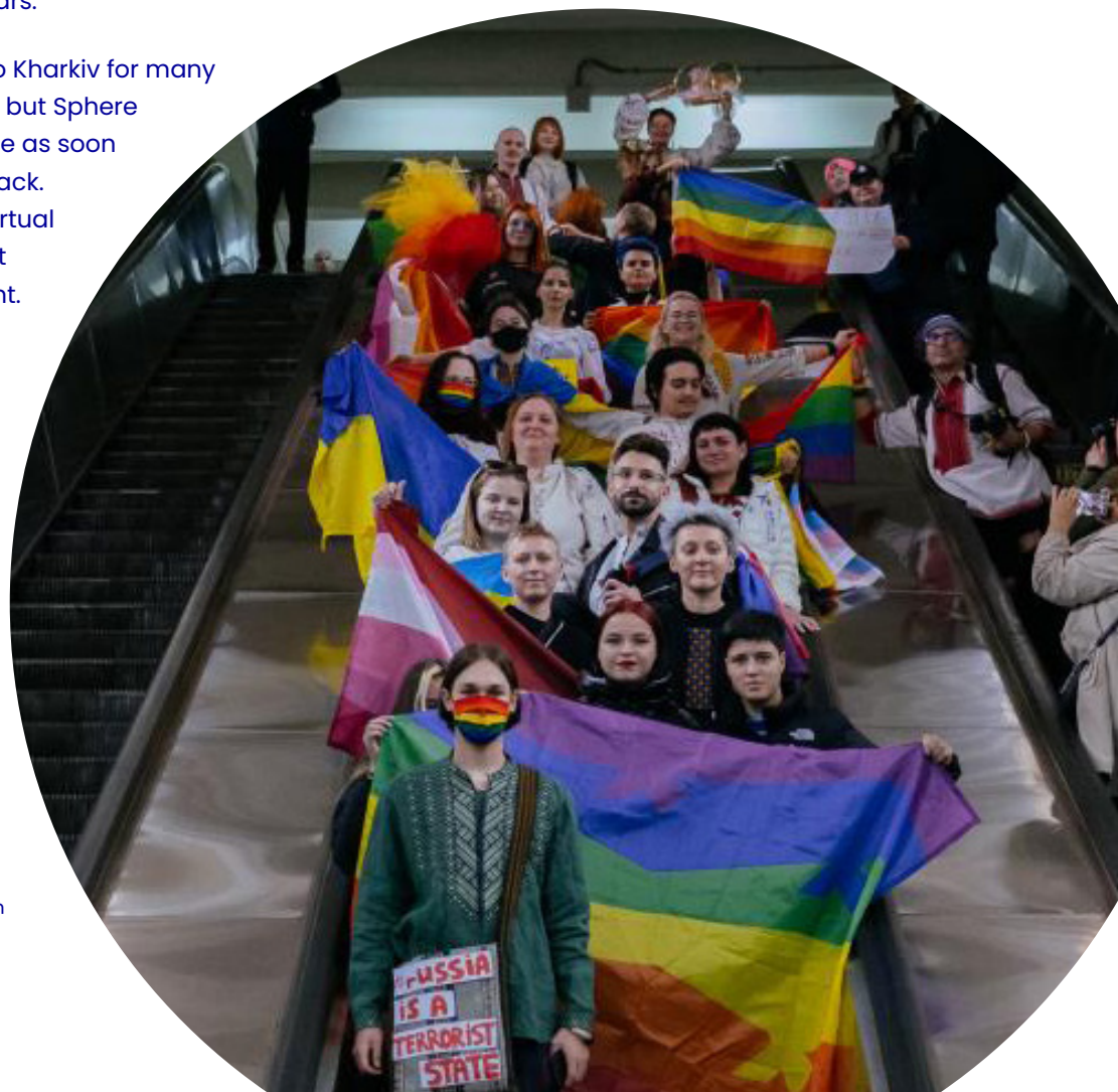
Photo: LGBTIQ activists, undeterred by Russian shelling, enter the Kharkiv subway system for Metro Pride 2022.

In the war with Russia, she added, "It is not only Ukrainians who are fighting for their national identity. It's also the LGBT+ people who are fighting for our identity as well." 75