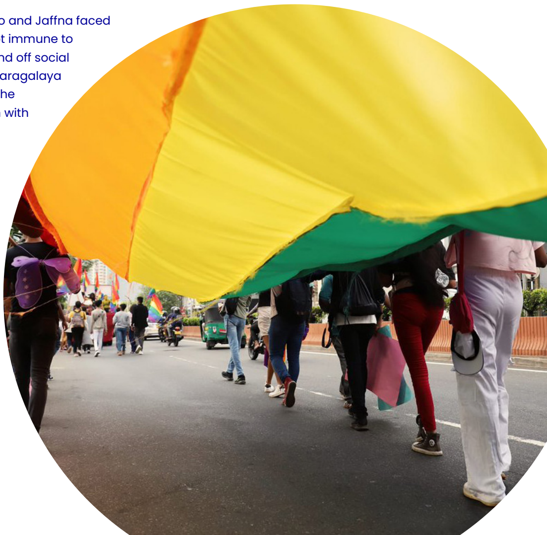
Photo: Freedom Pride Parade in Colombo, Sri Lanka, 4 June 2023.

This state-sanctioned armed suppression of the aragalaya had a negative effect on the progressive dialogues and rights discourses that accompanied it. In the months that followed, the state began arresting key actors involved in protest campaigns, under antiterrorism legislation. 50 Many international observers, including UN special procedures and treaty bodies mandate holders, have condemned Sri Lanka's use of emergency measures to crackdown on protests. 51