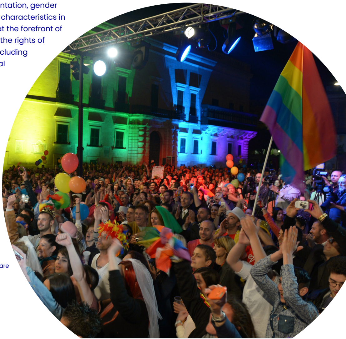
Photo: People celebrate in Saint George’s Square after the Maltese parliament approved a civil unions bill in Valletta on 14 April 2014.

Movement (MGRM) – now Malta LGBTIQ Rights Movement – started the conversation and work on LGBTIQ rights advancement, with limited resources, in the early 2000s and held Malta’s first Pride in the capital city, Valletta, in 2004. 221 About 50 participants attended, “most of whom were straight allies and some politicians who supported equality.” 222 At the time, “there was mostly backlash and ridicule. But Pride continued year after year, with