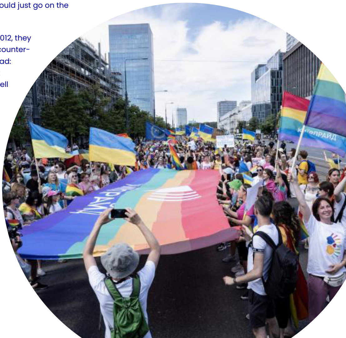
Photo: Marchers at Kyiv–Warsaw Pride 2022 show solidarity with Ukraine in the face of Russia’s invasion.

A number of high-profile guests came from the EU to participate the following year, forcing the police to take steps to protect the march. The police cordoned