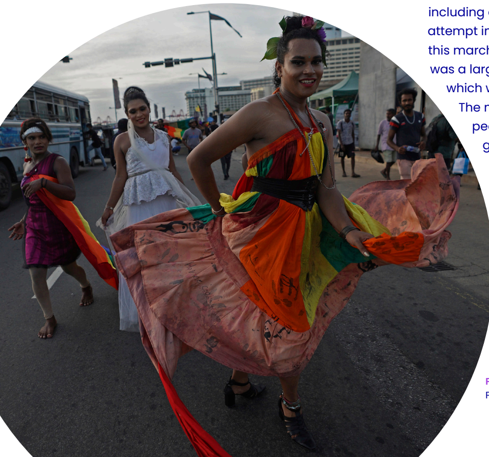
Photo: Pride parade in Colombo on 25 June 2022.

One key factor that defines Sri Lanka's Pride parade is its departure from what some activists describe as the non-profit industrial complex. In Sri Lanka, just as in many other Global South countries with anti-LGBTQ laws and practices, LGBTQ rights advocacy takes place within the non-profit sector and is almost exclusively