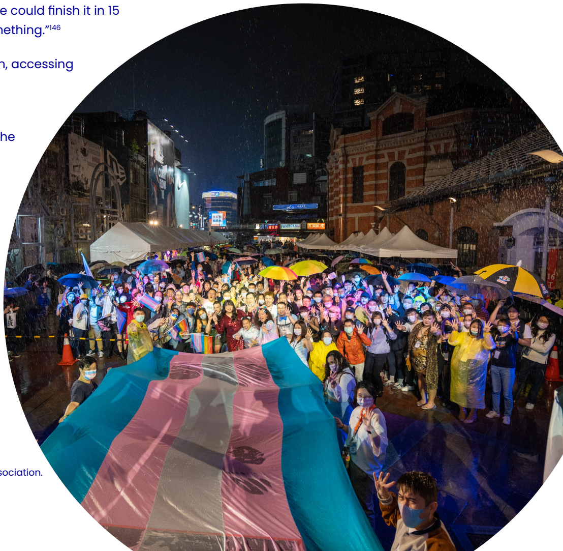
Photo: Taiwan Trans March 28 October 2022

Activists also realized that sponsorships and funding can be attached to limitations, especially in terms of social justice activism. During the first Pride celebrations in 2003, Taipei City government provided some funding for Pride, resulting in criticism from some activists. As a result, “The next year, we decided not to take funding from the government so we could avoid any form of them controlling the course of Pride and our advocacy.” 149