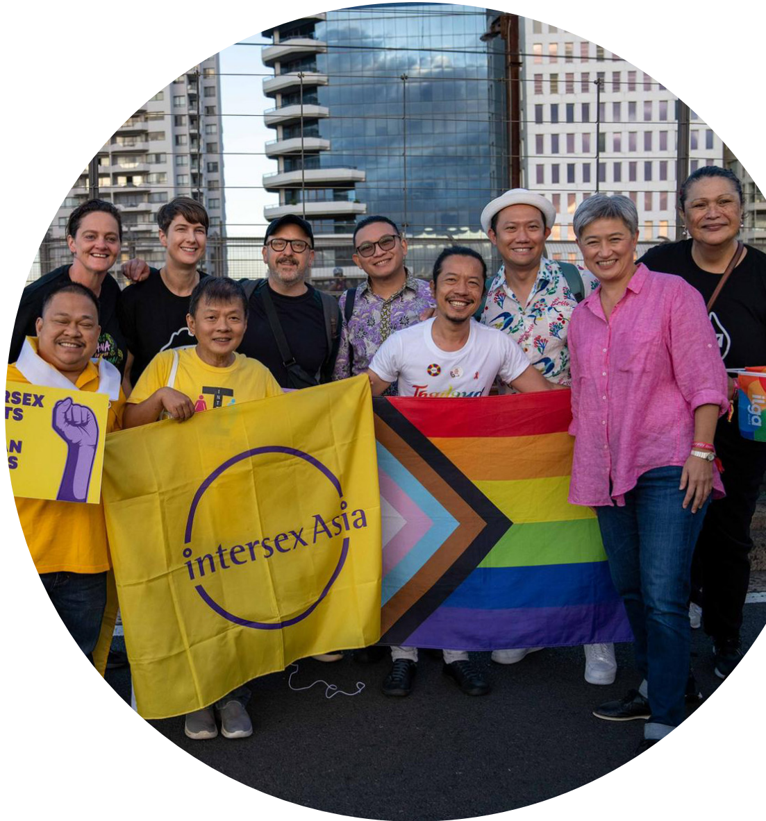
Photo: Intersex rights activists at Sydney WorldPride 2023, in March 2023.

people but will be limited by funds available.” 294 In as much as accessing funding is difficult, Champion for Change, in Nepal, is very careful about raising money for Pride because “it is our day to show visibility and celebrate who we are. We don’t want sponsors that will dictate what we should do and take away the essence of Pride.” 295