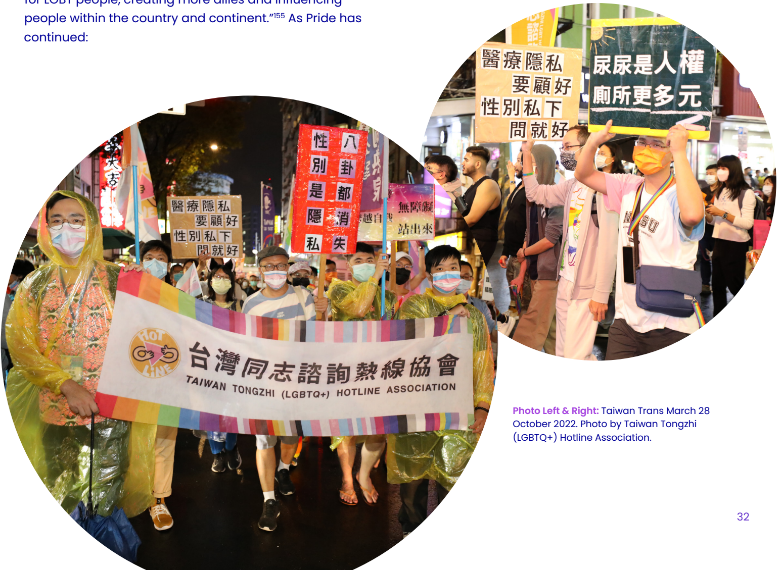
Photo Left & Right: Taiwan Trans March 28 October 2022.

In its 20th year, Pride in Taiwan included workshops on legalizing transnational marriages and legal gender recognition for trans and gender-diverse persons. 158 It