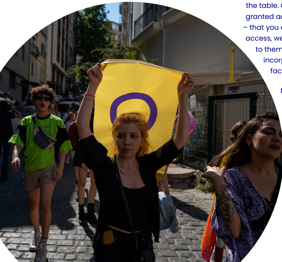
Photo: LGBTQ Pride March in Istanbul, Turkey, Sunday, June 26, 2022.

Many intersex people and rights activists express that they cannot attend Pride due to limited funding. 292 According to Hiker Chiu, "Pride is too expensive for us and it is not possible to self-fund." 293 To address this, Chukwuike said, "I feel that there should be an increase in funding for Prides so that you can incorporate more people. Pride organizers may want to incorporate more