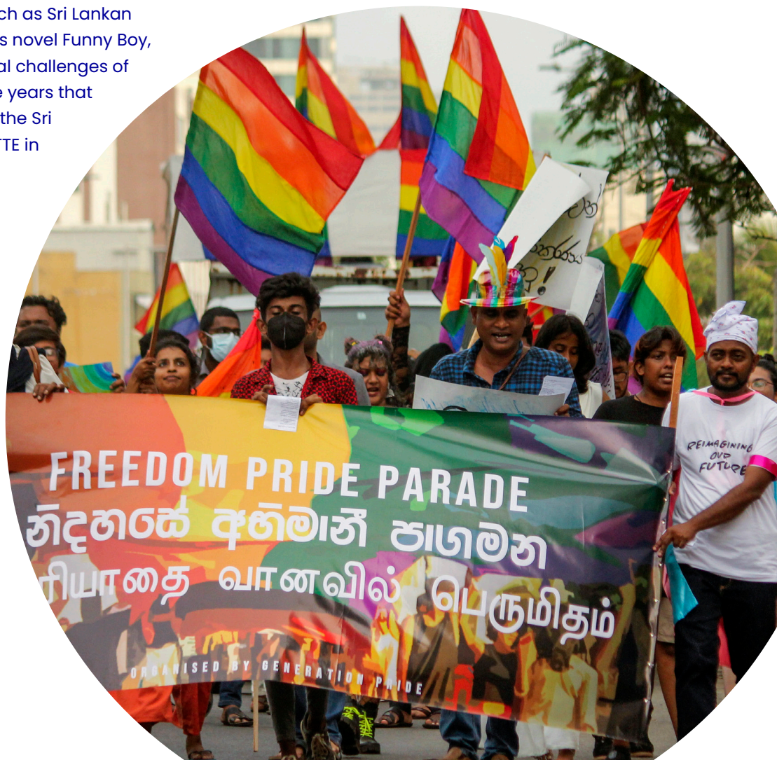
Photo: Pride month in Colombo, Sri Lanka, Sunday, 4 June 2023.

minister. The second insurrection took place in 1988-89 and was also addressed with unprecedented state violence against youth who played an active role in the insurrection. This suppression involved state-run torture chambers and sites where protesters, especially young women, were subjected to sexual violence. The state armed forces have been systematically accused by Tamil rights groups, academics, international