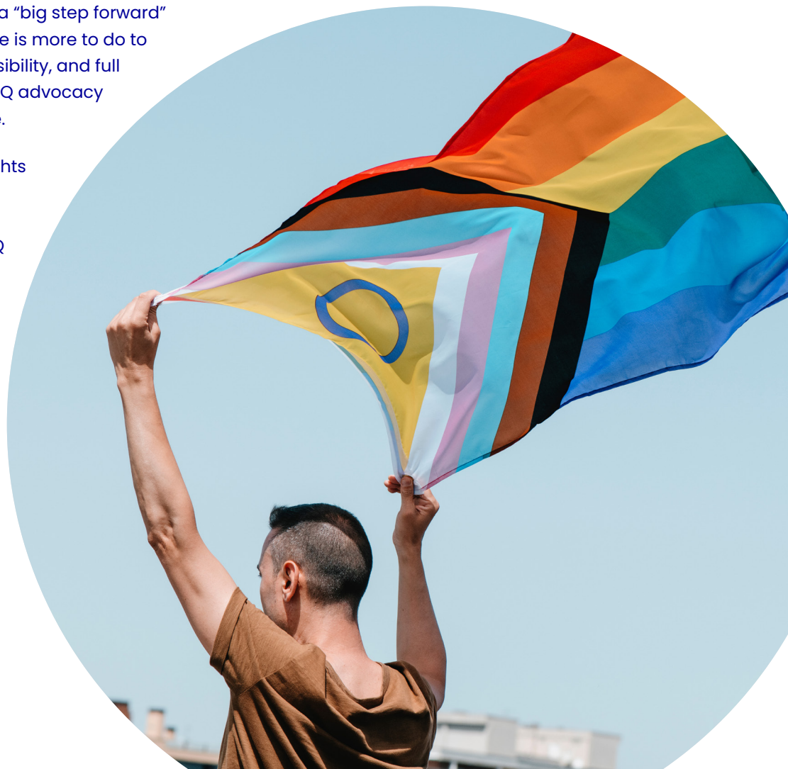
Photo: A person waves an intersex-inclusive Pride flag.