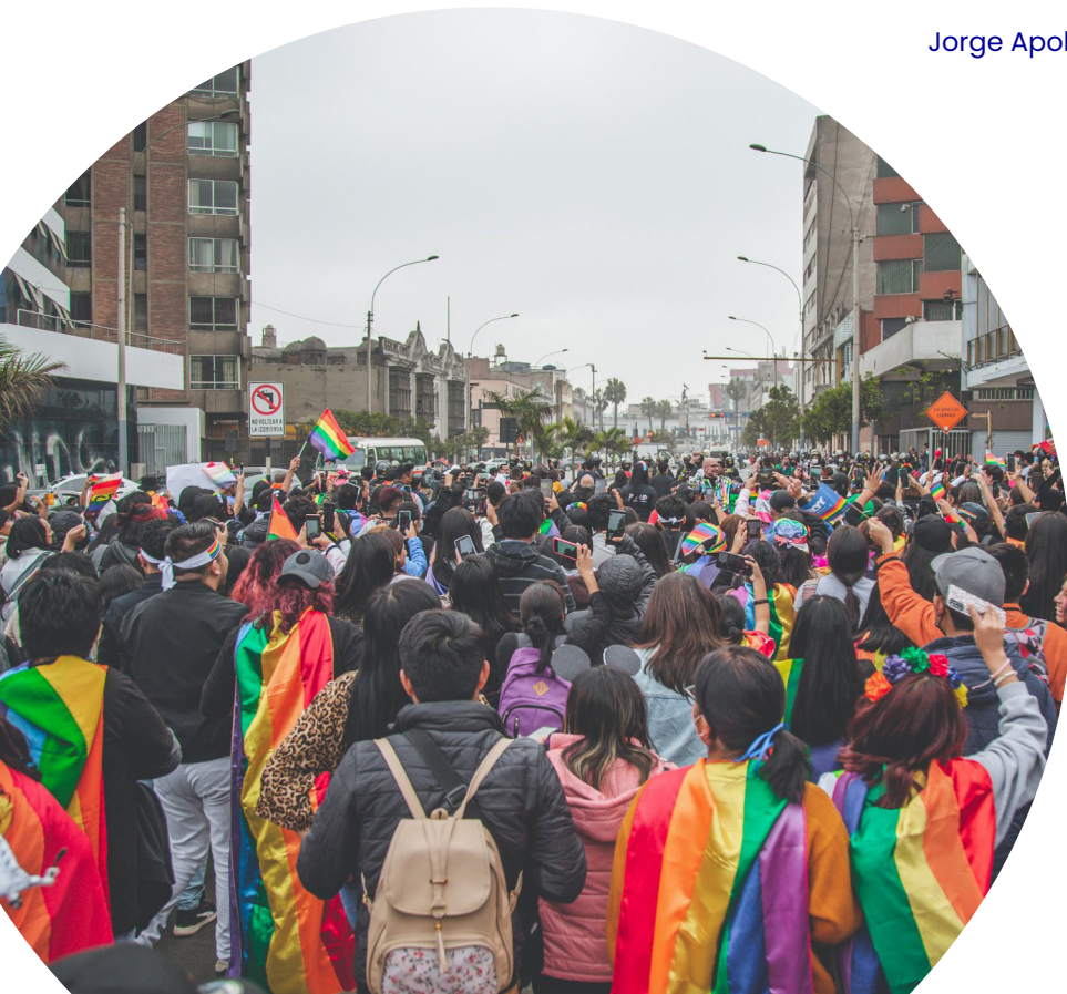
Photo: Lima Pride March, 25 June 2022.