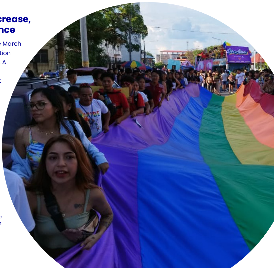
Photo: Iquitos Pride March, 28 June 2022.

I actively participated in this march mainly for the memory of my father. He died before the march took place, the year before. He always told me that he saw the marches in Lima, and asked me why they don’t do their march here, and I told him that someday maybe it will be done here. 100