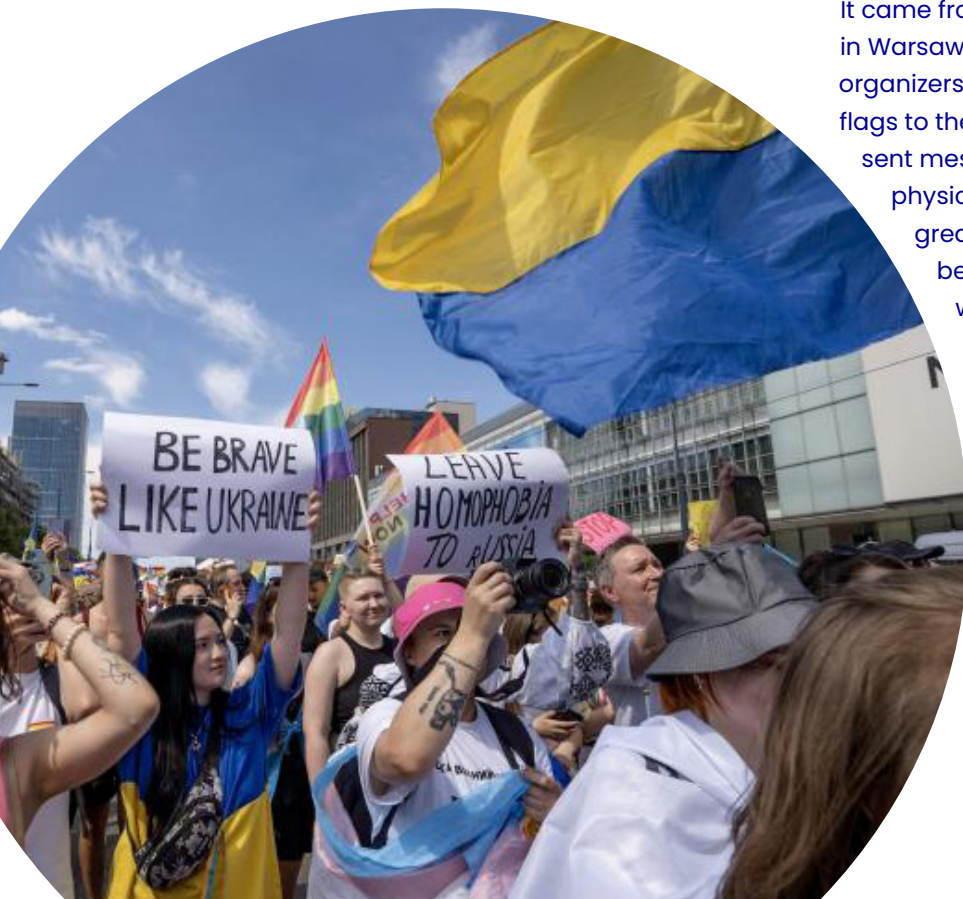
Photo: Marchers at Kyiv-Warsaw Pride 2022 show solidarity with Ukraine in the face of Russia's invasion.