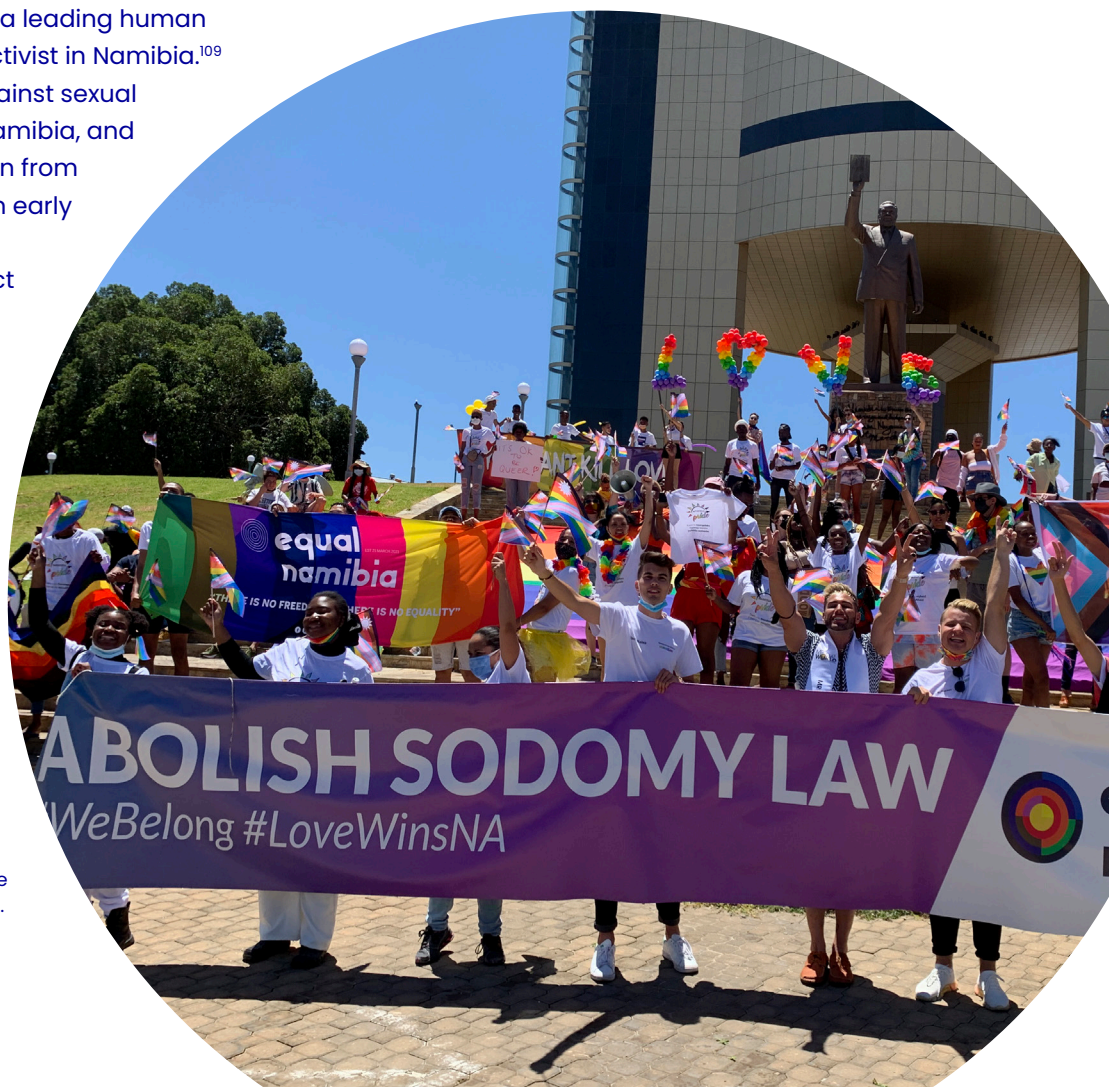
Photo: LGBTIQ people and activists at the Pride Parade in Windhoek, Namibia, December 2021.

In 2021, with Pride as an entry point, South African activists joined the Namibia Equal Rights Movement to meet with the Namibian Law Reform Commission at the