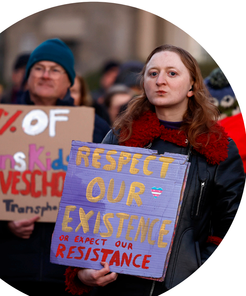
Photo: Trans rights activists at Portobello Library on 14 March 2023, in Edinburgh, Scotland.