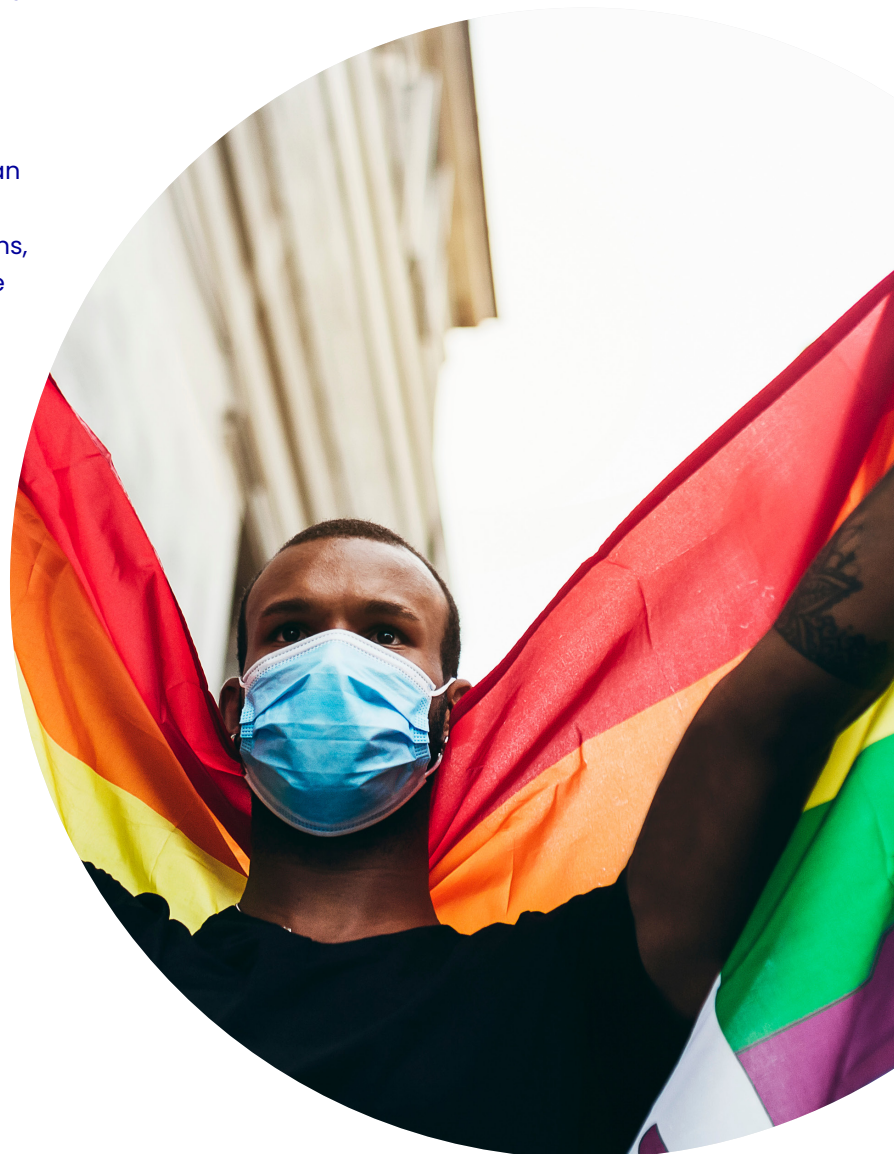
Cover photo: Taiwan Trans March 28 October 2022.

© 2023 Outright International. This work is licensed under the Creative Commons Attribution-Noncommercial- No Derivatives 4.0 International License. To view a copy of this license, visit http://creativecommons.org/licenses/by-nc-nd/4.0/ or send a letter to Creative Commons, PO Box 1866, Mountain View, CA 94042, USA.