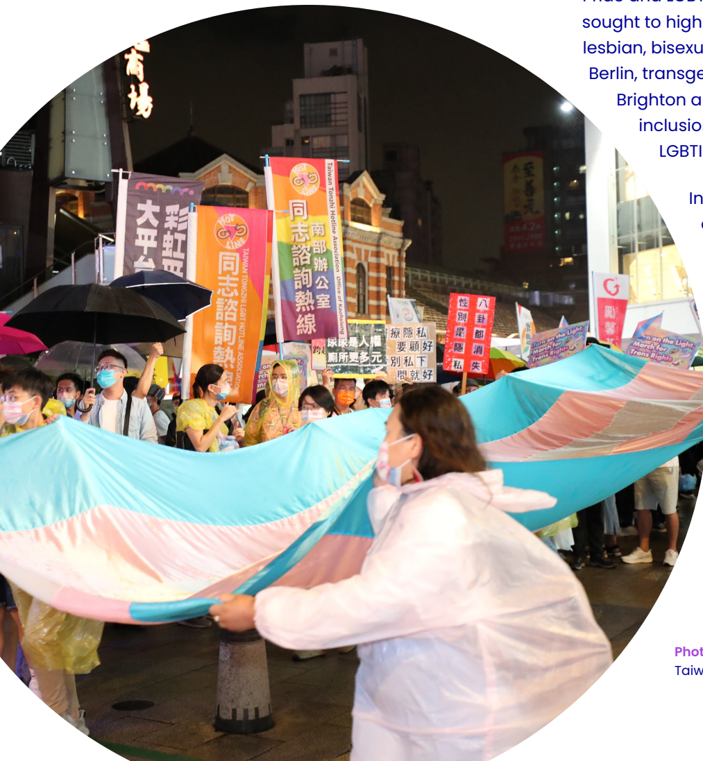
Photo: Taiwan Trans March 28 October 2022.

In addition, we distributed an online questionnaire across Outright networks of activists around the world, asking whether Pride or LGBTIQ visibility events took place in 2022. The survey was distributed in English, French, and Spanish, and allowed responses in any language. For our research purposes, we defined Pride and visibility events as “public-facing, open, and visible events with the purpose of affirming the existence of LGBTIQ people, demanding recognition and protection of our rights, and/or celebrating progress. This may include not only events labeled as ‘Pride’ but also