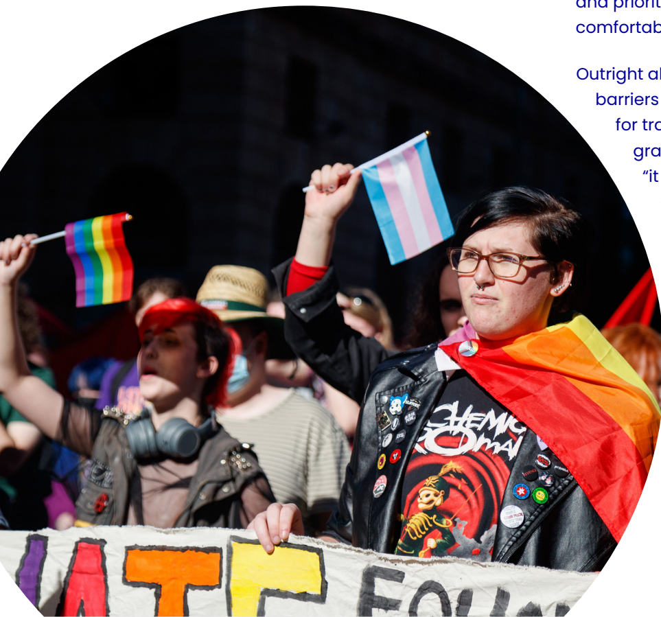
Photo: Brisbane, Australia Pride March, 25 June 2022.

You can’t just go to Pride as an organization, you still have to fight for a platform, you still have to pay for your space there which is why the big corporations and bigger charities are more visible. 314