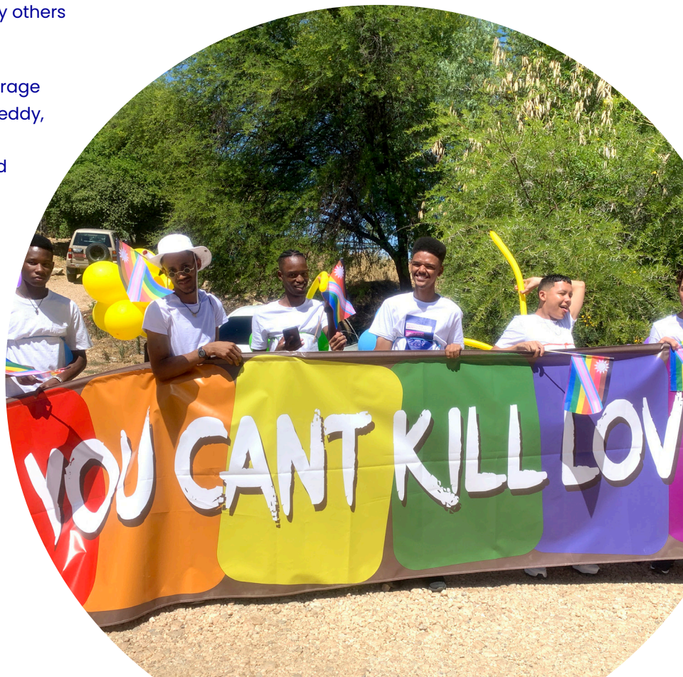
Photo: Pride Parade in Windhoek, Namibia, December 2021.

Funding also plays a major role in terms of inclusion. Ensuring participation of LGBTIQ people across the country for Pride events is extremely difficult. It is difficult to mobilize everyone to showcase the sheer massive number of LGBTIQ people in Namibia, for example. Not everyone can show up. I don’t see a lot of faces during our Pride events because of financial constraints. This is also one of the key factors that makes or breaks Pride events. When you march with only seven, twenty, or fifty people, people assume that