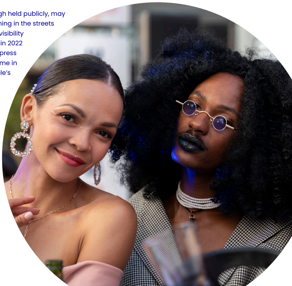
Photo: Drag Night Namibia “Rain-Ball”, Windhoek, December 2022.

All over the world, creating safe spaces for people marginalized by mainstream societal standards is a human rights priority. Many LGBTIQ people Outright