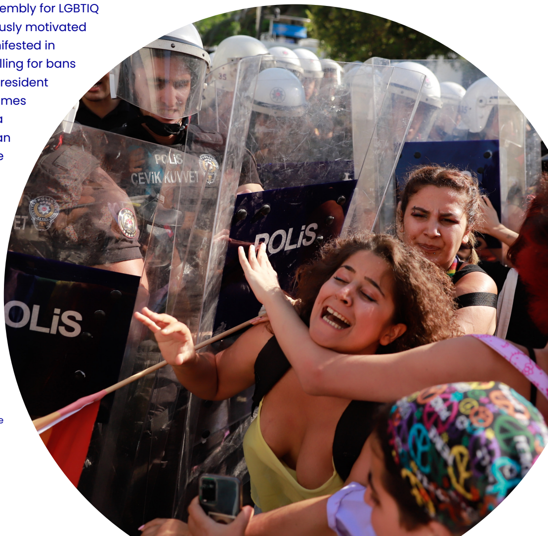
Photo: Clash with riot police officers during the 10th Izmir LGBTIQ+ Pride March in Izmir, Turkey, on Sunday, 26 June 2022.

after which organizers did not attempt a Pride March for another 10 years. 179 The 2003 Pride march in Istanbul saw about 50 people. This number had risen to “hundreds of thousands of people” by 2013. The last marches in Istanbul before Pride became targeted by heavy-handed state crackdowns were a Pride March in 2014 and a Trans Pride March on 22 June 2015. A week after the successful Trans Pride March, however, the police prohibited