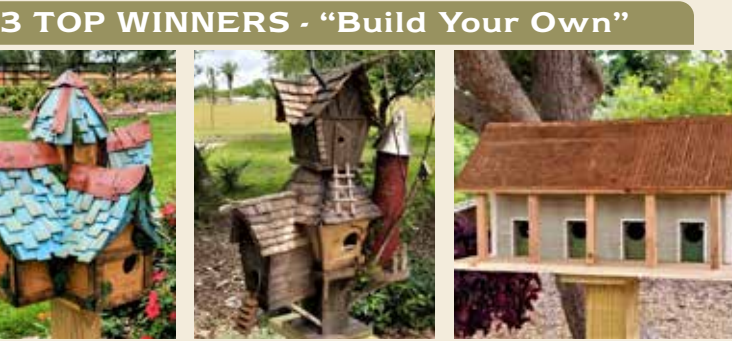
Kimmi Norvell Moake