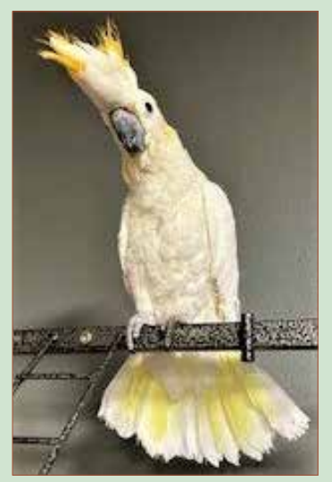
PEACHES, an 11 year-old Citron Cockatoo on the fast track already appears in the Reptile Room and has been sponsored. She was rescued, then entrusted to Gardens for care.

AJ & CHILI are Green Cheek Conures whose family moved to colder climes, but wanted birds to stay in Texas warmth!