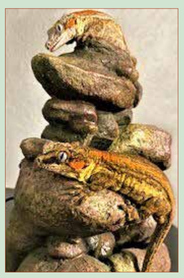
HARLEY & JOKER are Gargoyle Geckos, our two newest reptiles.

AJ & CHILI are Green Cheek Conures whose family moved to colder climes, but wanted birds to stay in Texas warmth!