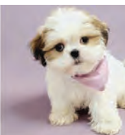
SHIH-TZU PUPPIES Beautiful Males & Females Price to Sell Call 718-306-4136