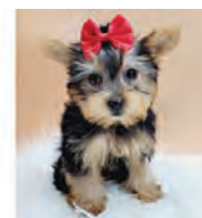
YORKIE PUPPIES ADORABLE, pure bred, toy & teacup sizes. Call 718-306-4136