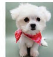
MALTESE PUPPIES Adorable males and females, toy or teacup sizes, shots and papers. Call 718-306-4136