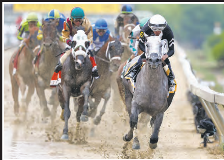
'TOGA PARTY': Hall of Fame trainer D. Wayne Lukas said Seize the Grey would likely run in the Belmont Stakes after his wire-to-wire win in the Preakness on Saturday.