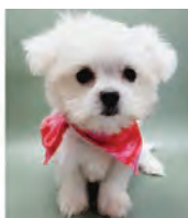
MALTESE PUPPIES Adorable males and females, toy or teacup sizes, shots and papers. Call 718-306-4136