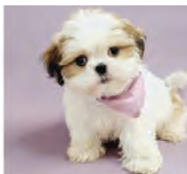
SHIH-TZU PUPPIES Beautiful Males & Females Price to Sell Call 718-306-4136