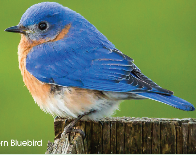
Male Eastern Bluebird

Urban nature keeps cities cool, captures carbon, shelters wildlife, reduces stress, and provides flood and erosion control. Nature Canada is getting behind municipalities in their push to protect natural spaces within their boundaries. Together