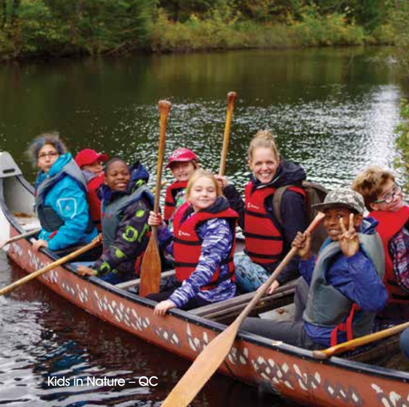
Kids in Nature – QC