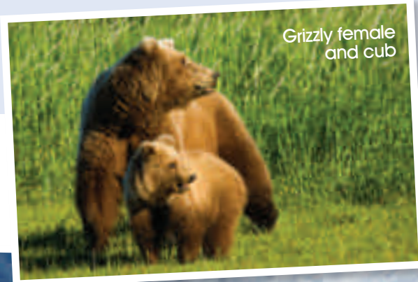
Grizzly female and cub

We are a vibrant, healthy organization with five effective and successful programs: NatureWatch , NatureVoice , NatureCaretakers , NatureHood and NatureNetwork . We work to keep you, our members and supporters, informed and involved on issues that are important to you and your families. We treasure every single gift we receive and we are transparent and accountable to you. We take care each and every day to ensure we spend your investment in ways that achieve crucial and inspiring victories for wild species and their habitats in your area and across Canada.