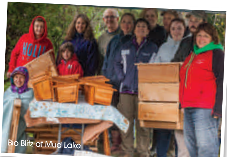
Bio Blitz at Mud Lake

You are also helping us better understand the recent sharp decline in Purple Martin populations in Ontario (diving from about 25,000 in 2005 to less than 15,000 today). Your gifts are funding an urgent, time-sensitive research project where the migrating birds are outfitted with a tiny GPS tag, allowing scientists to track them with incredible accuracy. Your continued support will help us record and monitor the data being collected so we can make sound, science-based recommendations to help protect and increase the Purple Martin population. Your gifts to Nature Canada fund a variety of innovative and critical projects like this.