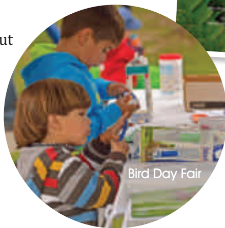
Bird Day Fair

Our NatureHood project inspires citizens to seek out wildlife in 'urban nature', learning in engaging ways how human actions are connected to local species, our environment and our health. If we are to win the battle to restore nature, we must be active in Canada's cities—where most Canadians live. Your gifts help us connect kids and nature lovers of all ages to nature at their doorstep.