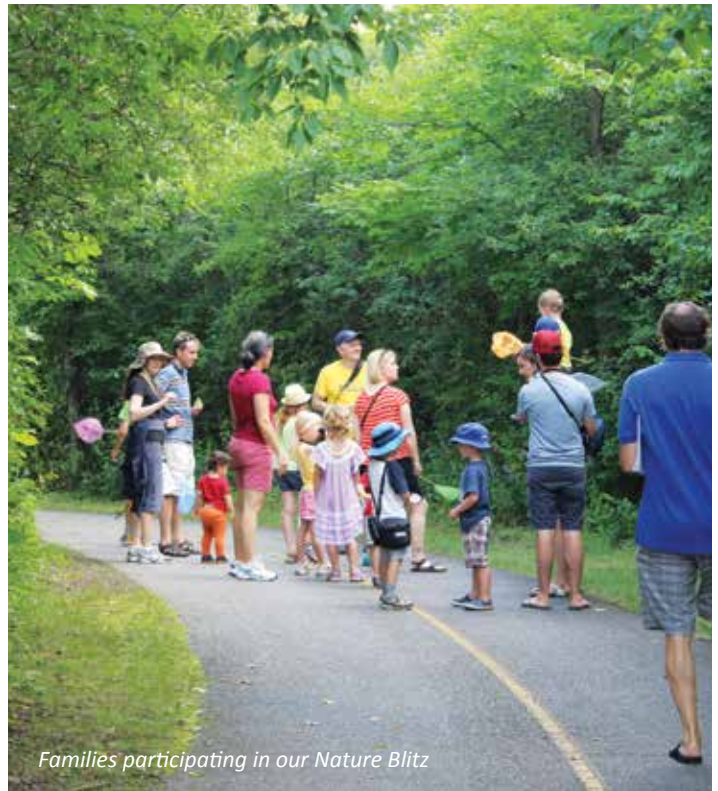
Families participating in our Nature Blitz

Nature Canada believes that the new federal government to be elected on October 19, 2015 must place a much higher priority than ever on protecting nature—for all of our futures. Your continued support of Nature Canada ensures that nature's voice will be heard on Parliament Hill. Together, let's try to make the next government the best ever for nature.