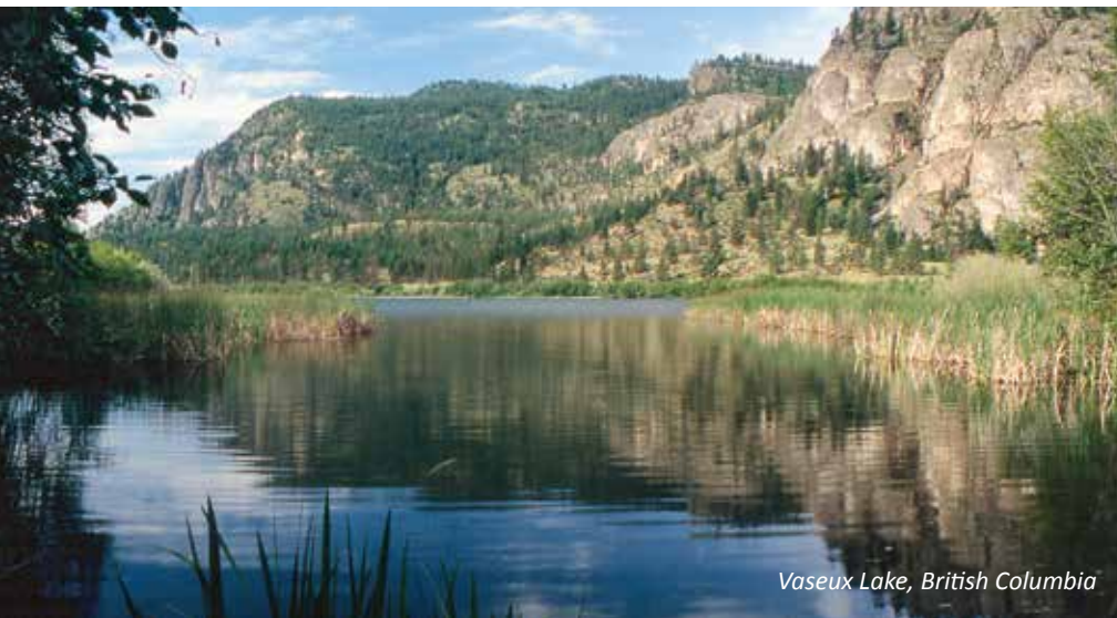
Vaseux Lake, British Columbia