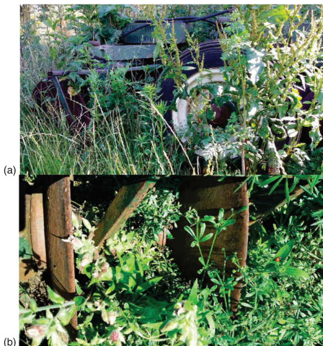
Figure 1.2 Images of agricultural machine left in a field for decades (a). A closer view clearly shows the presence of rust (b).