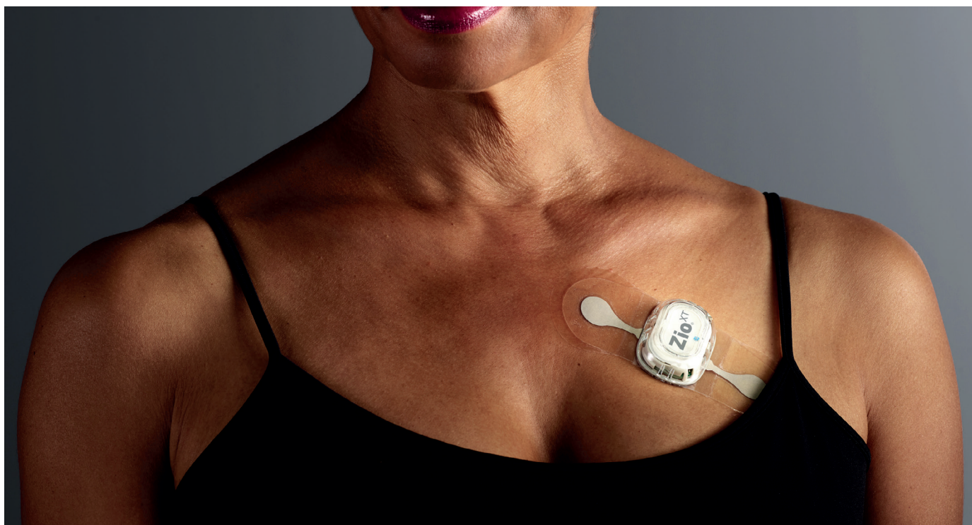
The single-use Zio patch from iRhythm in San Francisco, California, can monitor heart rate continuously for two weeks to detect irregularities.

Regulatory approval is crucial, and challenging to obtain. Hardware is largely covered by existing frameworks; algorithms are not. But there are encouraging signs that software applications can be regulated. In the past few years, the FDA has approved machine-learning technology for the diagnosis of diabetic retinopathy, the first pill with an embedded sensor (Abilify MyCite) and an app to treat opioid-use disorder (reSET-O). The FDA's pre-certification programme allows medical software from certain trusted developers to be deployed before formal evaluation.