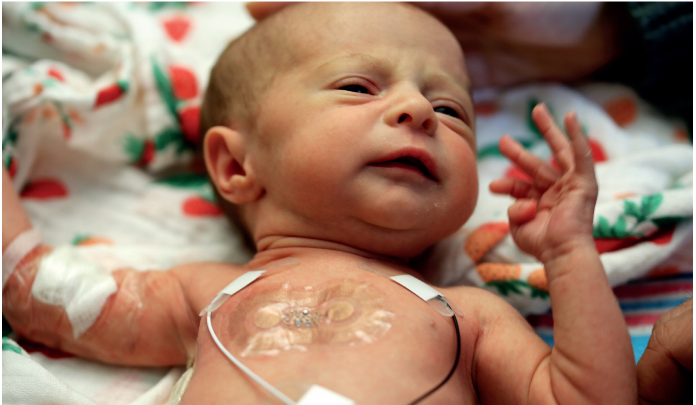
Sensors soft enough to be used on a premature baby's skin can monitor vital signs in the neonatal intensive care unit.