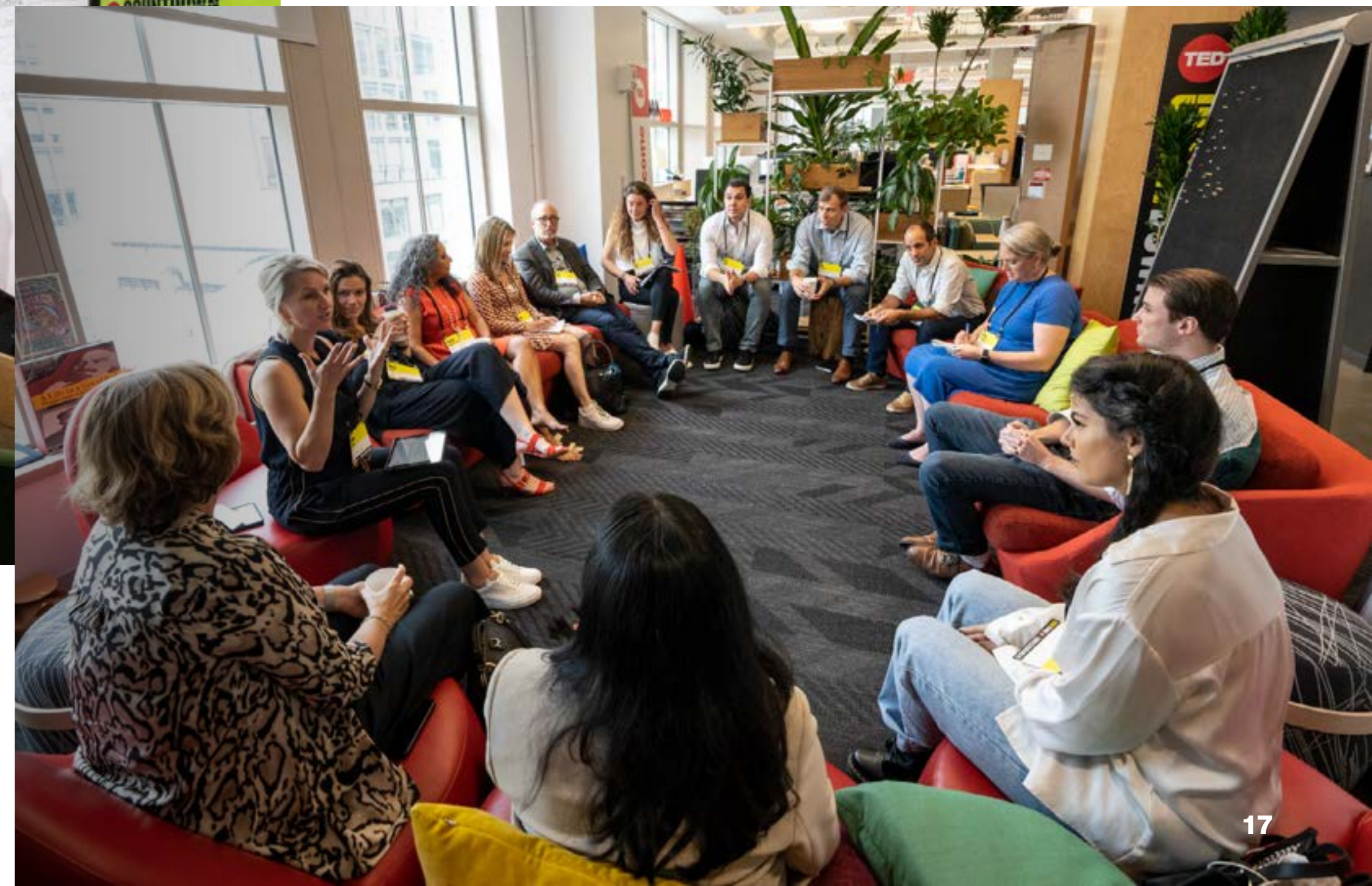
Images from the Dilemma Session event held at the TED World Theater (NYC) in June.