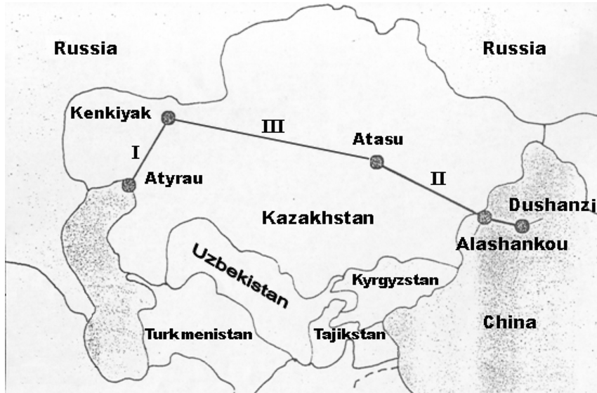
Map 1 Sino-Kazakh oil pipeline