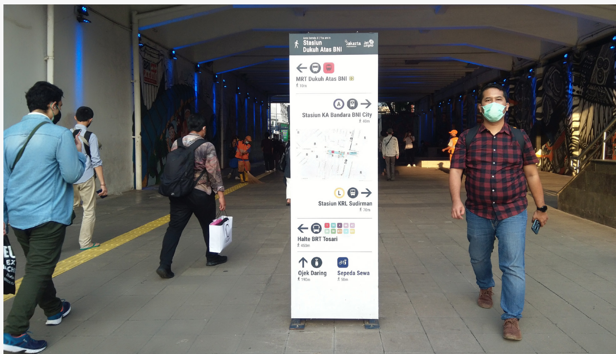
Jakarta's public transport remained resilient serving residents during the 2020 pandemic.

This progress was only possible through collaboration between the city, technical experts, civil society groups and, ultimately, its citizens. The strong collaborative spirit that the city has forged over the years has become a key driver in transforming Jakarta into a “Maju Kotanya, Bahagia Warganya” (a progressive city with happy residents).