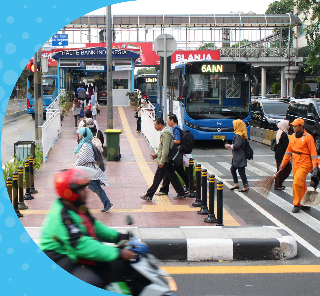
Transjakarta BRT.