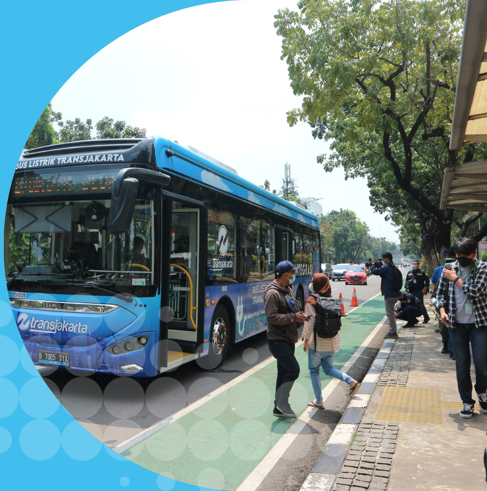
Tranjakarta's electric bus trial in 2021