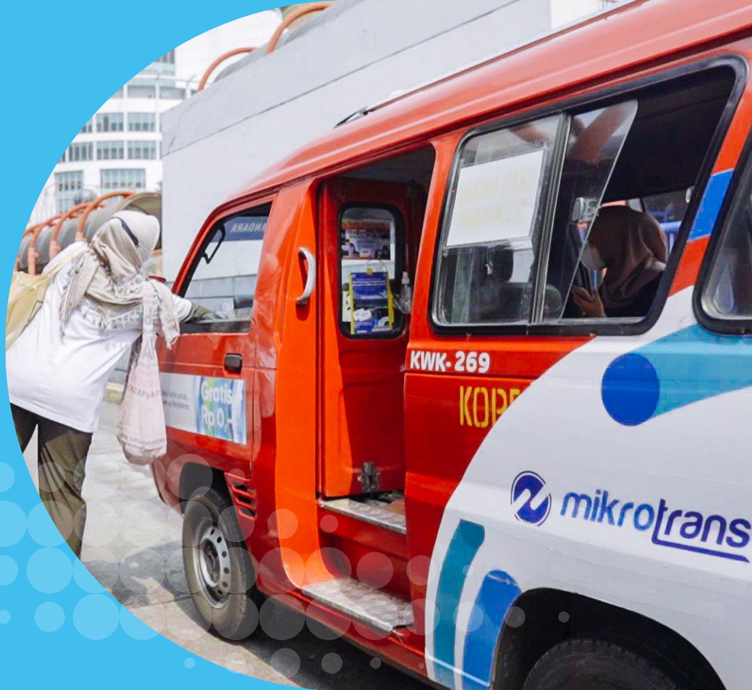
Microtrans vehicles, part of the Transjakarta system, require service standards.

Transjakarta was first introduced as a BRT system in 2004 to serve commuters in the Greater Jakarta Metropolitan Area (Jabodetabek) and it has gradually expanded. From 2015 to 2020, the total number of routes have increased by 850%. Currently, Transjakarta has 13 corridors in operation, with a total of 255 routes. As a result, Transjakarta now serves 82% of the population in Jakarta.