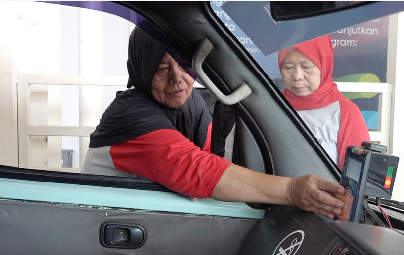
Passengers tap the Jak Lingko fare card while entering the Mikrotrans vehicles.