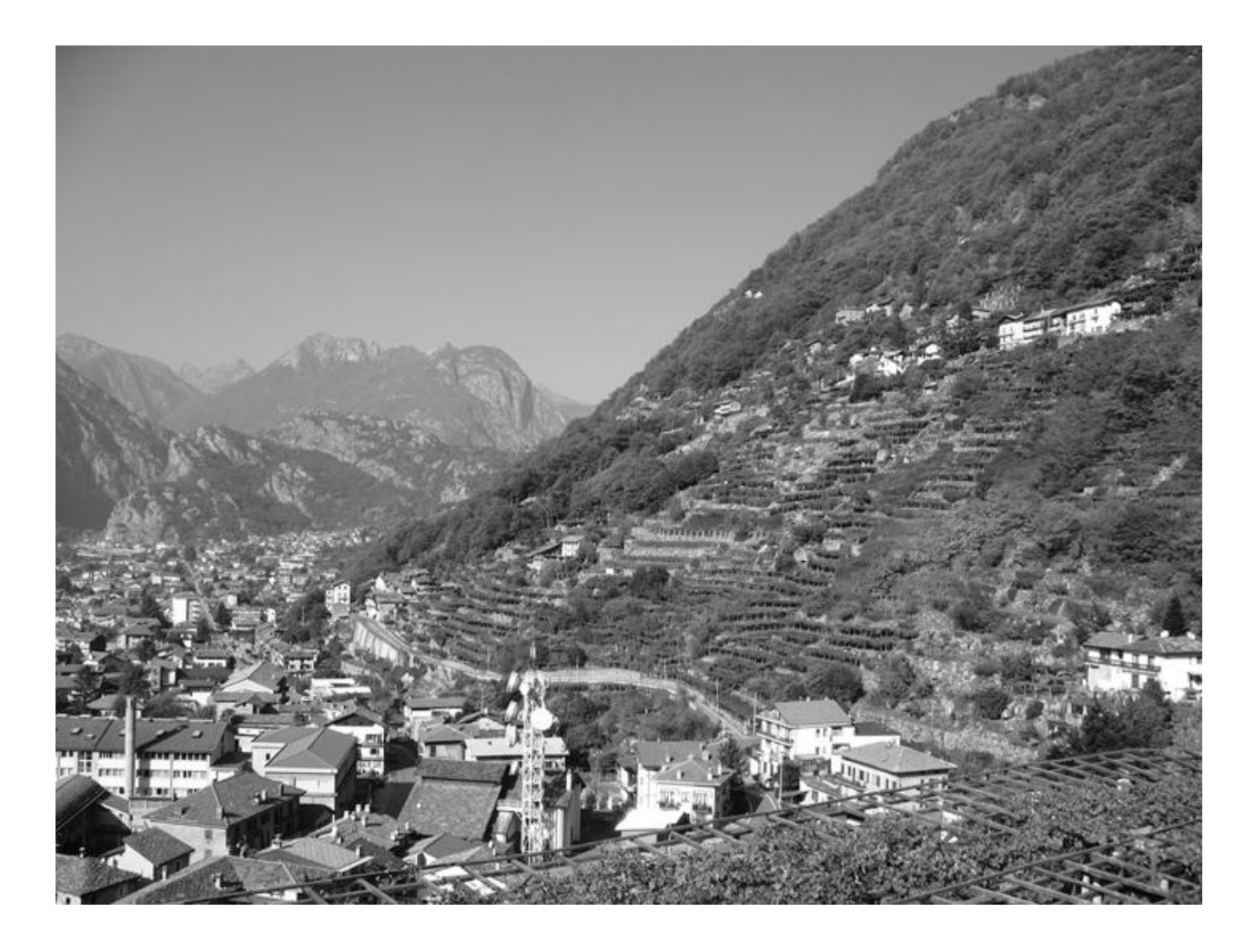
Figure 2: terraced slopes in Valle d'Aosta. Structural typologies and details. a) wall foundation; b) connection between terraces; c) example of restored wall; d) terraced slope - vineyard; d) terraced slope – chestnut wood; e) detail of wall structure