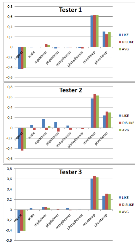
Fig. 3. Average values of style parameters of pieces highly evaluated by the testers (evaluations of 0.5 and 1) and pieces low evaluated (evaluations of -1 and -0.5) in comparison to averages of style parameters in the whole population.

(see Fig. 3). The analysis of these graphs allows to observe that the testers have different style parameters in the pieces they prefer. For instance, it is easy to observe that Tester 2 negatively judges pieces with low repetition rate of motives. The same pieces are evaluated higher by Tester 3 or Tester 1 positively evaluates pieces with low variance of notes height in motives, unlike Tester 2.