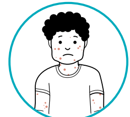
After MMR and varicella vaccines: fever, rash, and other side effects may occur about 1-2 weeks after immunization