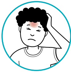
Tiredness and headache