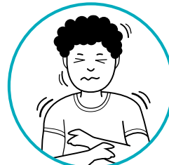
Fever, chills, and shivering