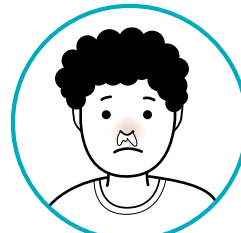
After the nasal spray influenza (flu) vaccine: nasal congestion and runny nose