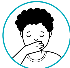
Nausea, vomiting, and diarrhea