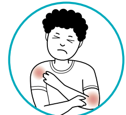
Muscle and joint soreness