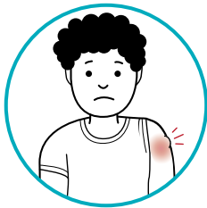
Pain, redness, and swelling where the vaccine was given

For COVID-19 vaccines: can occur up to 7 days after